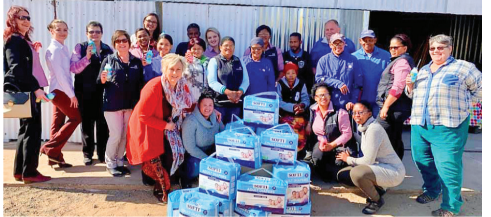
“A winner is a dreamer who never gives up.” – Nelson Mandela. Lange Carr & Wessels vat hande met APD. Hulle het lekker partytjie gehou en kon 350 volwasse doeke skenk.