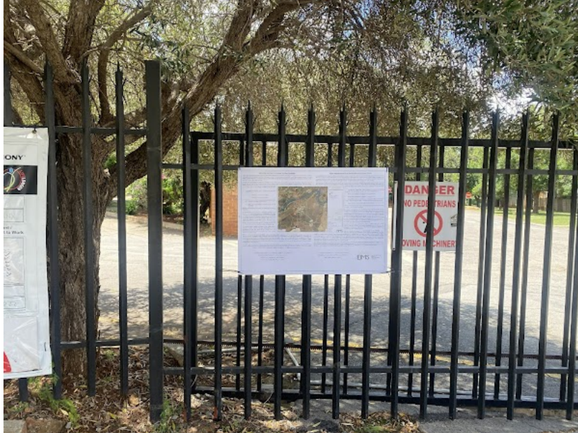
Site Notice 5

A1 Notice: 23/11/2022 13:31:16; GPS Coordinates: -26.934167, 26.769353