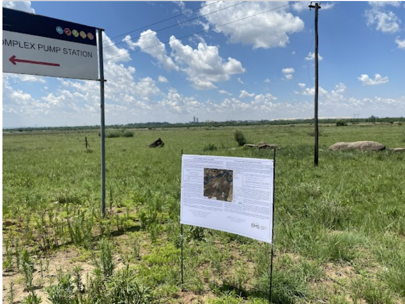
Site Notice 2

A1 Notice: 23/11/2022 10:47:01; GPS Coordinates: -26.934472, 26.772750