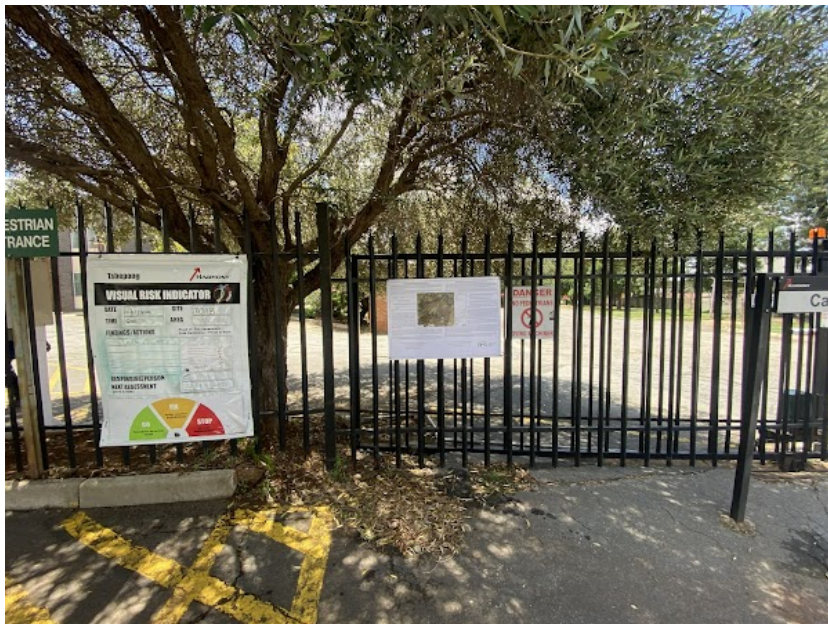
Site Notice 5 Far