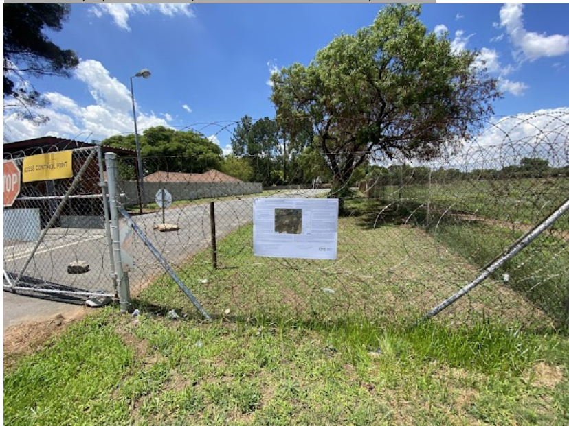
Site Notice 4

A1 Notice: 23/11/2022 12:01:12; GPS Coordinates: -26.926428, 26.741250