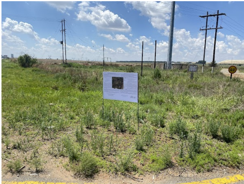
Site Notice 1

A1 Notice: 23/11/2022 10:47:01; GPS Coordinates: -26.934472, 26.772750