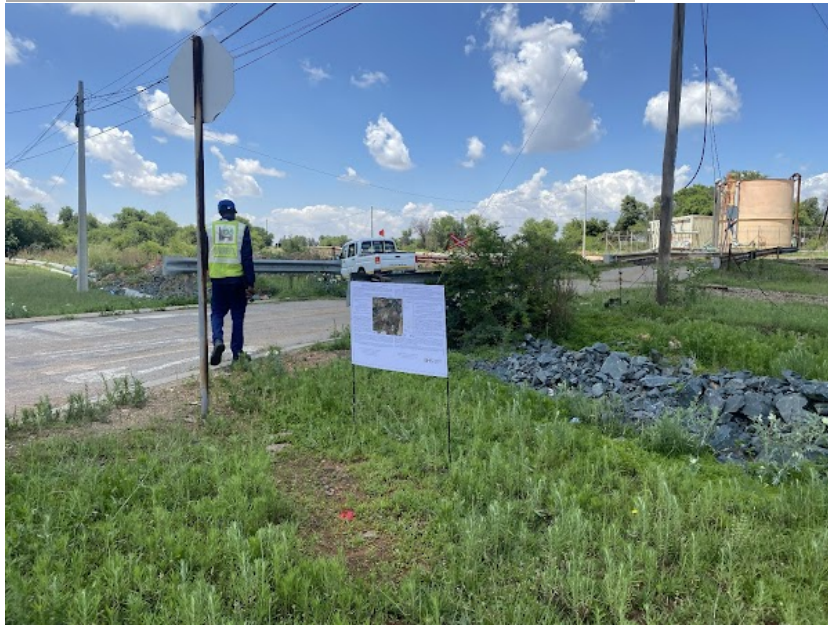
Site Notice 2

A1 Notice: 23/11/2022 13:12:05; GPS Coordinates: -26.948264, 26.781528