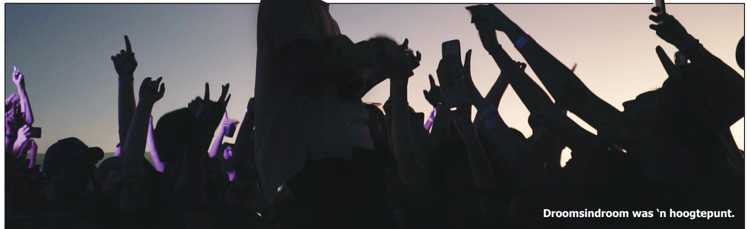
Droomsindroom was 'n hoogtepunt.

Na 'n ruskans gaan die Melk Fest-organiseerders koppe bymekaar sit vir volgende jaar, want verseker hulle, die Melk Fest gaan beslis weer in Klerksdorp aangebied word.