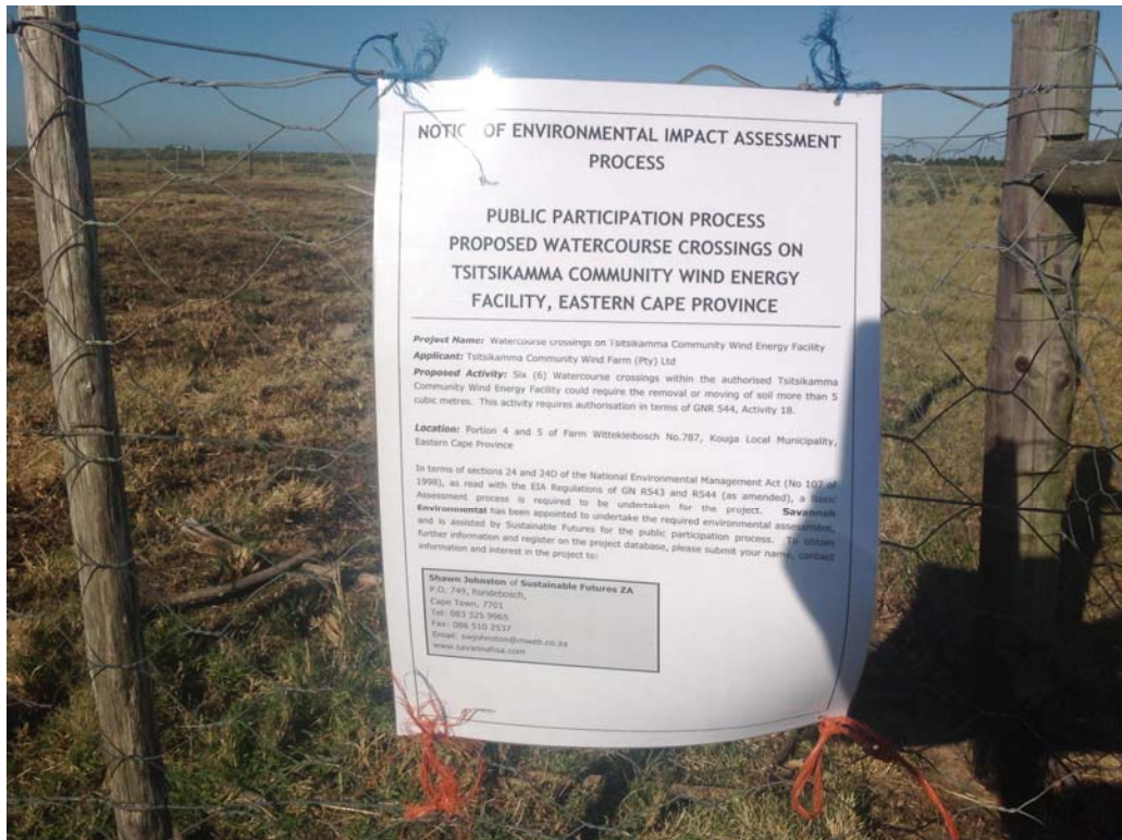
Site notice placed on the boundary fence of the TCWF site