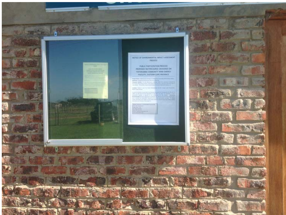
Notice placed at community centre