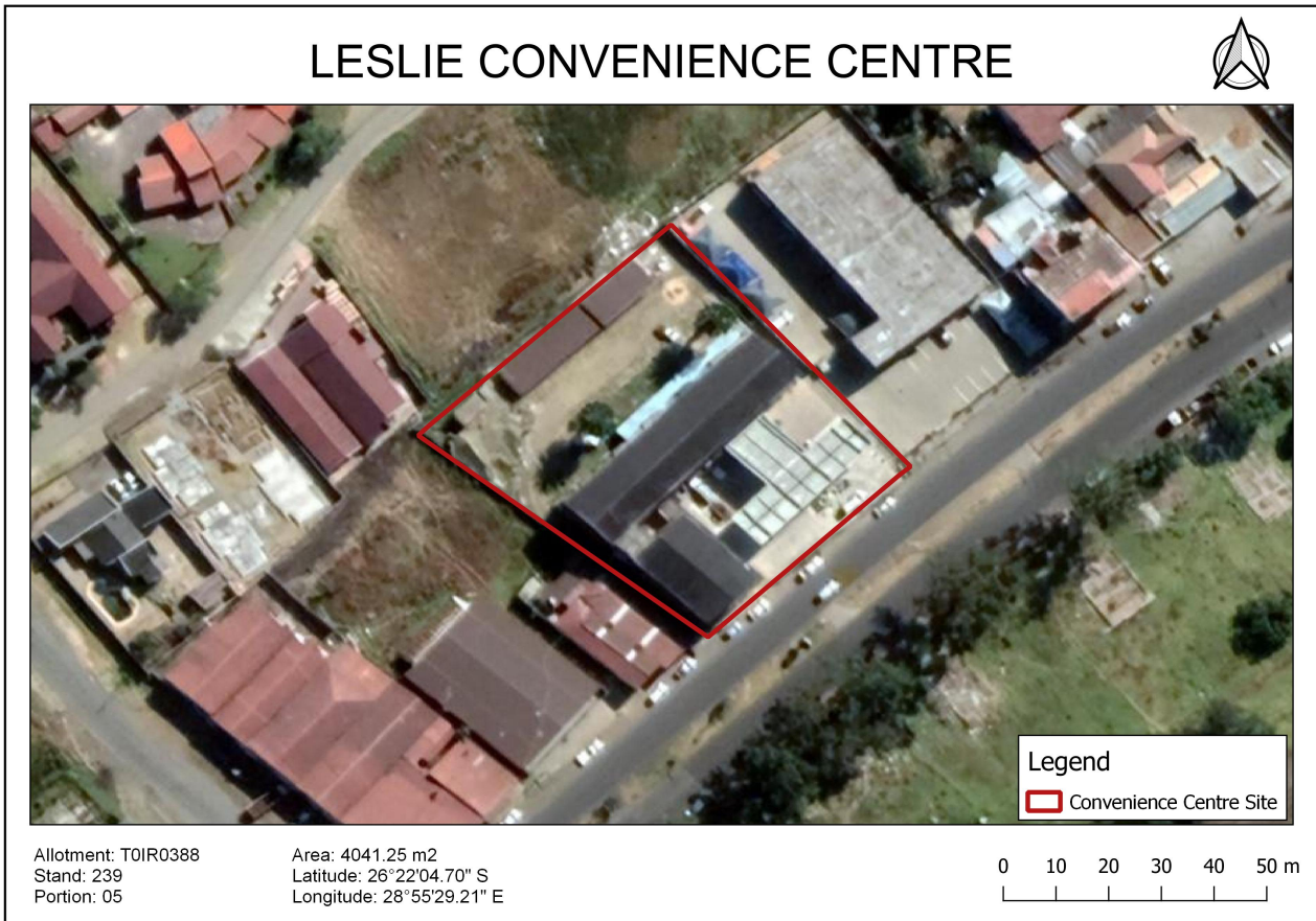
Figure 1 & 2 Locality Maps