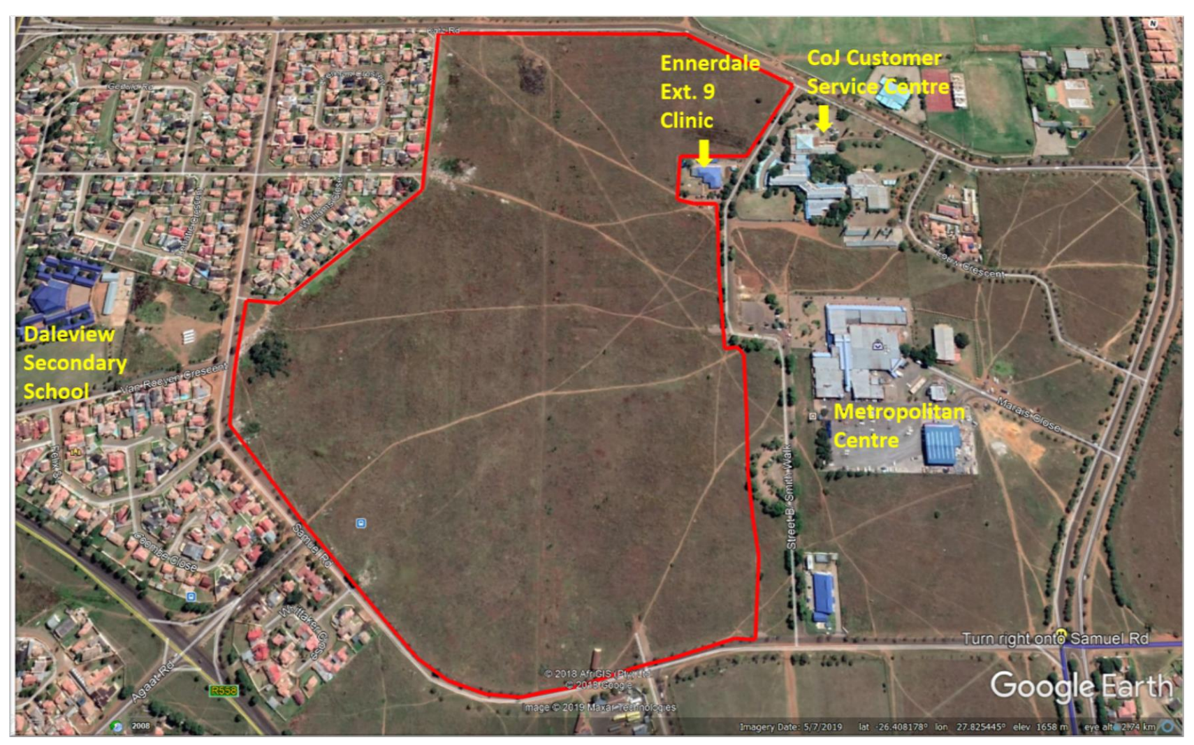
Figure 2: Aerial Image of the site for the proposed Ennerdale Ext. 9