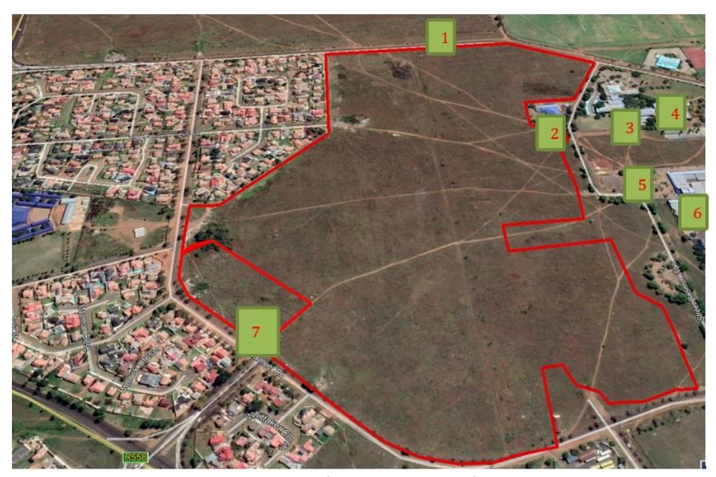
Figure 1: Locations of the placement of site notices