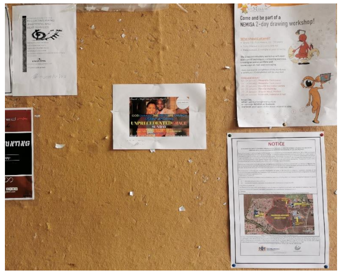
Site Notice 4: Ennerdale Extension 9 Community Libray Coordinates: 26°24′13.05″S; 27°49′52.72″E