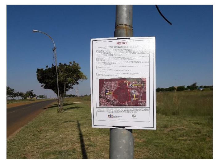
Site Notice 1: Northern Site Boundary (Katz Road) Site Coordinates: 26°24′06.66″S; 27°49′35.25″E