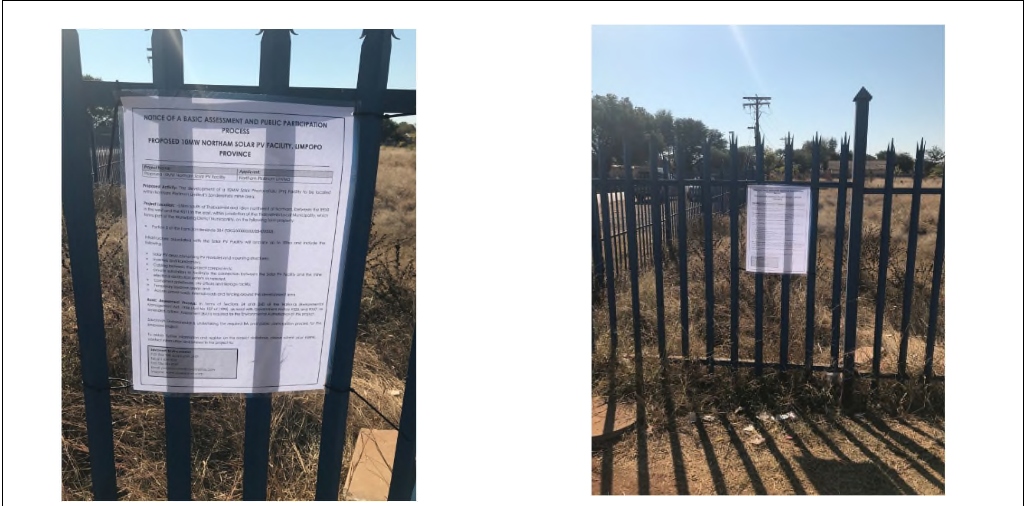
Co-ordinates: 24°57'26.1"S 27°15'48.4"E Placed at corner of Brits Road and Botha Road, Northam