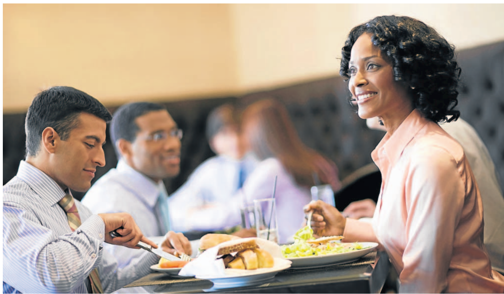
EVERYTHING TO LOSE: Although business confidence is at a low, South Africa's middle class could be a bulwark against disaster

At times like this, emotions tend to become charged. But, then again, we are human, and, in such settings,