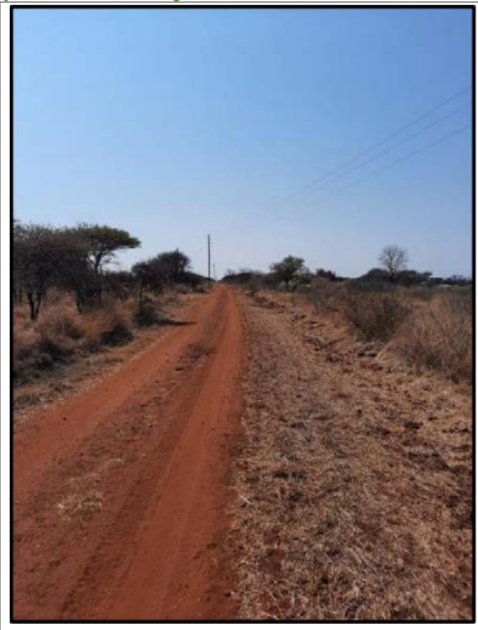
Photograph 2: North-western border of the study area with gravel access road.