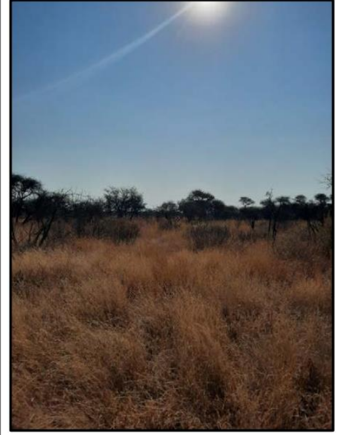
Photograph 4: General site conditions on the eastern border of the study area showing thick grass cover.