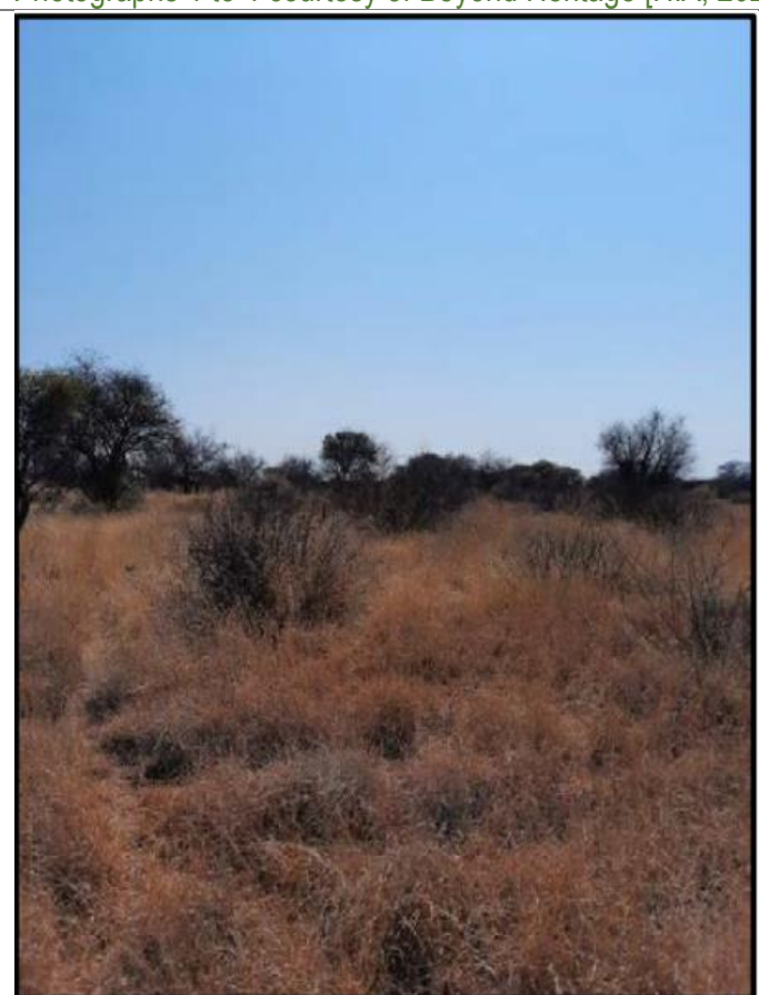
Photograph 1: Thick vegetation cover characterises the study area.

Photographs 1 to 4 courtesy of Beyond Heritage [HIA, 2022], taken on the 12 August 2021.