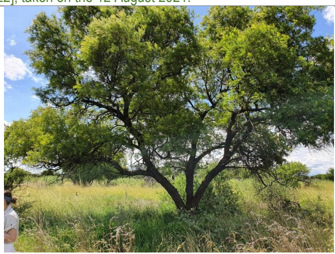
Photograph 6: Natural and disturbed natural vegetation.