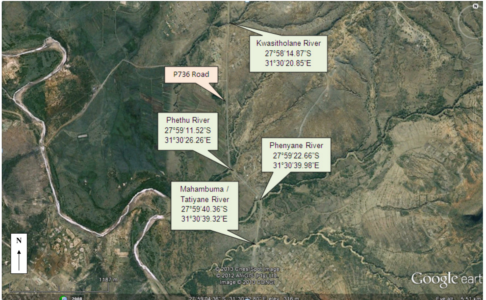
Appendix A1: Aerial Map showing the location of the proposed Mahambuma/Tatiyane, Phenyane, Phethu and Kwasitholane Causeways at the