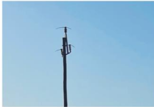
'n Kragpaal by Muisboskerm.