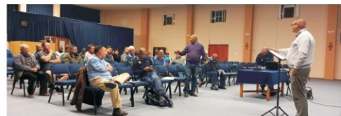
Rolspelers by die Misdaad Imbizo.

VREDENDAL: Die SAPD het Maandag, 12 September 'n geslaagde Misdaad Imbizo aangebied onder leiding van die sektorbevoelers in Vredendal.