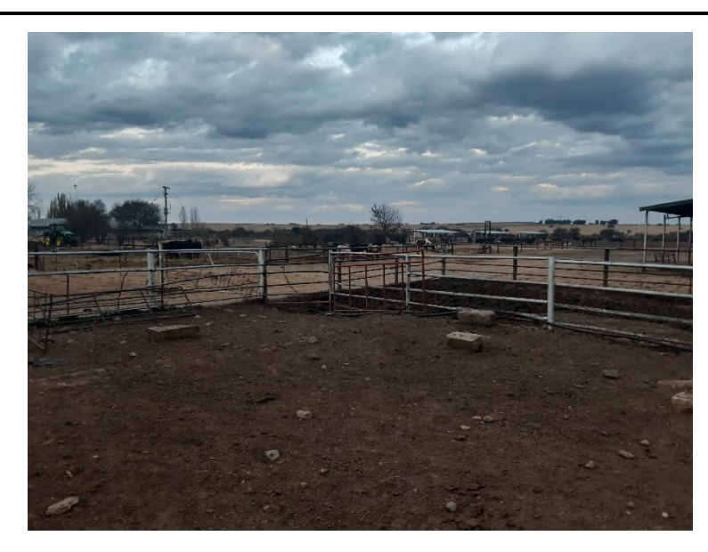
LSU and SSU Processing Facilities (Existing Kraal and Buildings)