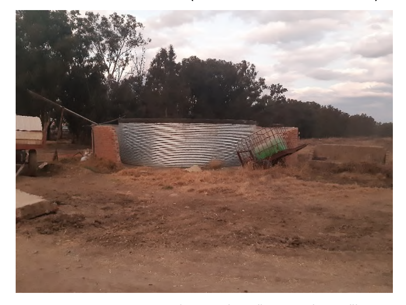
Water Storage dam (S 28°40'2.47" E 27°12'34.19")