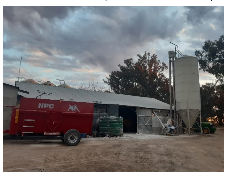
Feed Mixing Plant