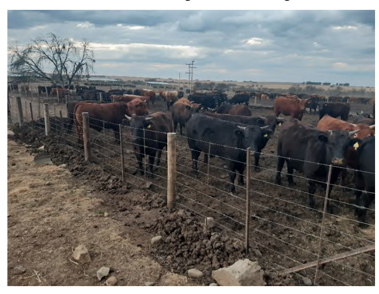
Southwestern corner of Cattle (LSU) Feedlot (original kraal) looking northeast