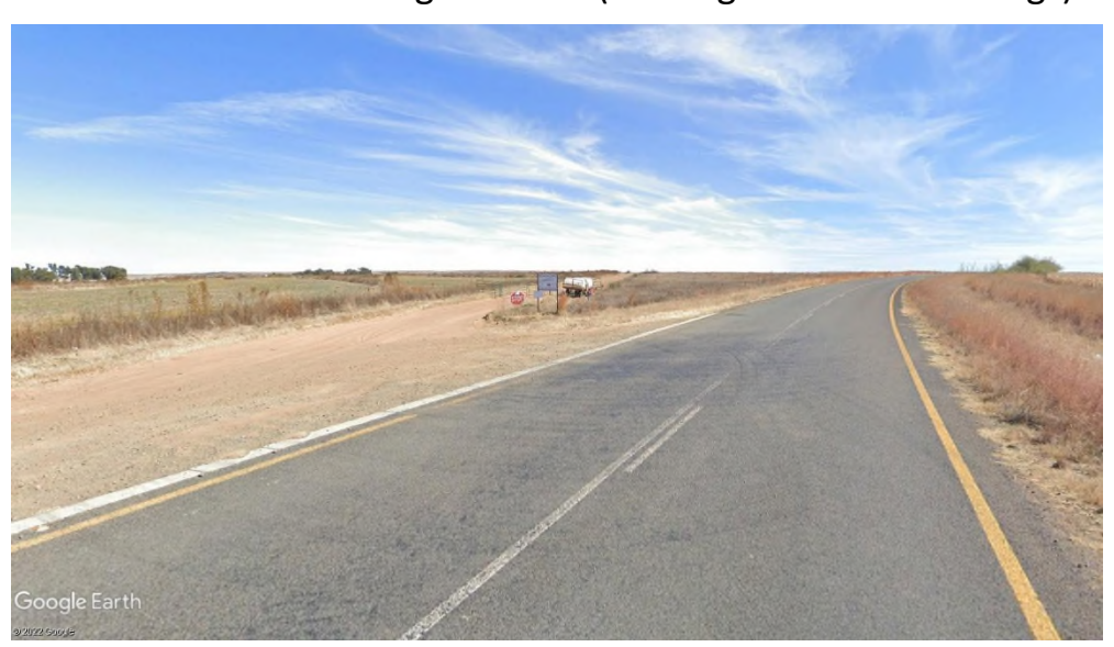
Main Access from the R708