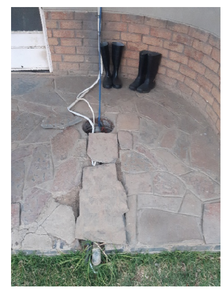
Borehole 2 (S 28°39'55.83" 27°12'39.05"E)