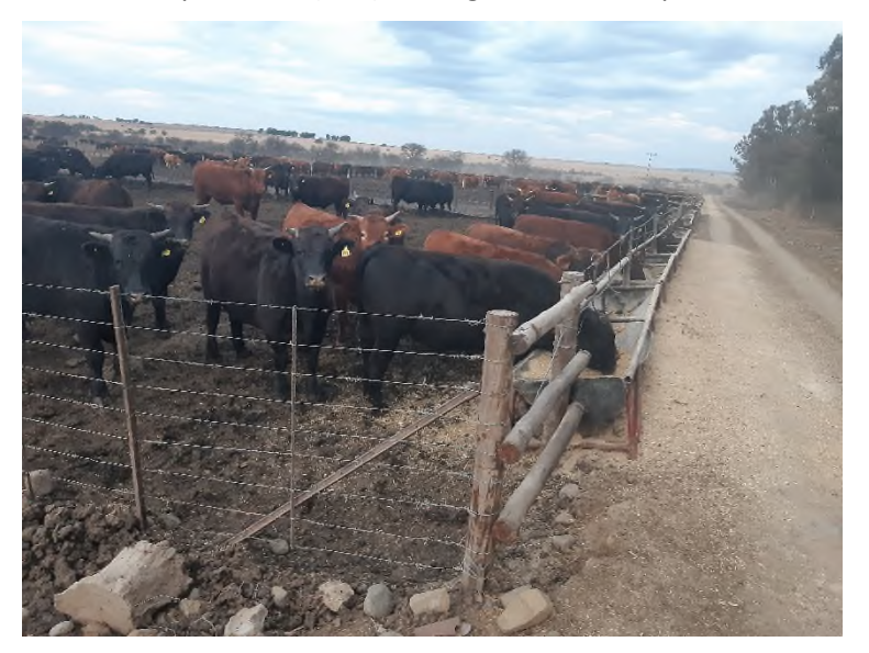
Southwestern corner of Cattle (LSU) Feedlot (original kraal) looking east