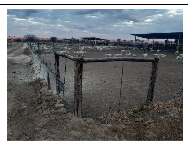
Northeastern corner of original kraal looking southeast