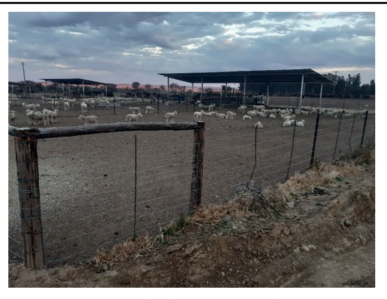
Sheep Feedlot (SSU) on original kraal footprint