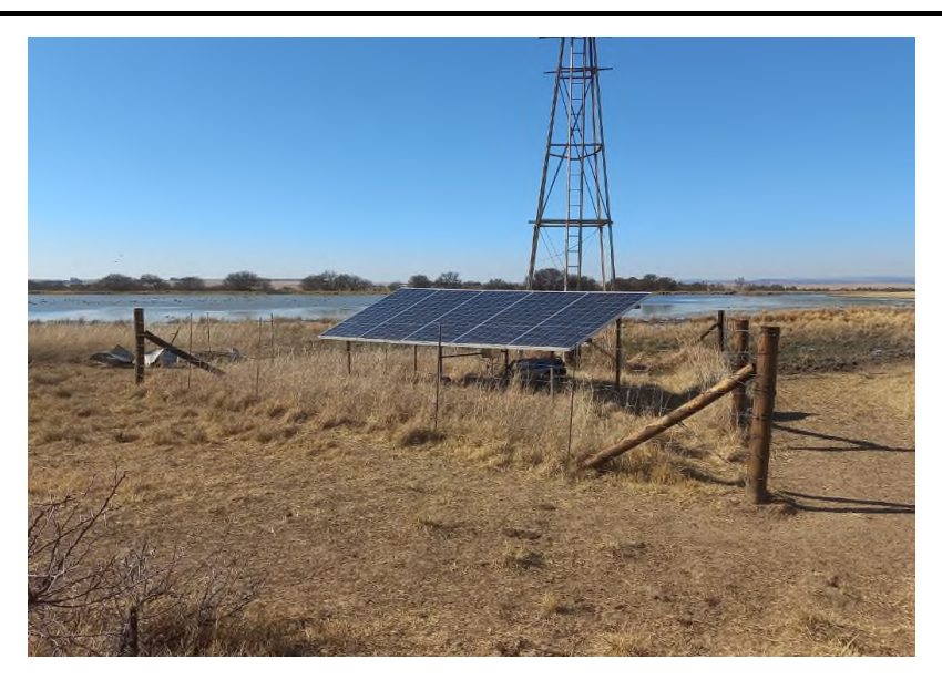
Borehole 1 (S 28°39'36.87" E 27°11'56.75")