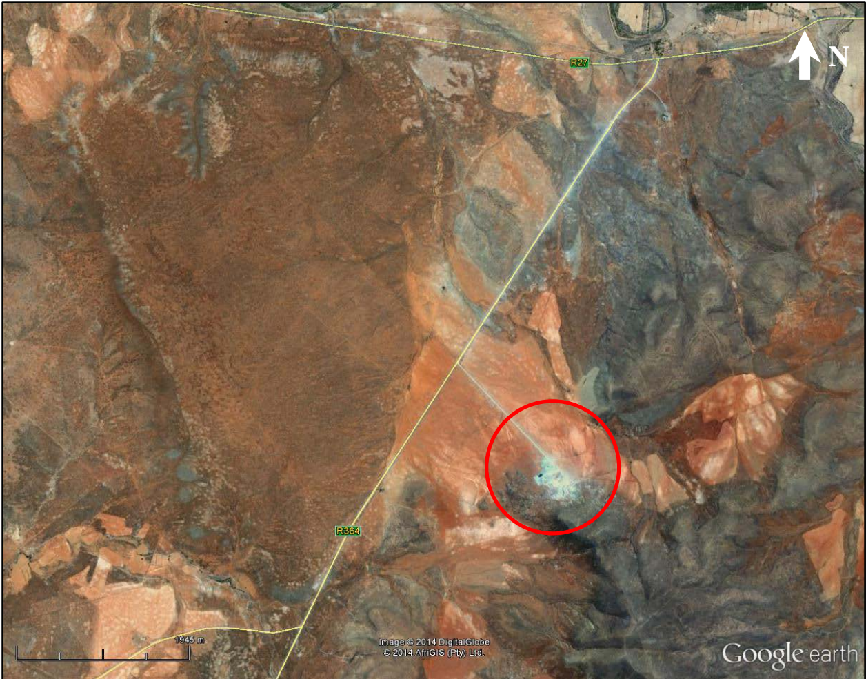
Figure 1: Google Earth image showing the location of Borrowpit BP R27-8 km 32.6 RHS 6.2 (red oval).