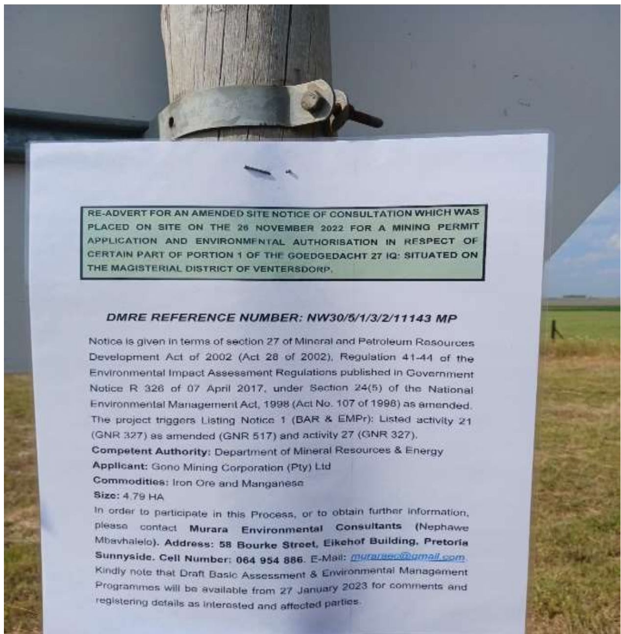
Figure 4: Corner N14 and Derby road