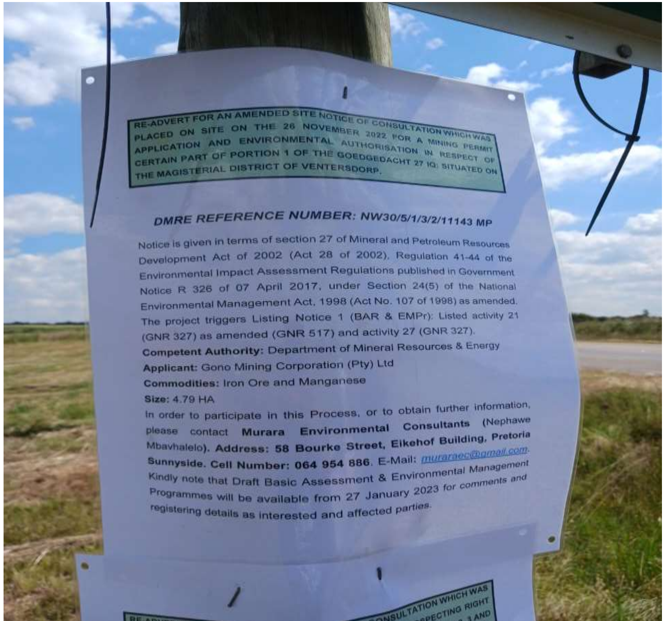
Figure 1: Corner Welverdiend and R30 Provincial road