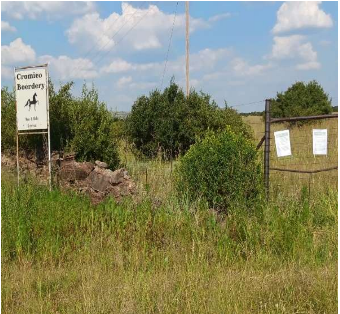
Figure 6: Cromico Boerdery Farm Property