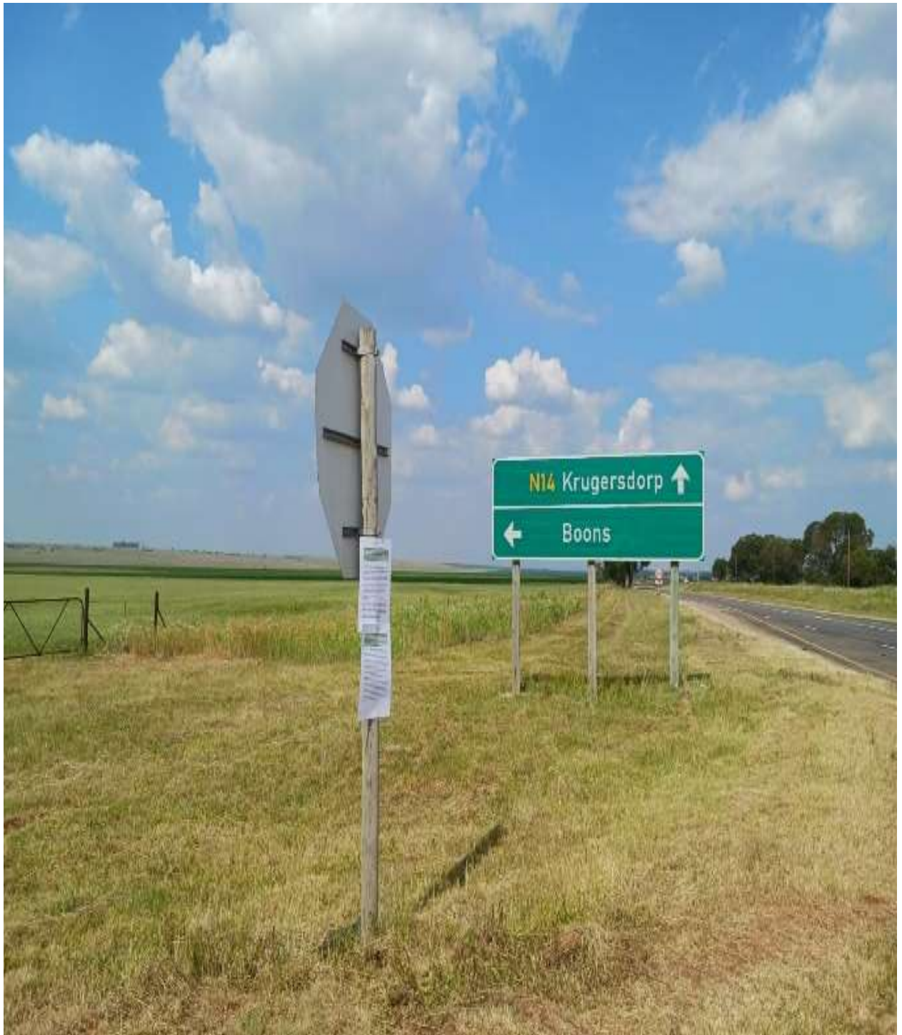
Figure 5: Corner N14 and Derby road