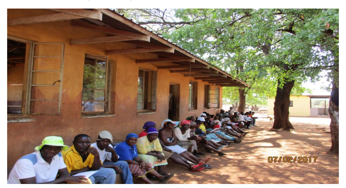
Photograph 4: indicating the meeting attendees