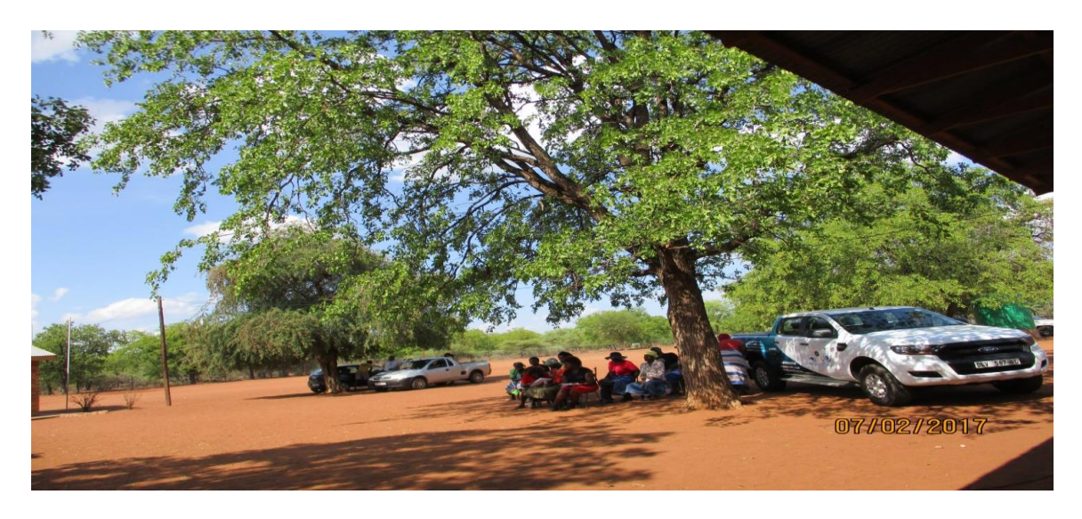
Photograph 5: indicating the meeting attendees