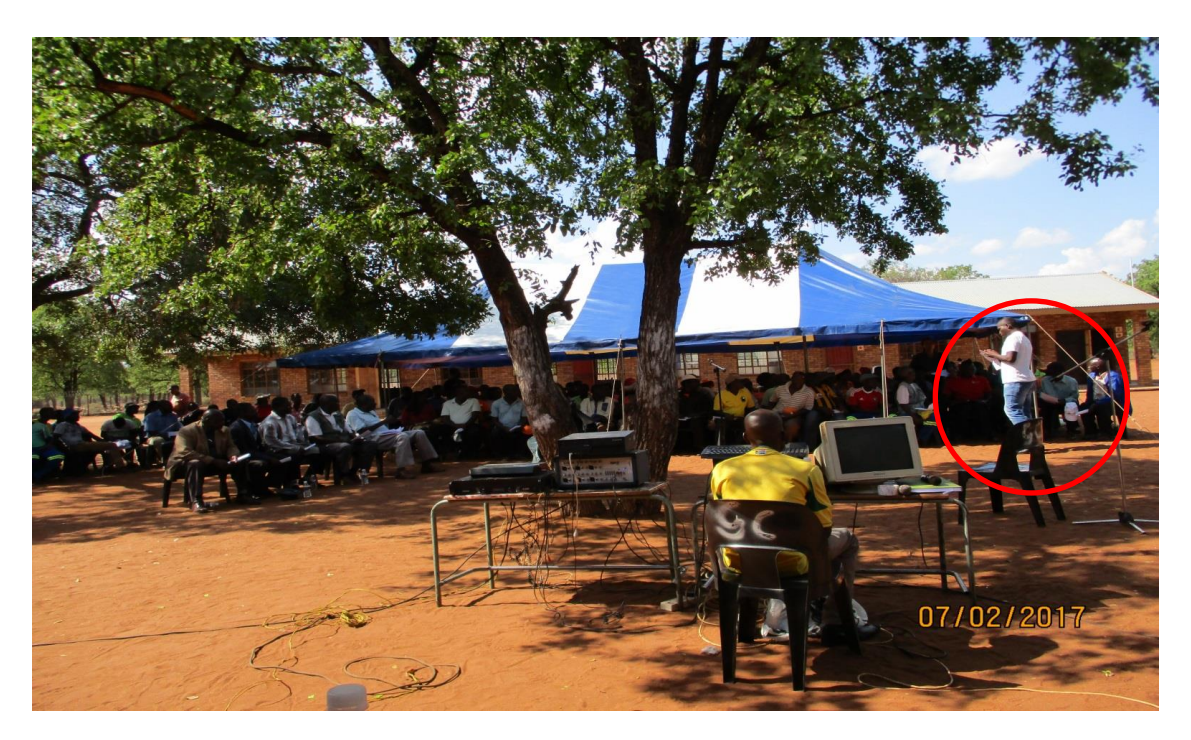
Photograph 2: Indicating the community members and Mr Desmond Musetsho of Naledzi Environmental Consultants facilitating the public meeting.