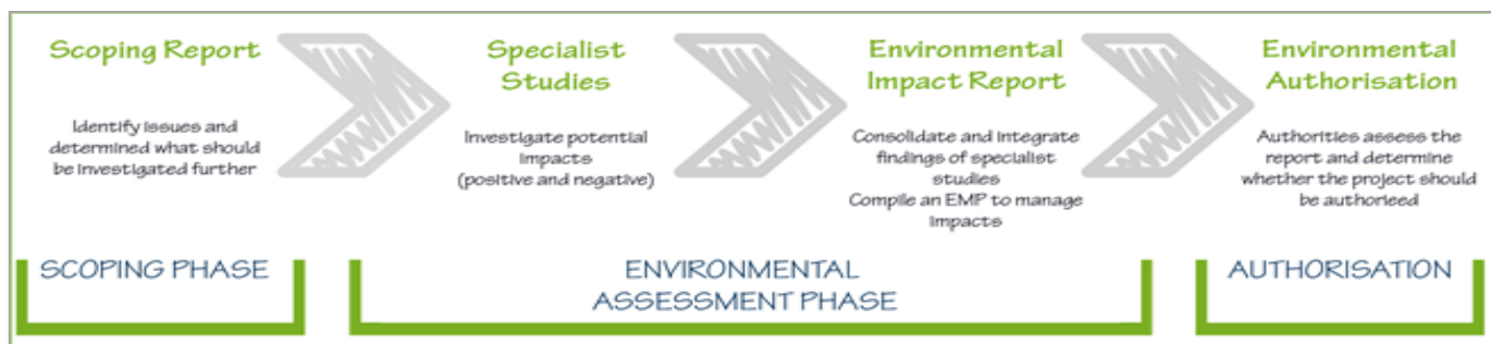
Figure 3: S&EIR Process

A S&EIR process typically has four phases as illustrated by the below figure.