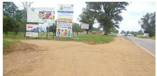
Figure 1: Corner of Graham and Alexander Road

The proposed road development is located in Pretoria East in the CoT. The proposed road is bordered on the south by the M6/K34 (Lynnwood Road / Graham Road). The area of Silver Lakes lies to the north-west of the study area with the M10 (Solomon Mahlangu Drive) approximately 3km north-west of the study area (Figure 2).