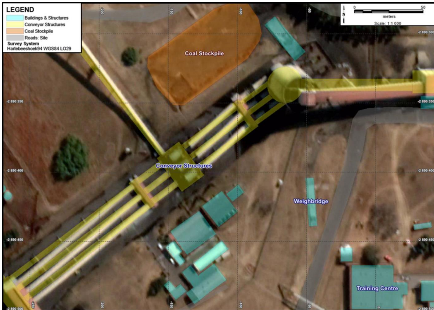
ROM COAL STOCKPILE INFRASTRUCTURE LAYOUT PLAN