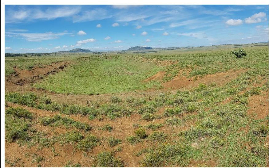
Photo of the existing borrow pit and surrounding area showing modification of vegetation due to previous mining activities (looking west) Date: January 2021

Photo of the proposed site (looking south) showing karroid shrub species growing on the areas disturbed by previously mining activities. Date: January 2021.