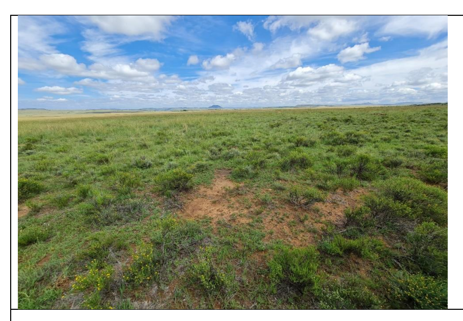
Photo of the proposed site (looking south) showing karroid shrub species growing on the areas disturbed by previously mining activities. Date: January 2021.