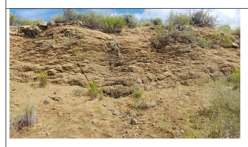
Photo of the weathered dolerite in the old borrow pit, with thin soil and shrubby vegetation cover. Date: January 2021

Photo of artificial wetland and pioneer species established in the centre of the existing borrow pit. Date: January 2021