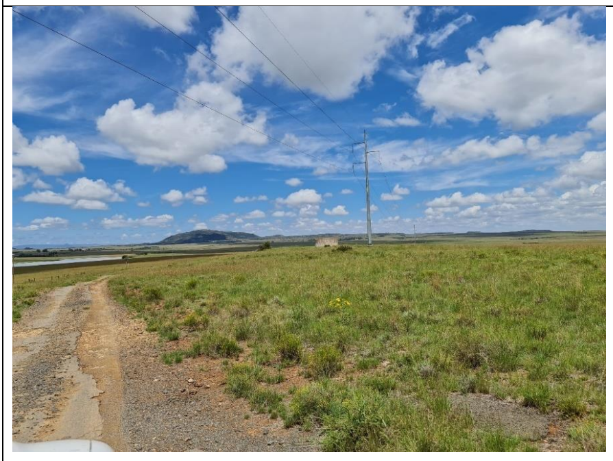
Photo of the existing access road to the proposed borrow pit site with powerline overhead. Date: January 2021

Photo of drainage line situated to the south of the proposed borrow pit, parallel to the R58 road. The drainage line is situated outside the boundary proposed site. Date: January 2021