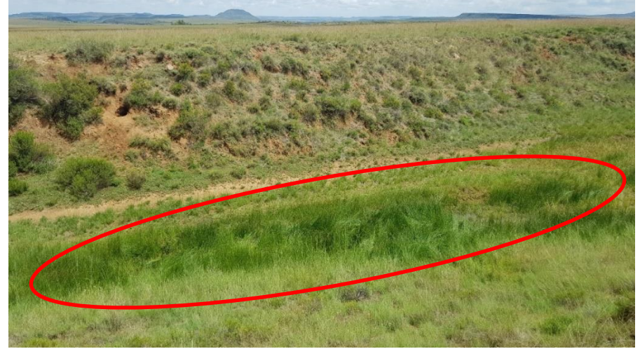
Photo of artificial wetland and pioneer species established in the centre of the existing borrow pit. Date: January 2021

Aerial view of the existing borrow pit showing the flat topography of the surrounding area. The borrow pit strikes SW-NE. Date: January 2021.