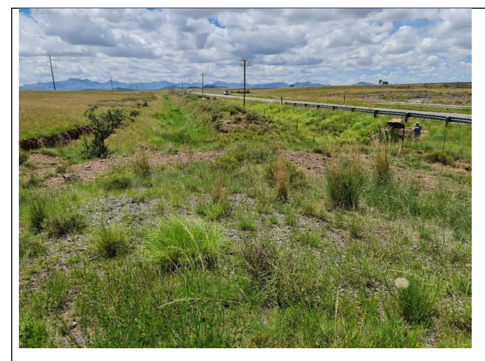
Photo of drainage line situated to the south of the proposed borrow pit, parallel to the R58 road. The drainage line is situated outside the boundary proposed site. Date: January 2021