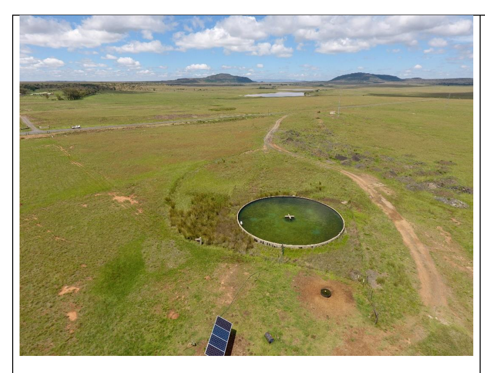
Aerial photograph of the current access road to the proposed site, going past an old farm dam and solar panels.