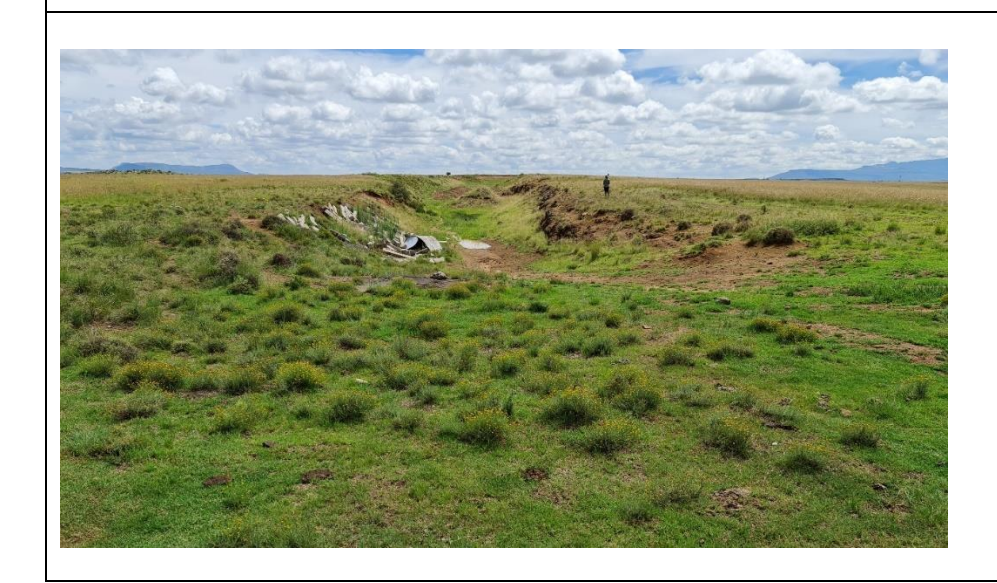
Photo of the old borrow pit situated in the southern border of the proposed site. The pit contains some rubble and old soil dumps left from the previous mining activities (looking east) Date: January 2021

Photo of the existing borrow pit and surrounding area showing modification of vegetation due to previous mining activities (looking west) Date: January 2021