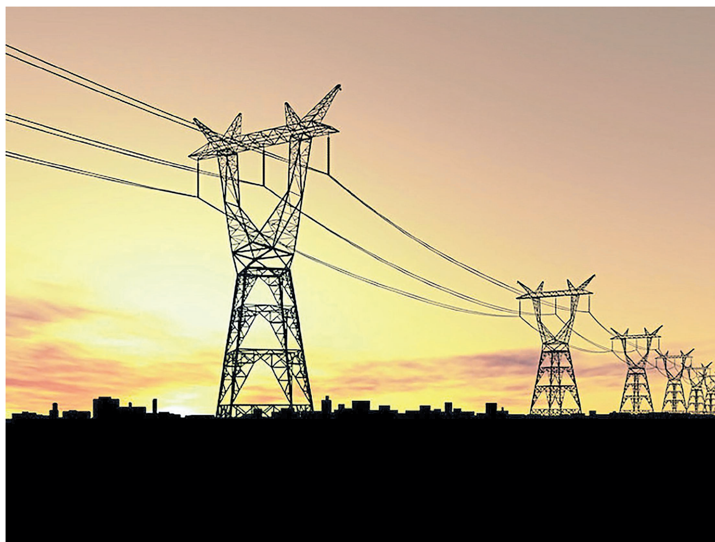
CRUEL BLOWS: While big companies can better manage the power crises, the fallout can be crippling for SMEs, which do not necessarily have strong balance sheets.

The Bank said it monitored developments in the non-financial sector of the economy to