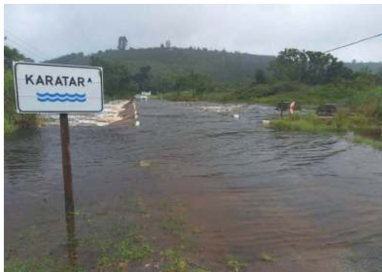
The Karatara Bridge flooded during last week's rains. BELOW: This section of Howard Street in Hunter's Home floods regularly during heavy rains.

Thankfully the welcome rain was not exclusive to Knysna. At Rondevlei, just outside Sedgefield, there has been an astronomical 1 063,16% increase in rainfall this month. Rondevlei only recorded 3,8mm of rain in November, according to SANParks, but this figure skyrocketed to 44,2mm by 19 December.