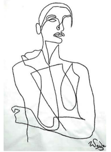
SUPPORTING WOMEN'S RIGHTS: One of East London artist Wade Louw's hand-stitched works on display at the Ann Bryant Art Gallery until January 25.

“But I'm thankful for the seed planted by my primary school