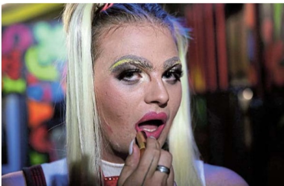
COLOURFUL COMMUNITY: Local drag queens performing at a charity fundraising event at Club Eden late last year.

“Though there are four nude males, only the female has a face, because she represents the lens for the viewer to identify her as the protagonist gazing at the male form.”