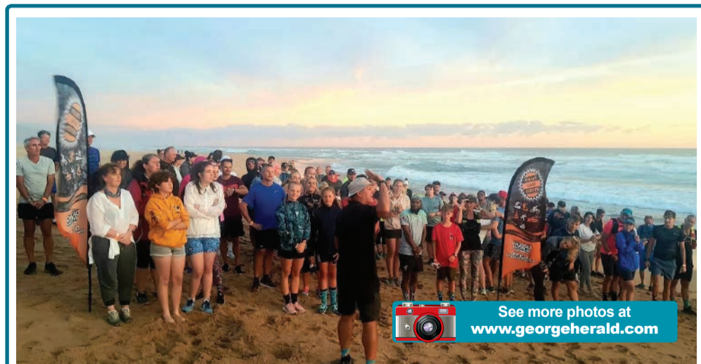
A record number of 268 runners took part in the event.