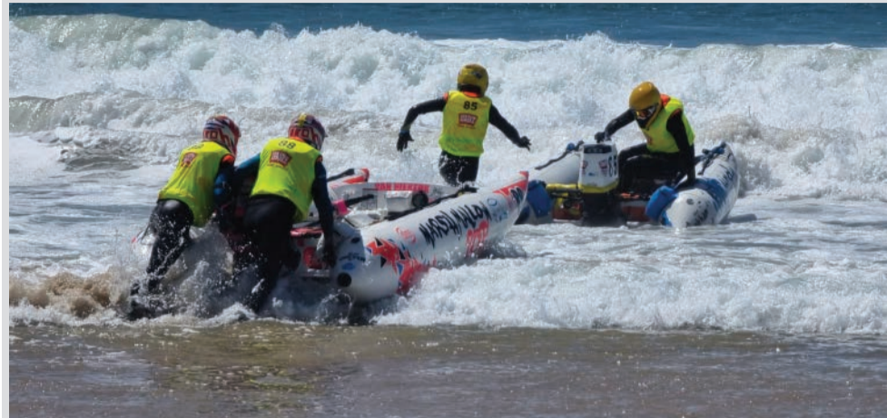
Participants in the Trans-Agulhas Challenge push their boats into the water at Santos Beach.