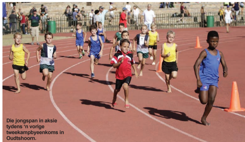
Die jongspan in aksie tydens 'n vorige tweekampbyeenkoms in Oudtshoorn.