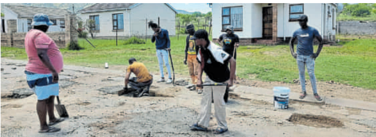
Kings Park residents take it upon themselves to repair potholes in the area, claiming the municipality and ward councillor has failed them