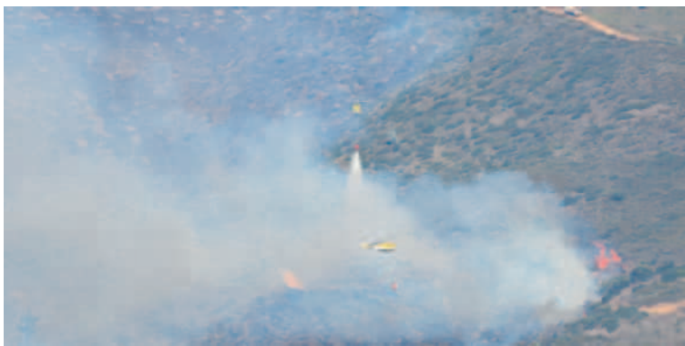
The City will kick off the annual ecological burns for this season in February.