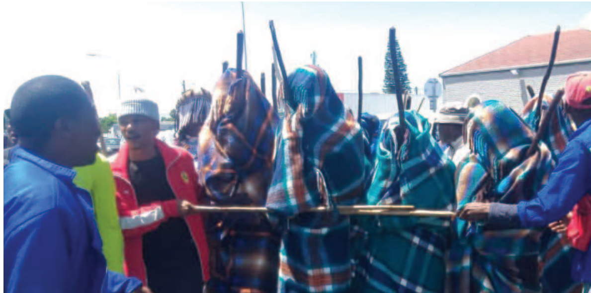
Abakhwetha besamkelwa ebudodeni eGugulethu.

akhwenkwe ngokomthetho olandelwa ziingcibi zalapha, sabahlola enoba bakulungele ngokwasengqondweni na ukoluka. Inkoliso yabo ayinabazali kwaye ikhulele kumakha agcina iinkedama," utshilo "Ibingamakeswa la kwaye bambi bebeseben-