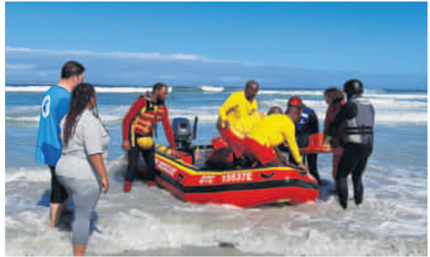
Lifeguards during a demonstration at Big Bay beach.