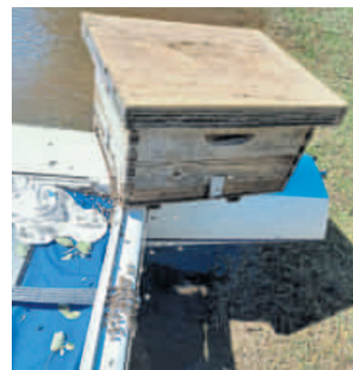
JUST RESTING: A swarm of bees had to be relocated on Saturday after they settled on a boat.

Wood called in a local beekeeper, Reg Morgan, who arrived with a hive to collect the bees. Once the box was placed on the boat the bees immediately began moving into the new home.