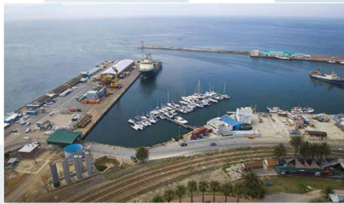
Birds eye view of Mosselbay

Isicanga 1-1 Uludwe lweendawo zikawonke wonke apho ifumaneka khona iNgxelo eYilwayo yoHlolo loMmandla