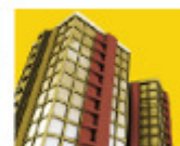
Planning & Development