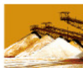
Mining & Minerals