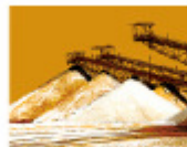
Mining & Minerals