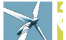
Renewable & Low Carbon