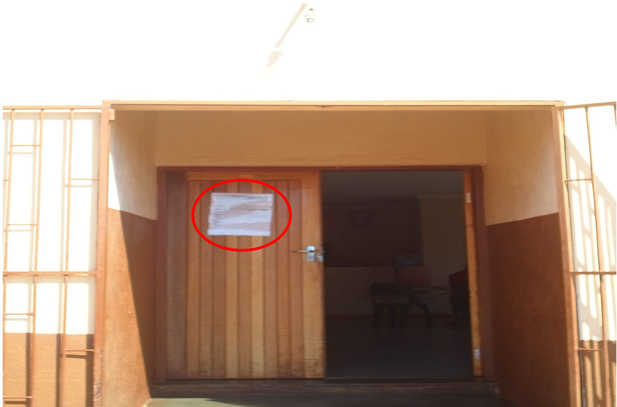
Photograph 1: Indicating a site notice poster placed on a hall door at Mogashoa-Ditlhakanemg Tribal Office (S 24° 47' 25.3" E 29° 59' 49.6" Co-ordinates).