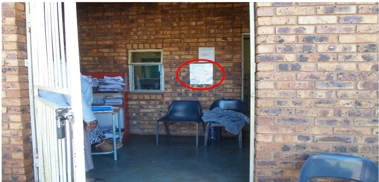
Photograph 2: Indicating a site notice poster placed on a wall at Kone Maloma Tribal Authority (S 24° 45' 35.0" E 30° 00' 39.8" Co-ordinates).