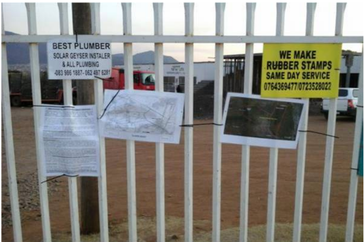
A site notice was placed at New life supermarket (Ga-Malekana village) at S 24^{\circ} 53' 32.5'' E 30^{\circ} 00' 22.8'' Co-ordinates