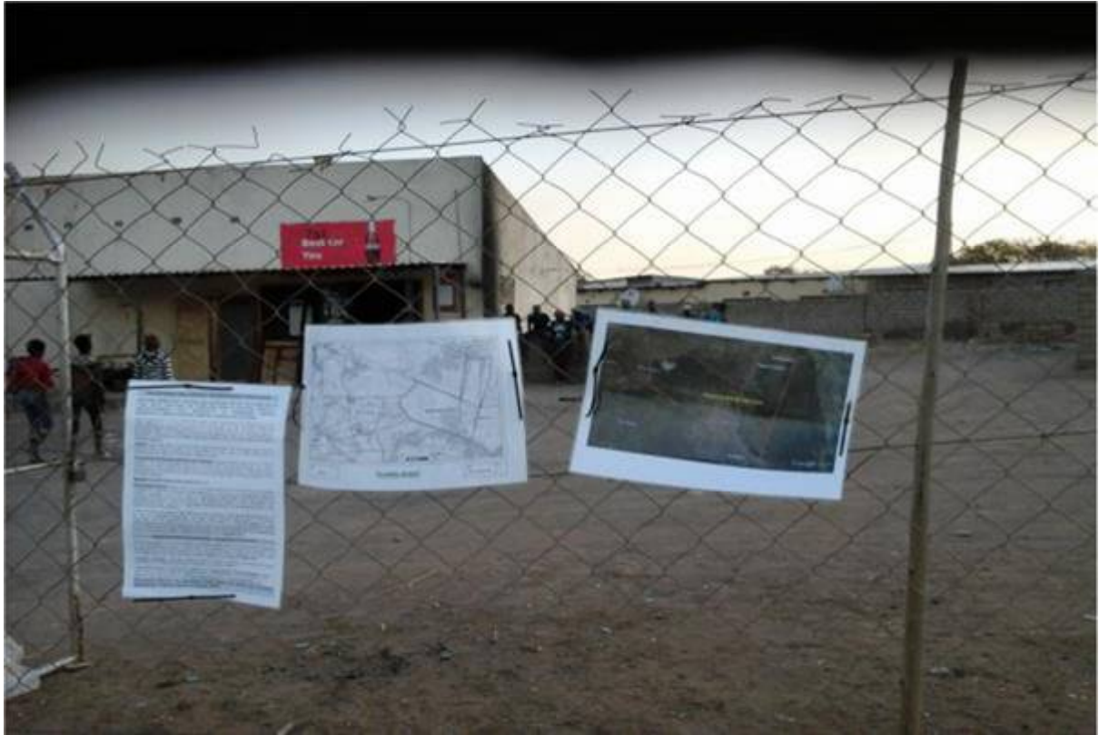
A site notice was placed at Best for You Shop (Ga-Masha village) at S24^{\circ} 52' 43.1'' E029^{\circ} 58' 55.0'' co-ordinates