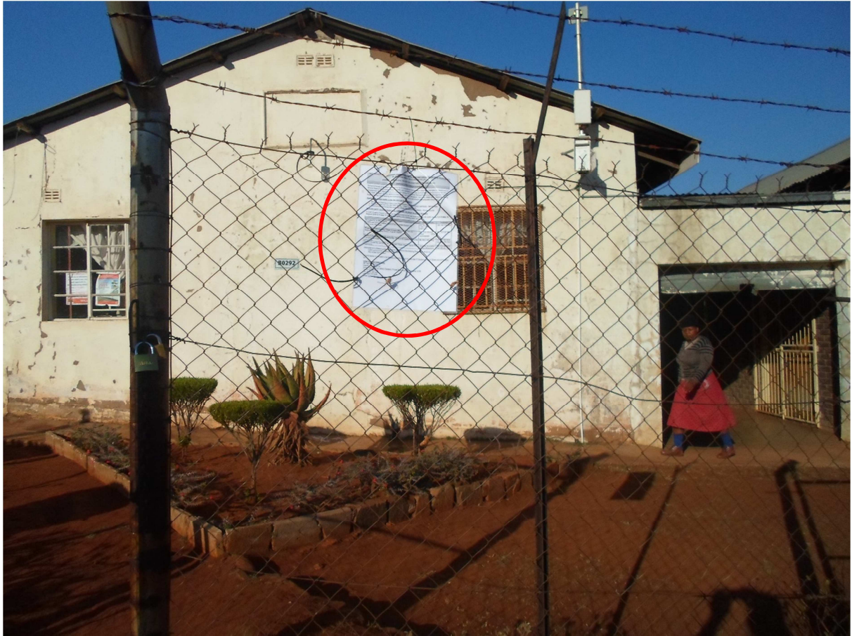
Photograph 5: Indicating a site notice poster placed on a fence at Tswako Maepa Traditional Authority (S 24° 51' 41.3" E 29° 55' 18.6" Co-ordinates).