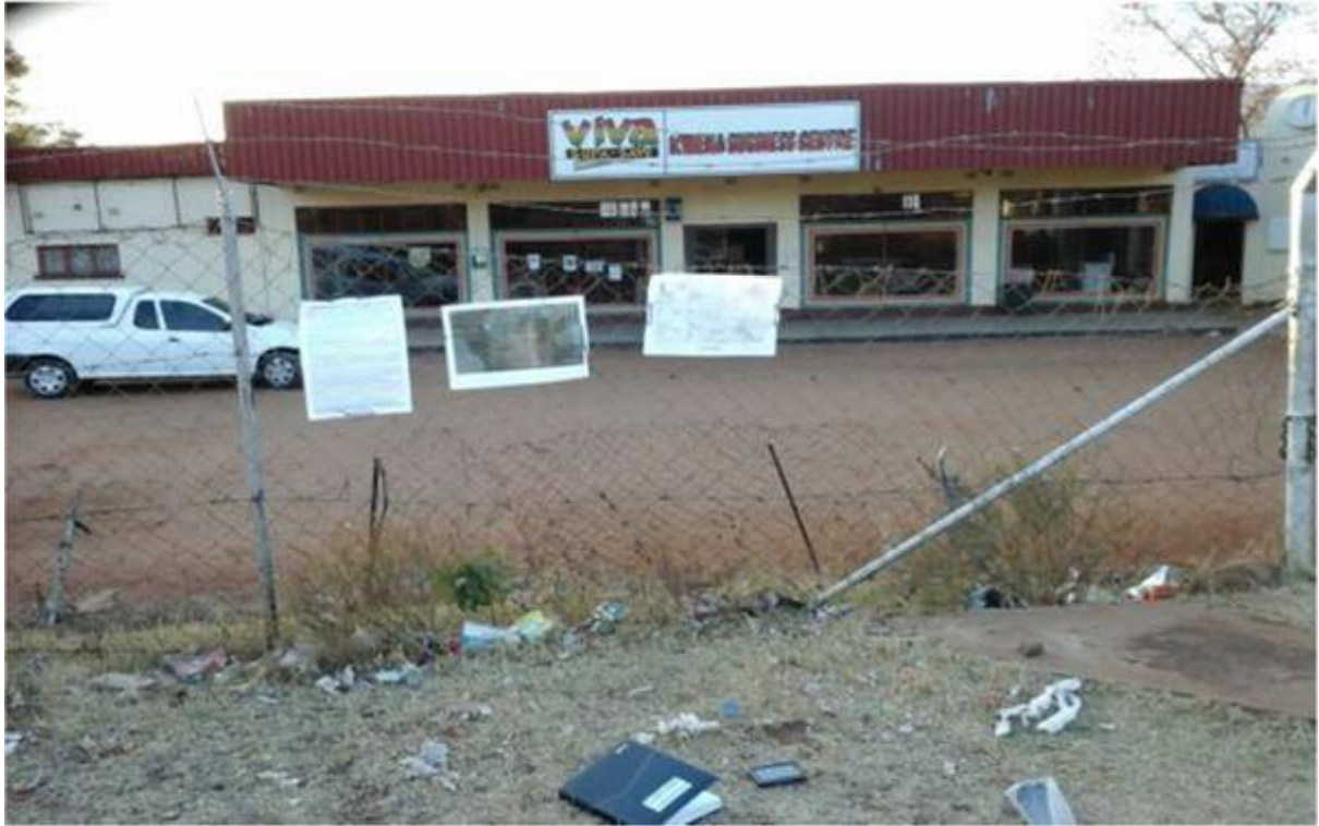
A site notice was placed at Kwena business centre (Schoonoord village) at S 24° 45' 13.0" E 30° 00' 37.7" Co-ordinates.