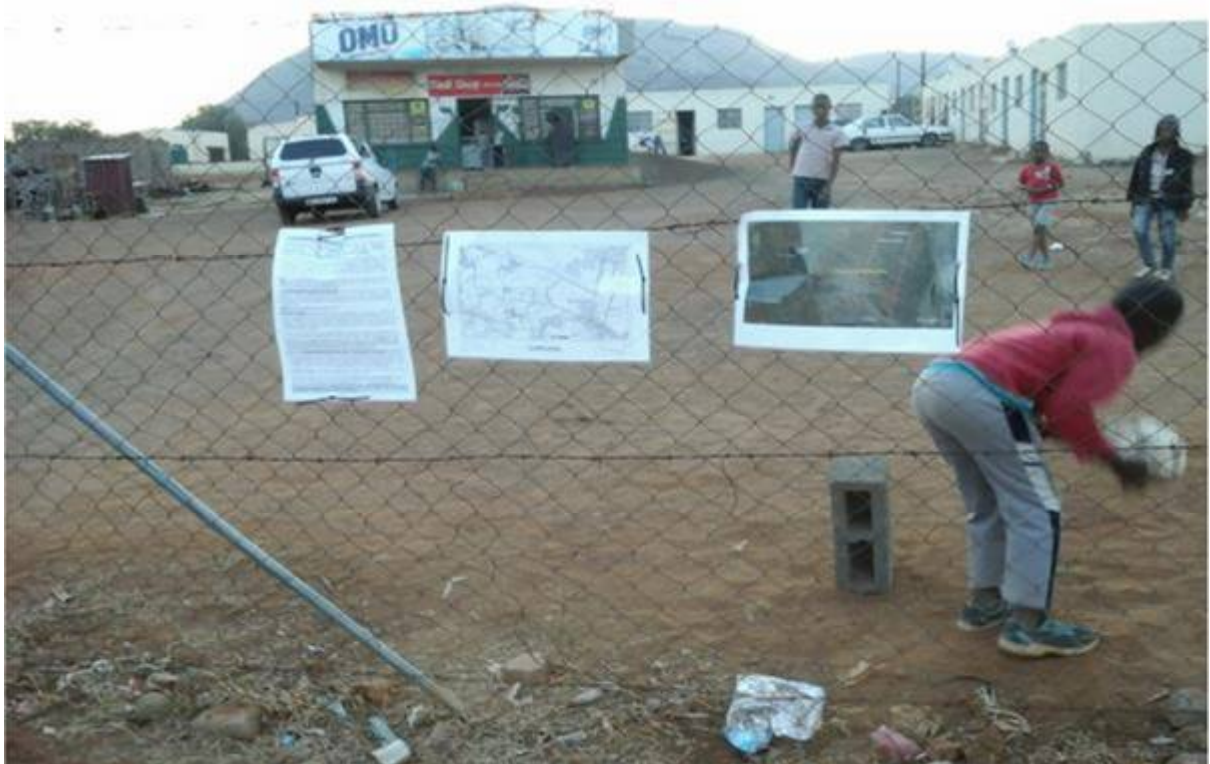
A site notice was placed at Tladi shop (Maphopha Village) at S 24° 51' 22.2" E 029° 57' 51.8" Co-ordinates.