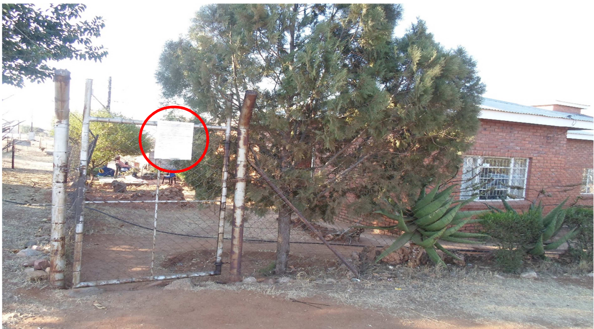
Photograph 4: Indicating a site notice poster placed on a gate at Bahlakwana Ba Maphopha Tribal Authority (S 24° 51' 12.5'' E 29° 57' 43.4'' Co-ordinates).