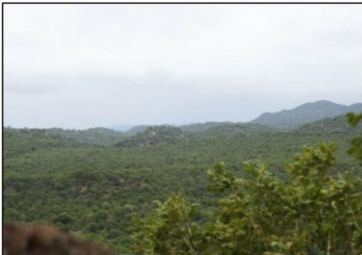
Figure 1: View towards the east of the study site from a high point near old Graphite Mine

The current status of the study site is natural with indigenous vegetation in pristine condition. The site is a declared nature reserve. The site is more sensitive in its eastern section with a disturbed area at the old Gumbu Graphite Mine on the western section of the study site. At present the land is used by the SANDF for military training. Livestock of the local community graze on parts of the study site.