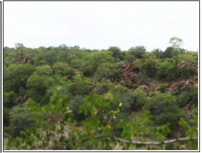
Figure 2: Ridges of Gumbu Valley

The closure aim would be to return the disturbed prospecting target areas to their natural state. Based on the 2007 Land Use and Development Plan for Madimbo Corridor rehabilitation and self-generating potential of vegetation in the project area is low owed to the low nutrient status of the soils. It would therefore be imperative to restrict disturbance to an utter minimum,