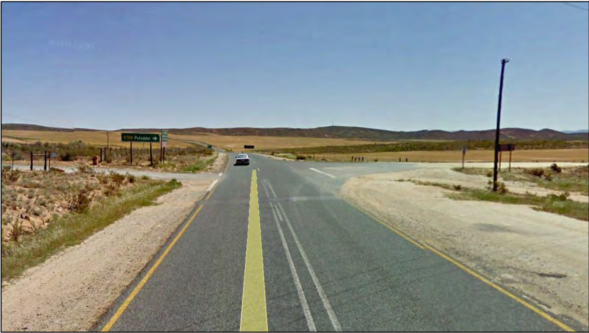
Figure 1.2 - N7 / R358 Intersection