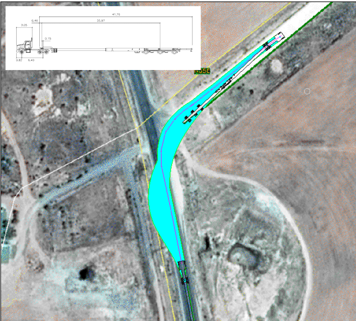
Figure 1.3 - Swept Path Analysis N7/R358

The transportation of materials, plant and people are envisaged to be transported from the nearest town, Loeriesfontein. Materials sourced from elsewhere will generally arrive via the N7 which further