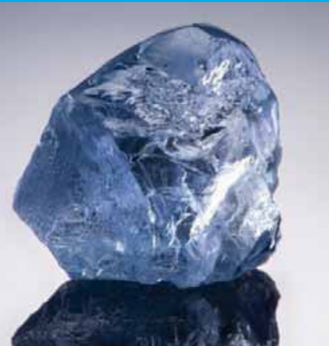
Photo: A 20.08 carat Type IIb blue diamond recovered at Cullinan Diamond Mine.

Petra Diamonds Limited press release, 23 September 2019