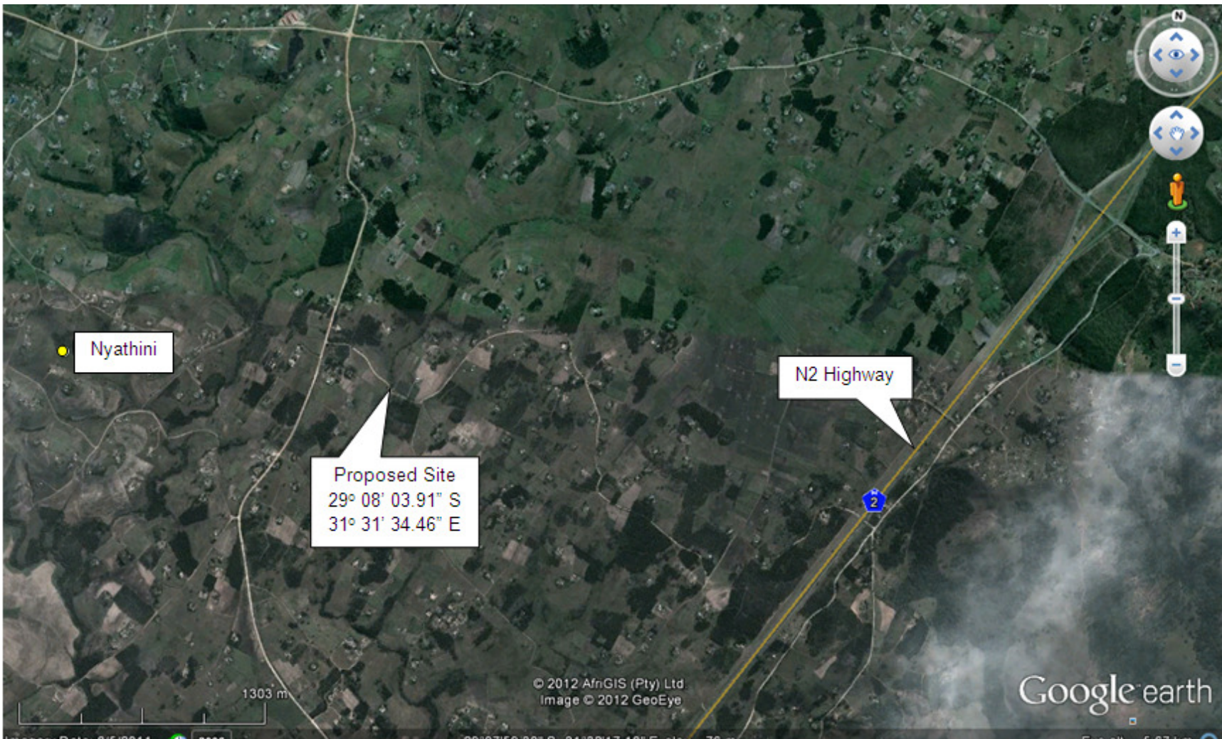
Appendix A1: Aerial Map showing the location of the proposed causeway along the Mhlubulweni Road and the surrounding land uses (Source: Google Earth).