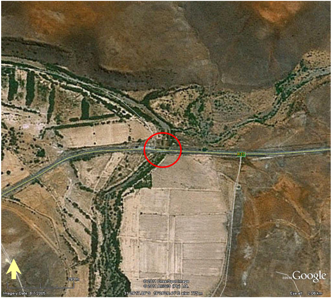
Figure A5: Google Earth air photo of Bridge NB36