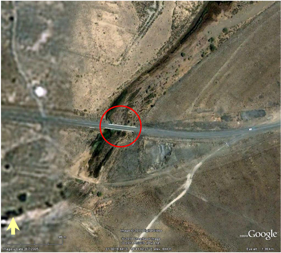
Figure A6: Google Earth air photo of Bridge NB37