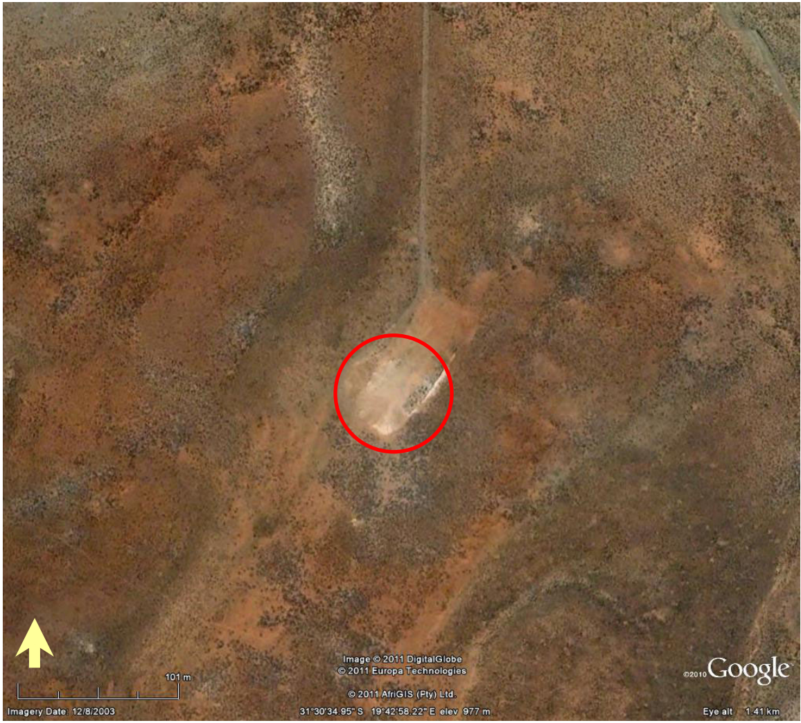
Figure A10: Google Earth air photo of proposed Borrowpit BP R27-8 km 61.6 RHS 1.0