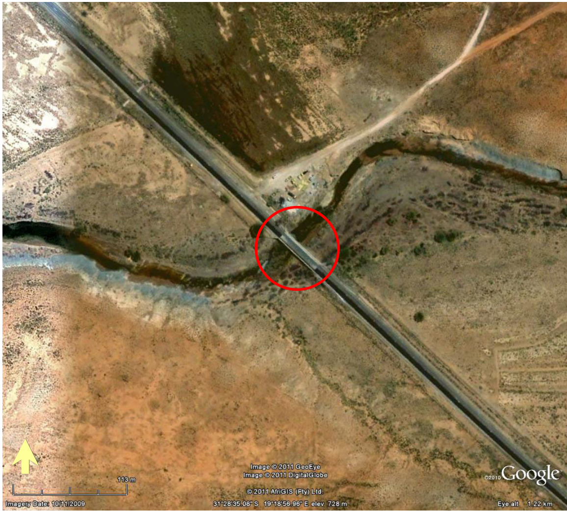
Figure A4: Google Earth air photo of Bridge N35