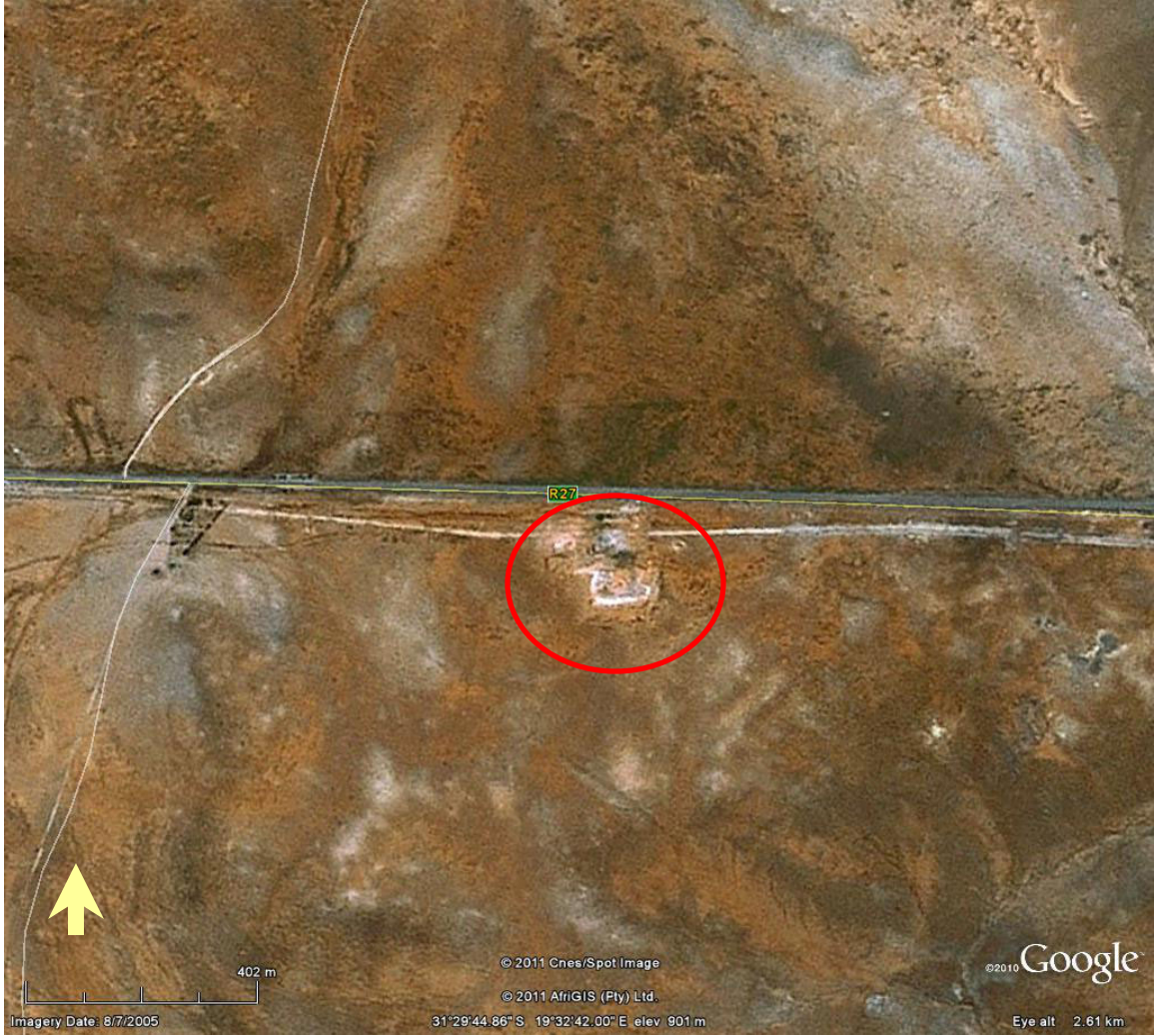
Figure A9: Google Earth air photo of proposed Borrowpit BP R27-8 km 45.0 RHS 0.2