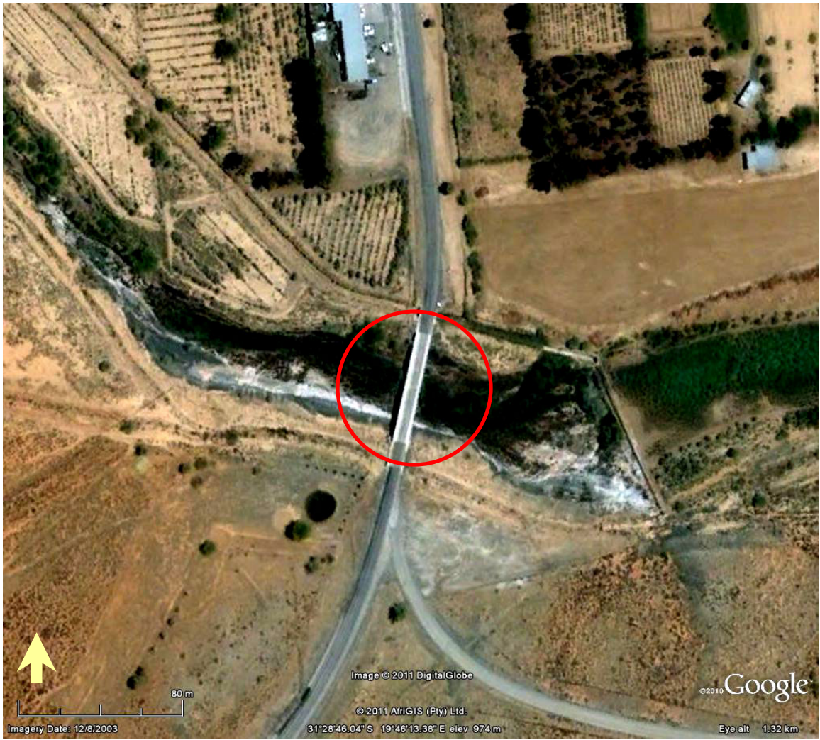
Figure A7: Google Earth air photo of Bridge NB 38