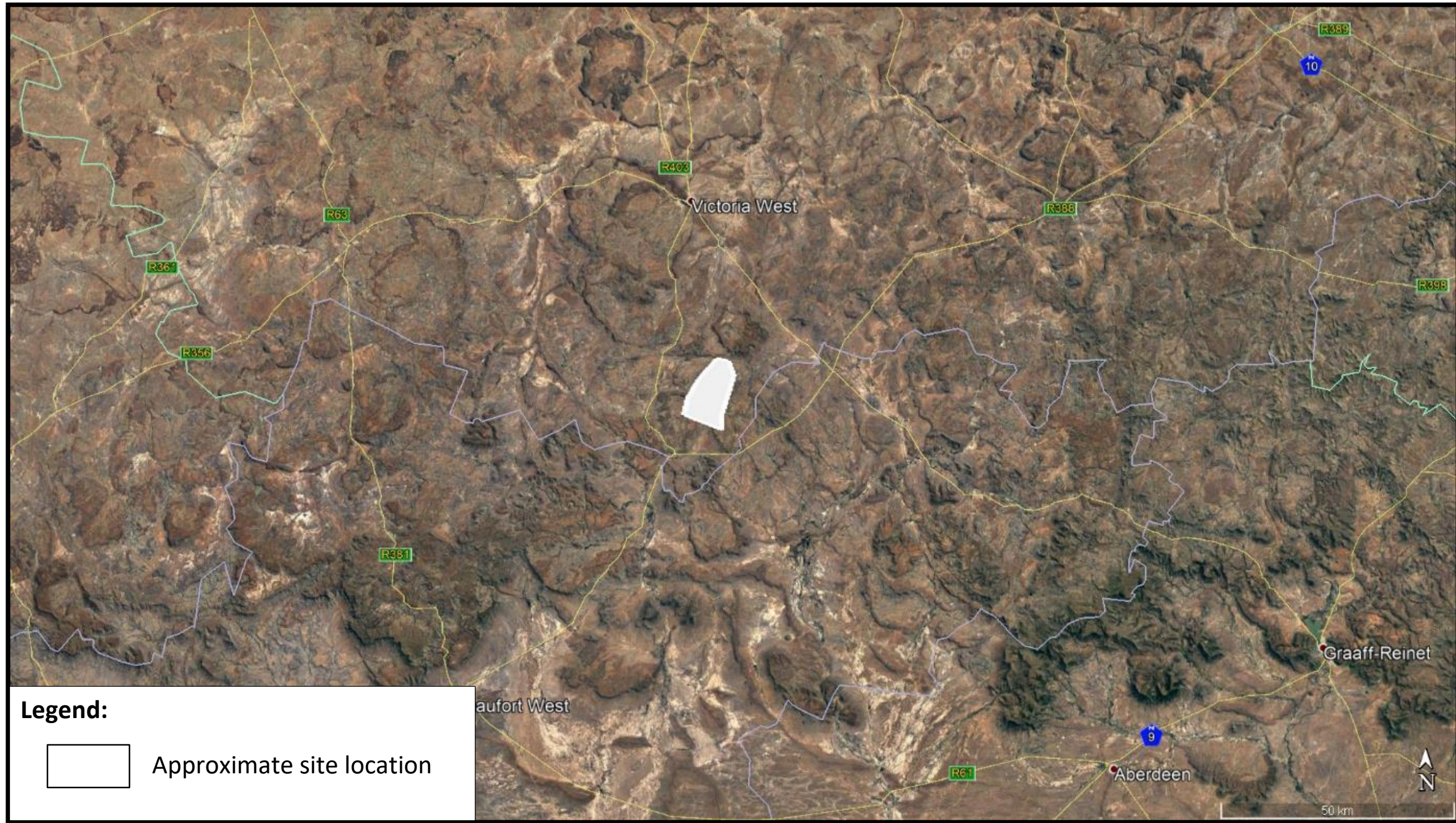
Site Locality Map