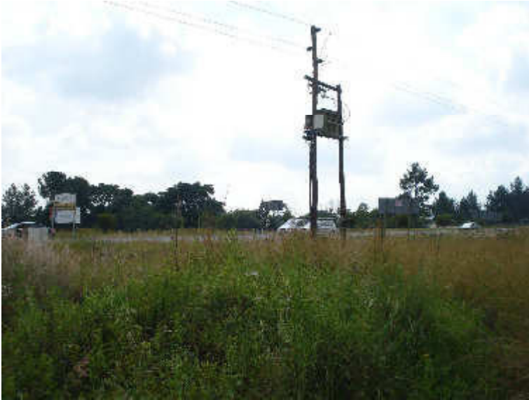
Near Erling Rd William Nicol acces point (western access point) an area suggesting that it was previously farmland/small holdings with homesteads, Currently abonded.