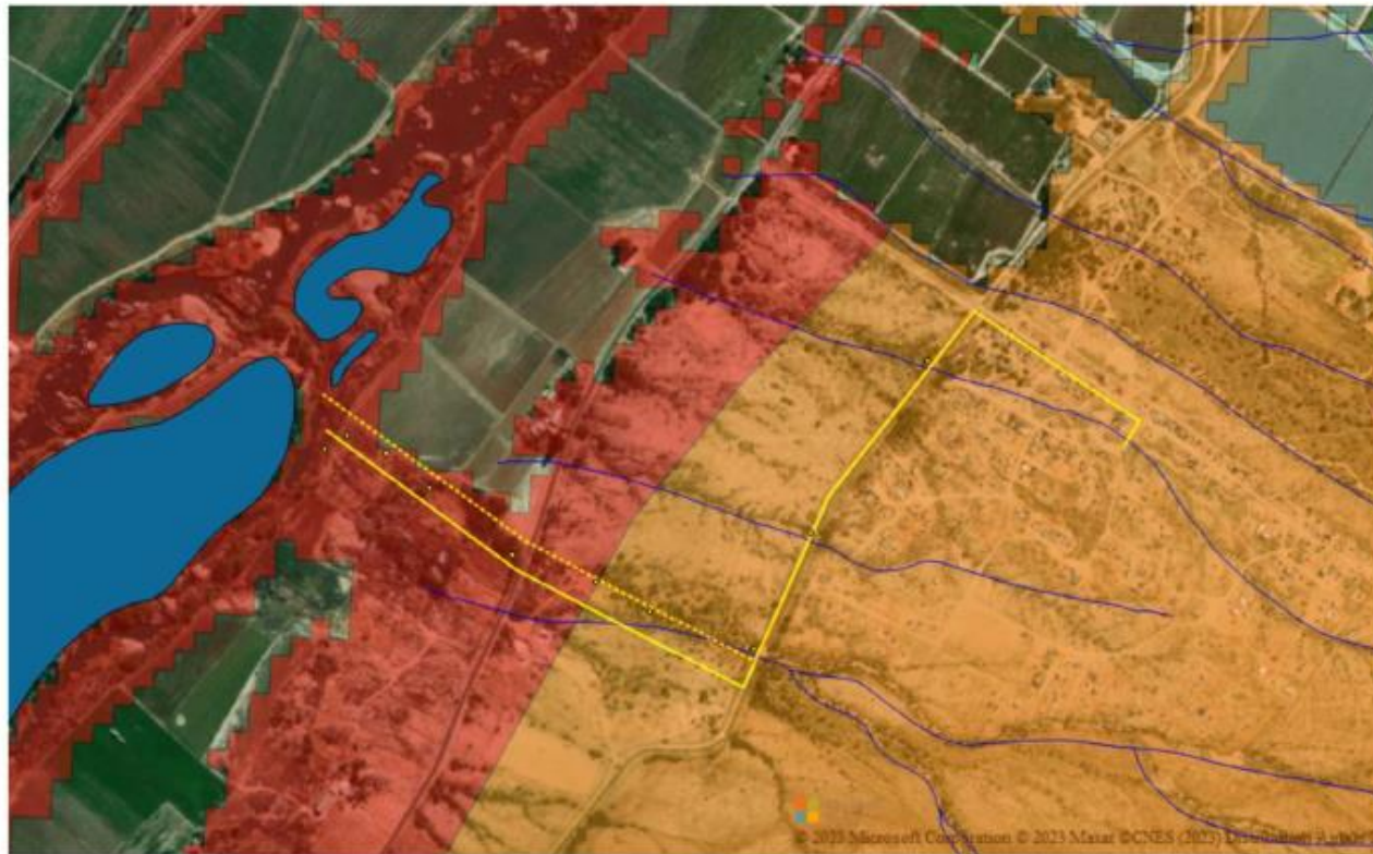
Map 2: Critical Biodiversity Areas map of the proposed abstraction works and pipeline near Plangeni, Northern Cape Province. The pipeline falls within a Critical Biodiversity Area 1 and 2 due to the Orange River, associated wetlands and floodplain with riparian zone which also contains elements of Endangered Lower Gariep Alluvial Vegetation and landscape features such as rocky outcrop. However, given the small footprint of the pipeline and abstraction works, should not compromise the CBA and ecosystem that it preserves.