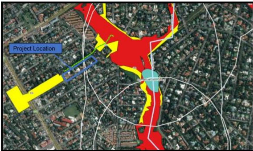
Fig: Environmentally sensitive areas outside the project location