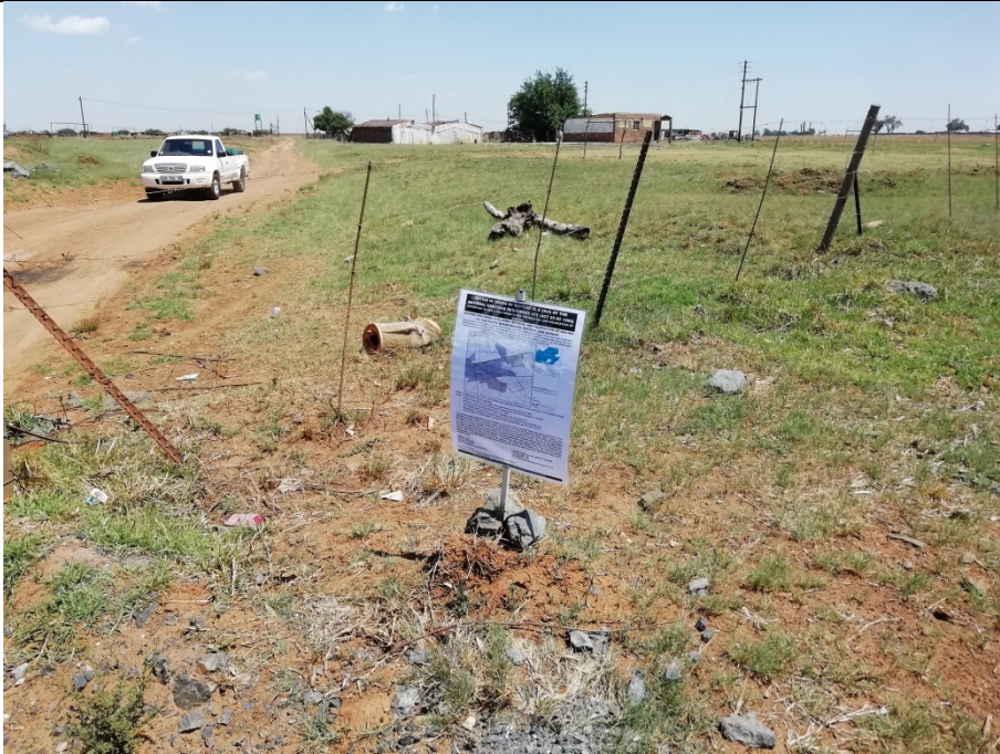
Site Notice 2: Entrance to Rietkuil Community