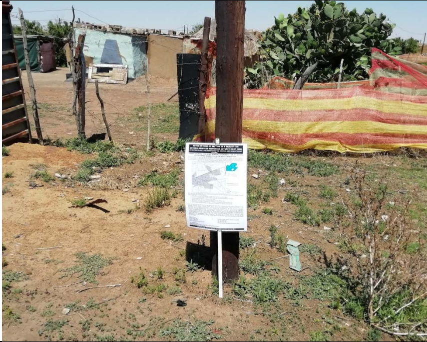
Site Notice 1: Site Notice at centre of Rietkuil community.