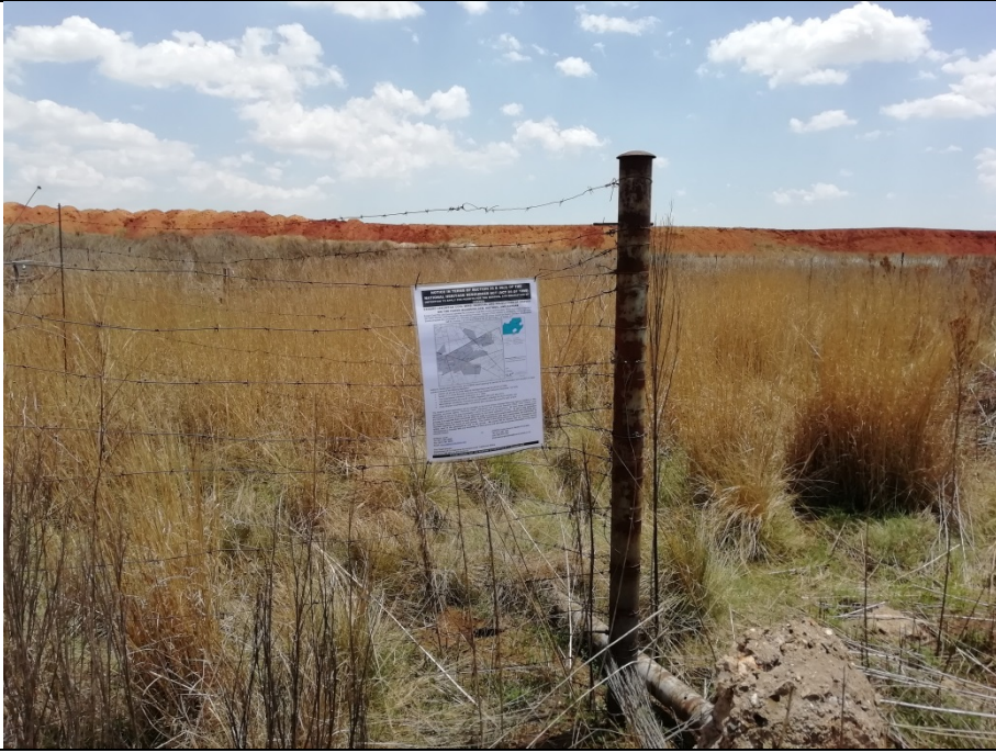
Site Notice 3: Site notice at entrance to Kanbar farm gravesite.