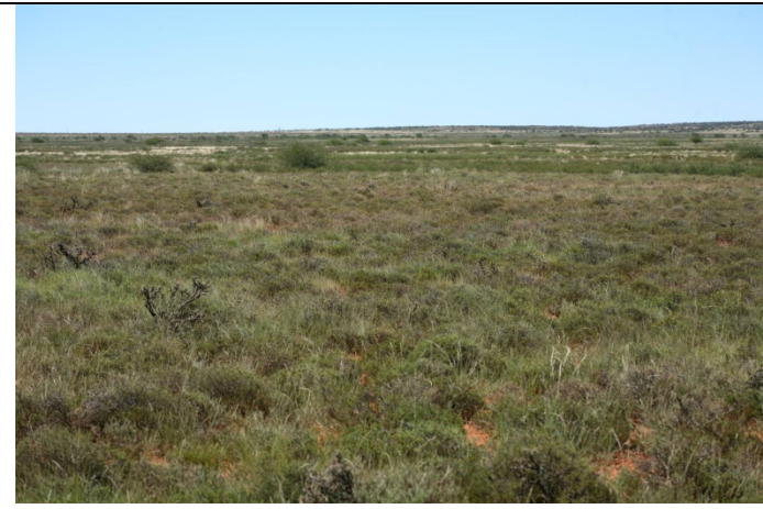
Figure 2: Site 2a Looking northeast down the power line corridor from the boundary of the Garob property, back towards site 1