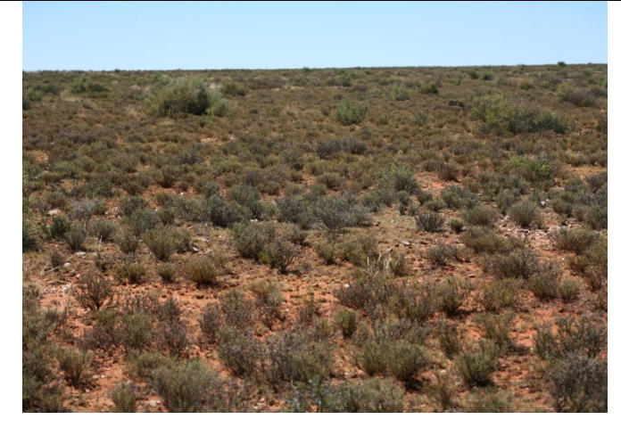
Figure 5: Substation 1: Looking north from the end of the OHPL over the area where the substation will be located.

Location: Substation photographs on Garob Wind Energy Farm subject to a separate EIA process (DEA ref: 14/12/16/3/3/2/279)