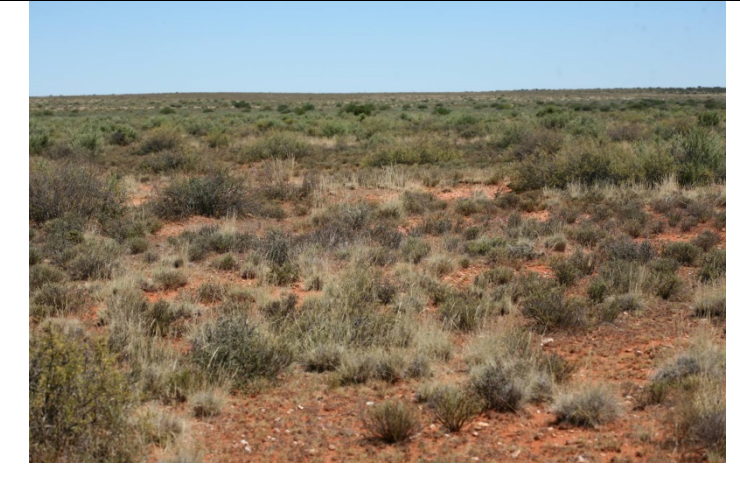
Figure 6: Substation 2: Looking South from the substation down the route where the OHPL will be located.