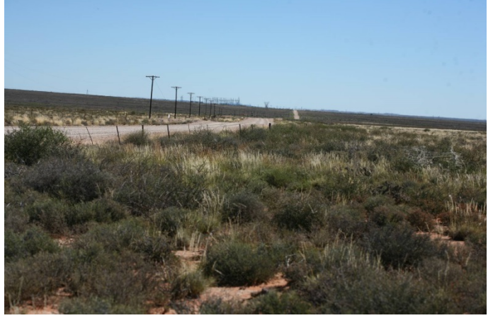
Figure 4: Site 3 Looking from the top of the rise along the final section of the power line route along the main gravel road, towards the substation which can be seen in the distance.