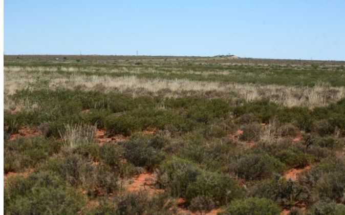
Figure 3: Site 2b Looking south west down the power line corridor towards the main public access road which can be seen in the background. The line changes direction at the road and runs alongside the road from this point onward.