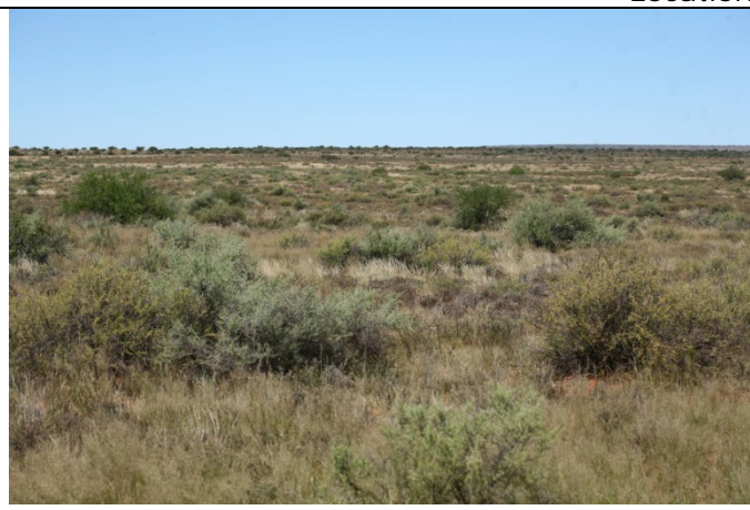
Figure 1: Site 1 Looking south west down the power line corridor from where the access road crosses the path of the line