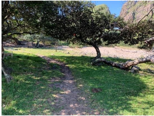
Condition of the existing footpath from the parking area to the Boiling Pot/ Whales Back