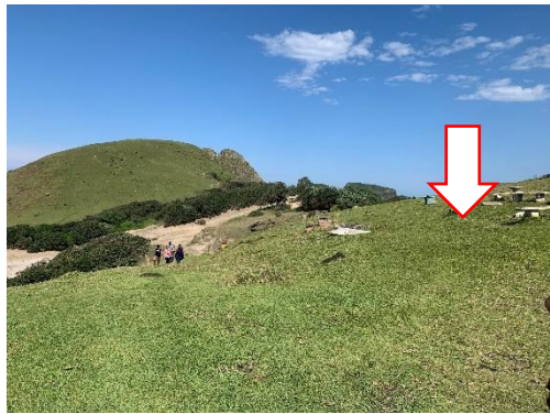
Proposed location for braai and picnic area no.03