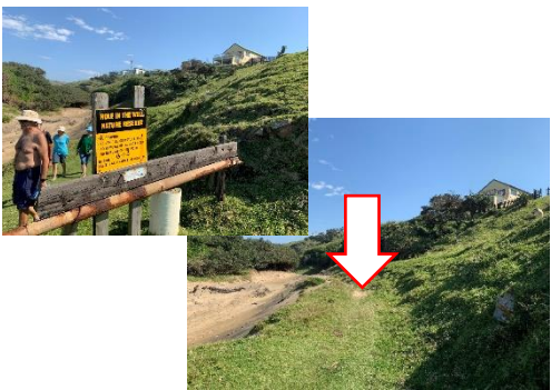
Proposed location for braai and picnic area no.04