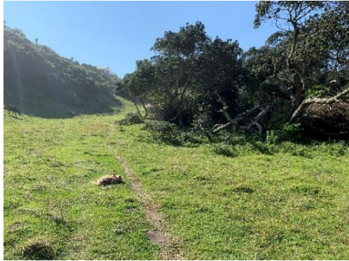
Condition of the existing footpath to access the coastline