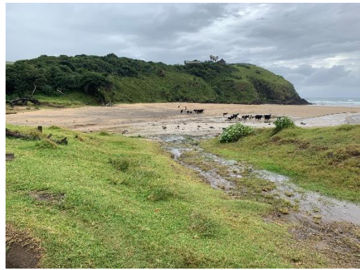
Conditions of the existing boat launch site