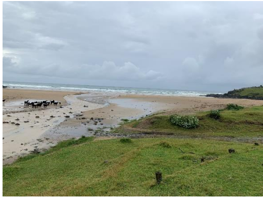
The existing boat launch feeds into the Ntonjane estuary