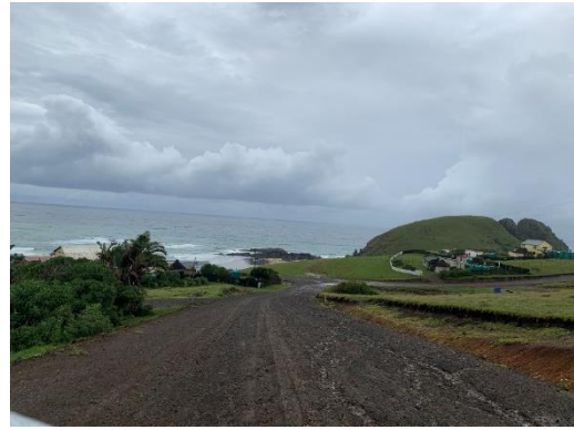
Roadside lighting will be installed along the existing access road between Coffee Bay and Hole in the Wall development nodes