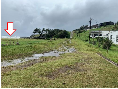
Proposed location for braai and picnic area no.07