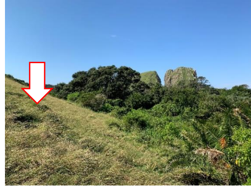
Proposed location for the viewing deck