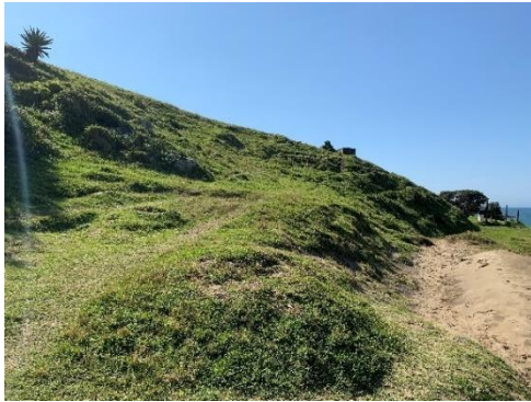
Condition of the existing footpath from dedicated parking area no.01 to the coastline