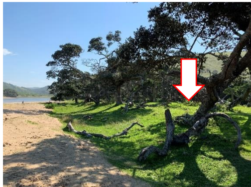
Proposed location for braai and picnic area no.05