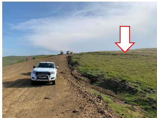
Overview of dedicated parking area no.02