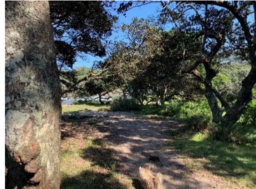
Condition of the existing footpath to access the coastline