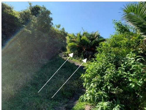
A formalised walkway will replace the existing footpath to provide access to the viewing deck