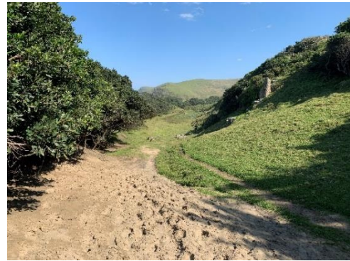
Condition of the existing footpath to access the coastline