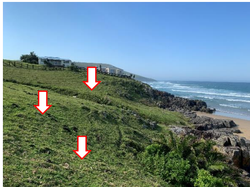
Location for bins and benches at strategic positions along the coastline