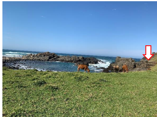
Location for the fishing spot access