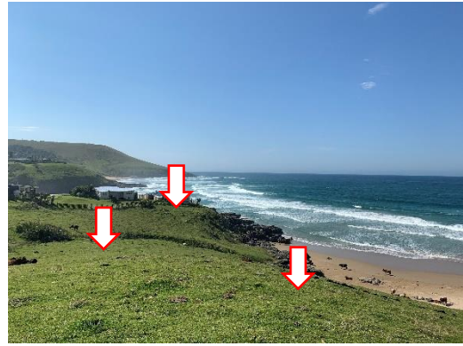
Location for bins and benches at strategic positions along the coastline