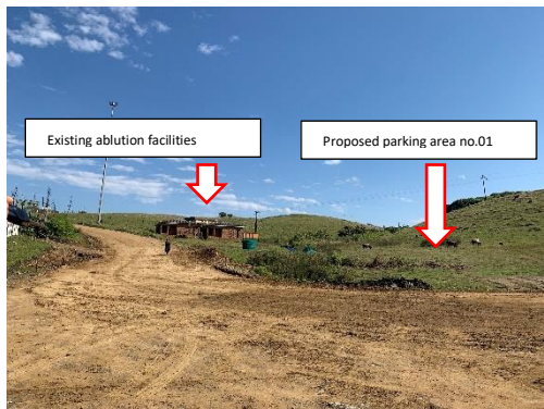
Overview of the dedicated parking area no.01