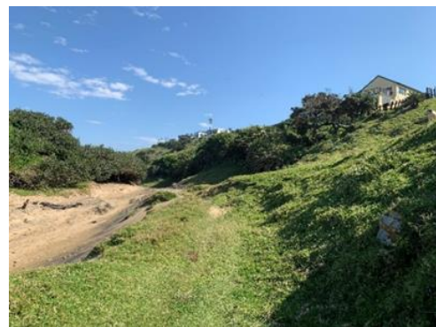
Condition of the existing footpath from dedicated parking area no.01 to the coastline