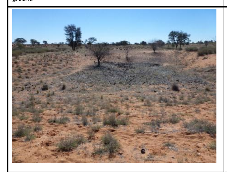
Photo 5: Taken from position 5, looking at the depression near the middle of the site