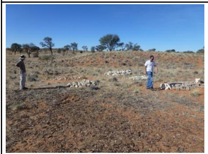
Photo 11: Taken from position 11, looking at the concentration of graves