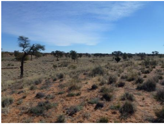
Photo 6: Taken from position 6, looking west from the northern dune.