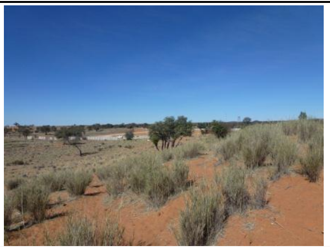
Photo 3: Taken from position 3, looking east towards the sports ground