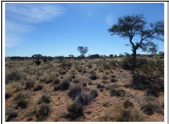
Photo 7: Taken from position 7, looking at one of the came-thorns on site.