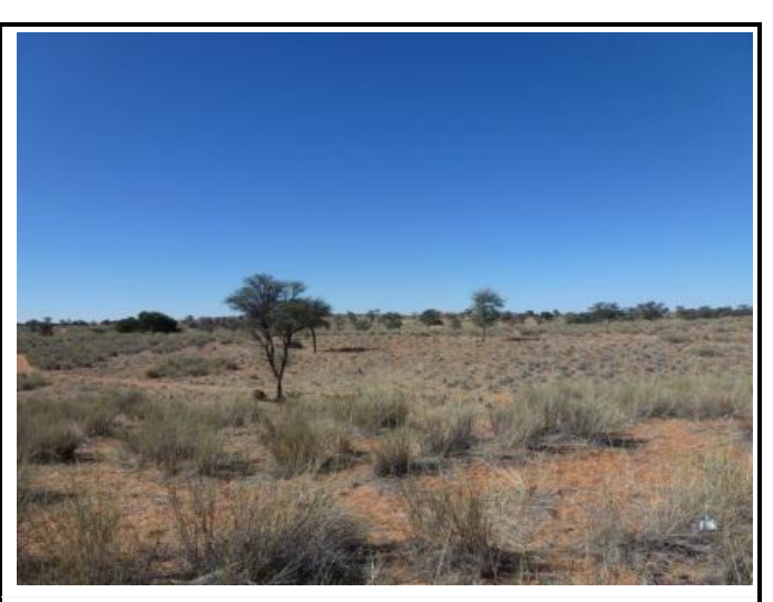
Photo 2. Taken from position 2, looking north from the dune between the proposed site and Kameelduin.