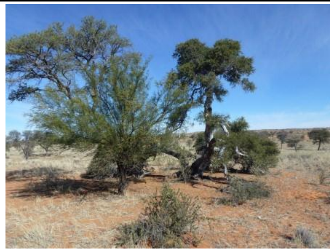
Photo 8. Taken from position 8, looking at one of the mature Sheppard's Tree on site