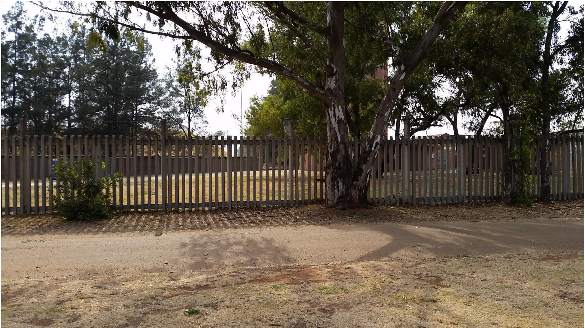
Plate B8: Photographs from the centre of the site looking East.