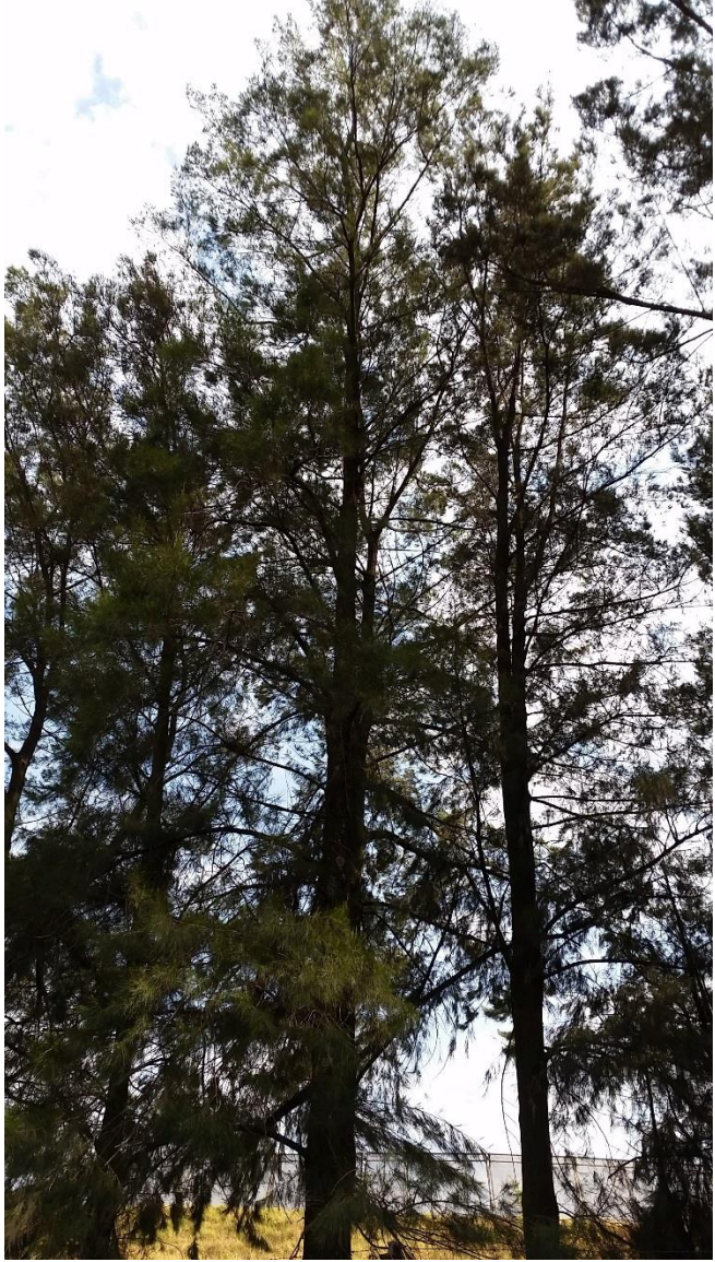
Plate B21: Invasive pine trees on site.