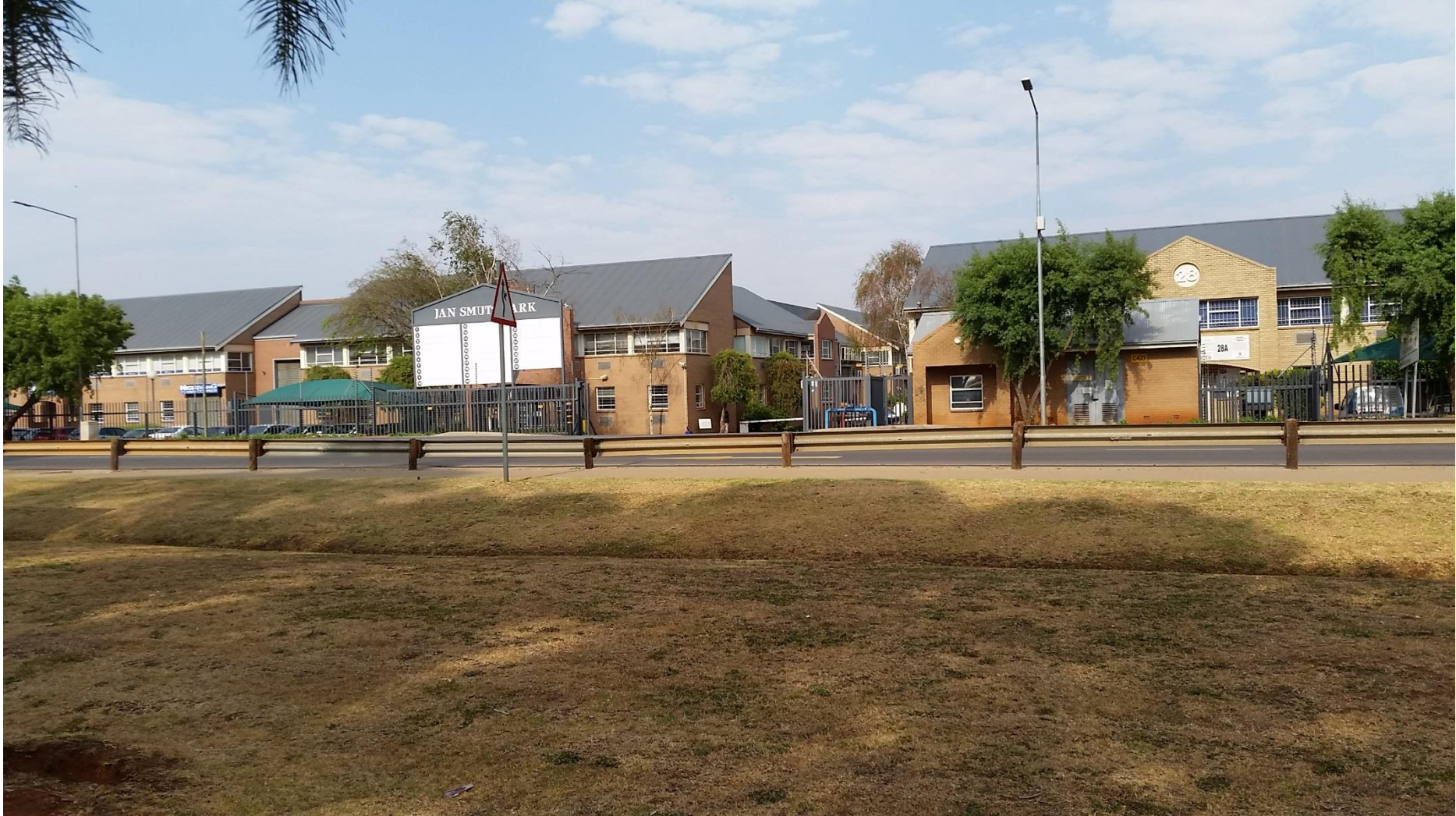
Plate B4: Photographs from the centre of the site looking South-West.