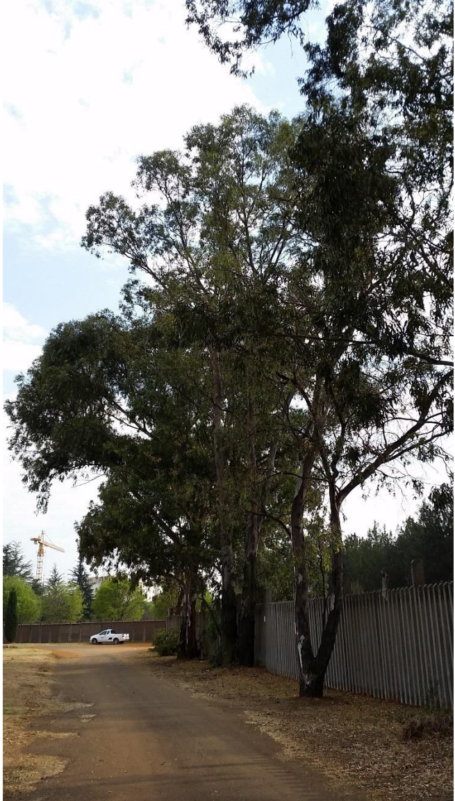
Plate B16: Invasive Gum trees on site..