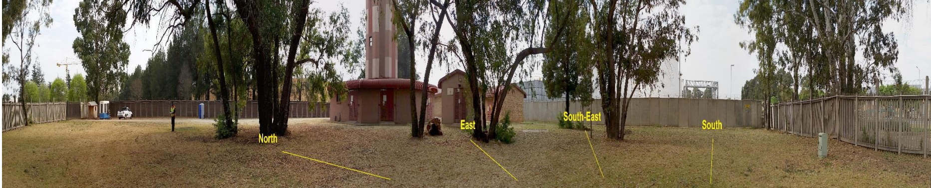
Plate B11: Photographs from the inside of the ATNS property on site.