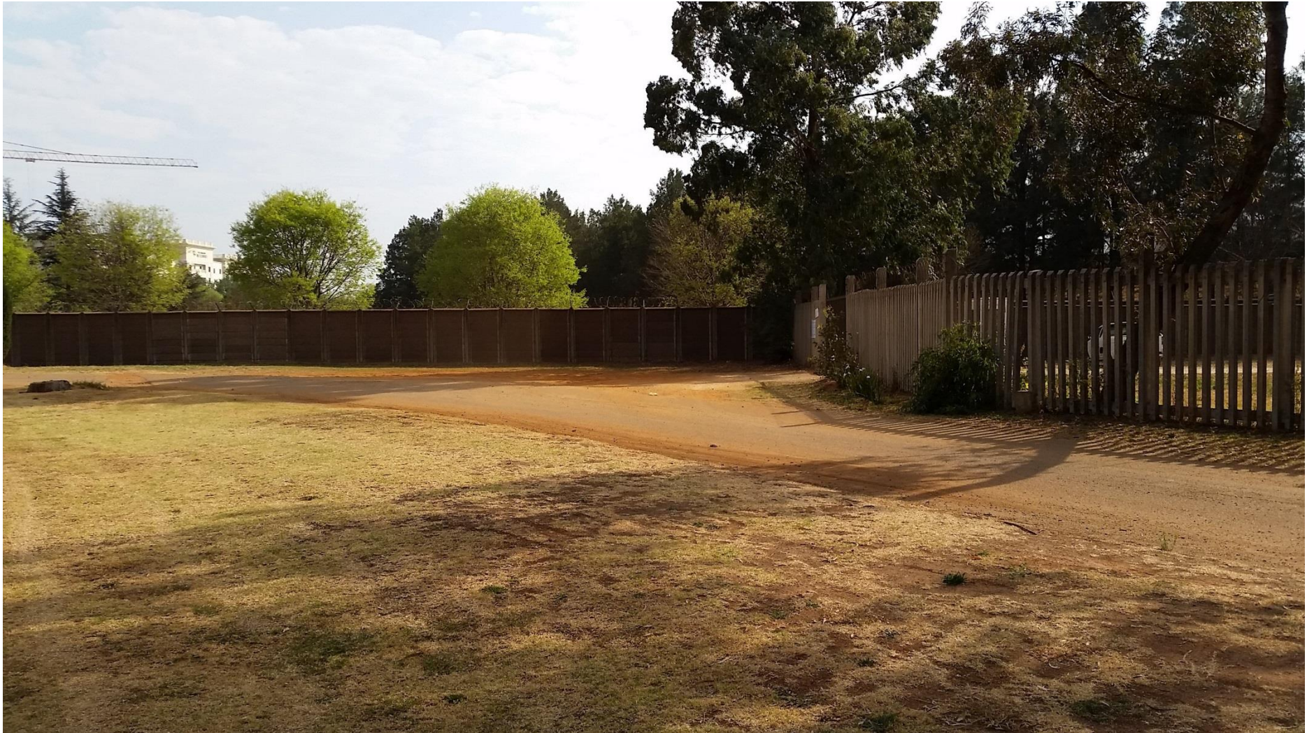
Plate B1: Photographs from the centre of the site looking North.