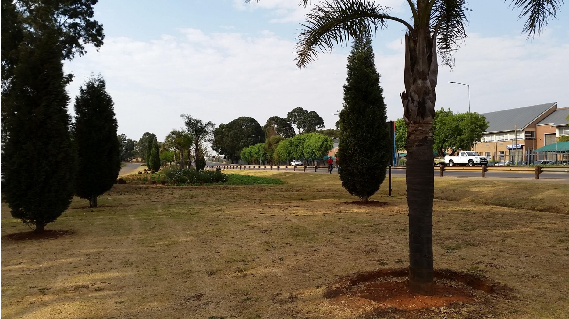
Plate B5: Photographs from the centre of the site looking South.