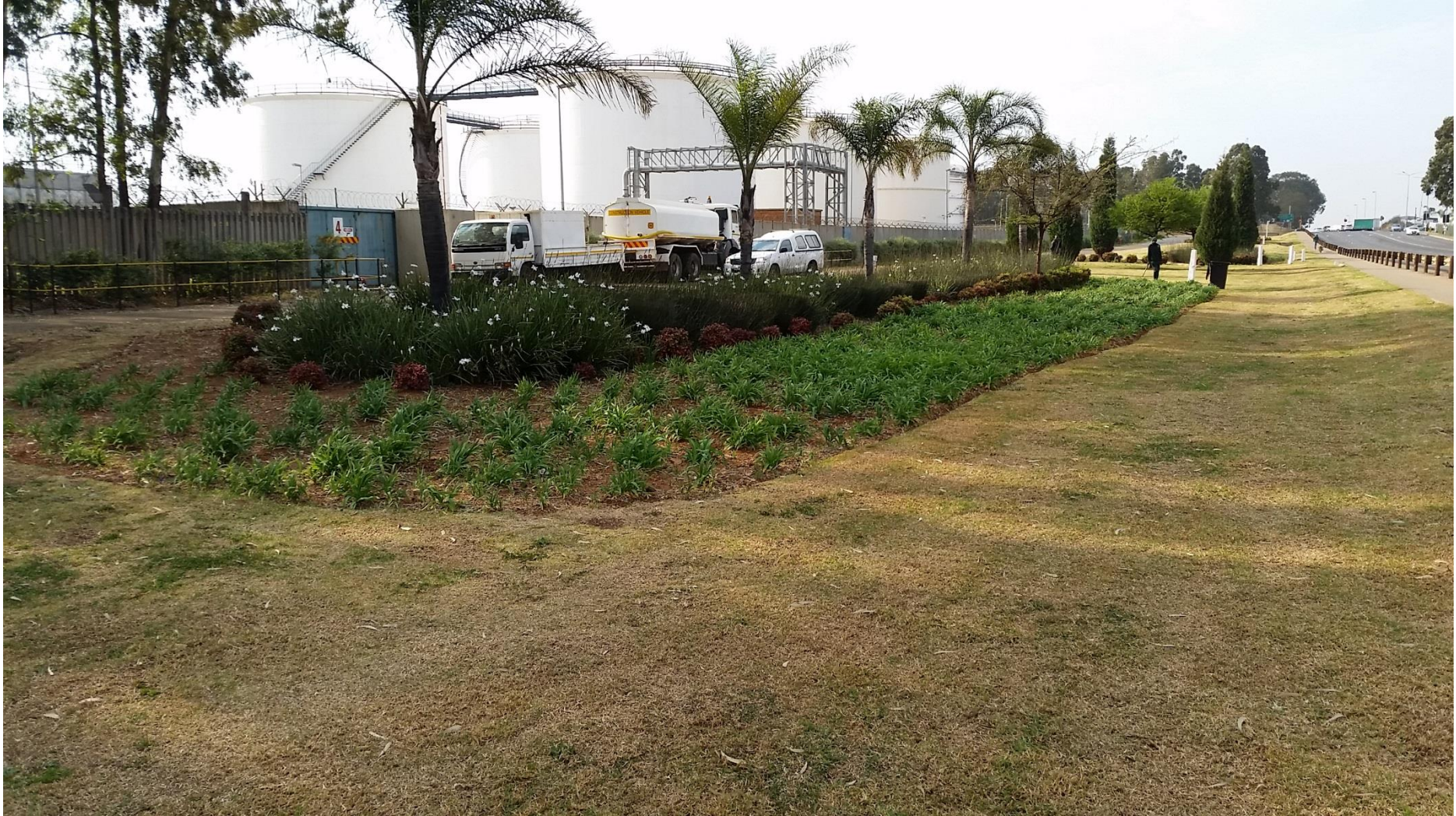
Plate B14: Manicured gardens located towards the southern end of the site. During the site visit garden staff were busy maintaining the gardens. Lawn mowing occurs regularly.