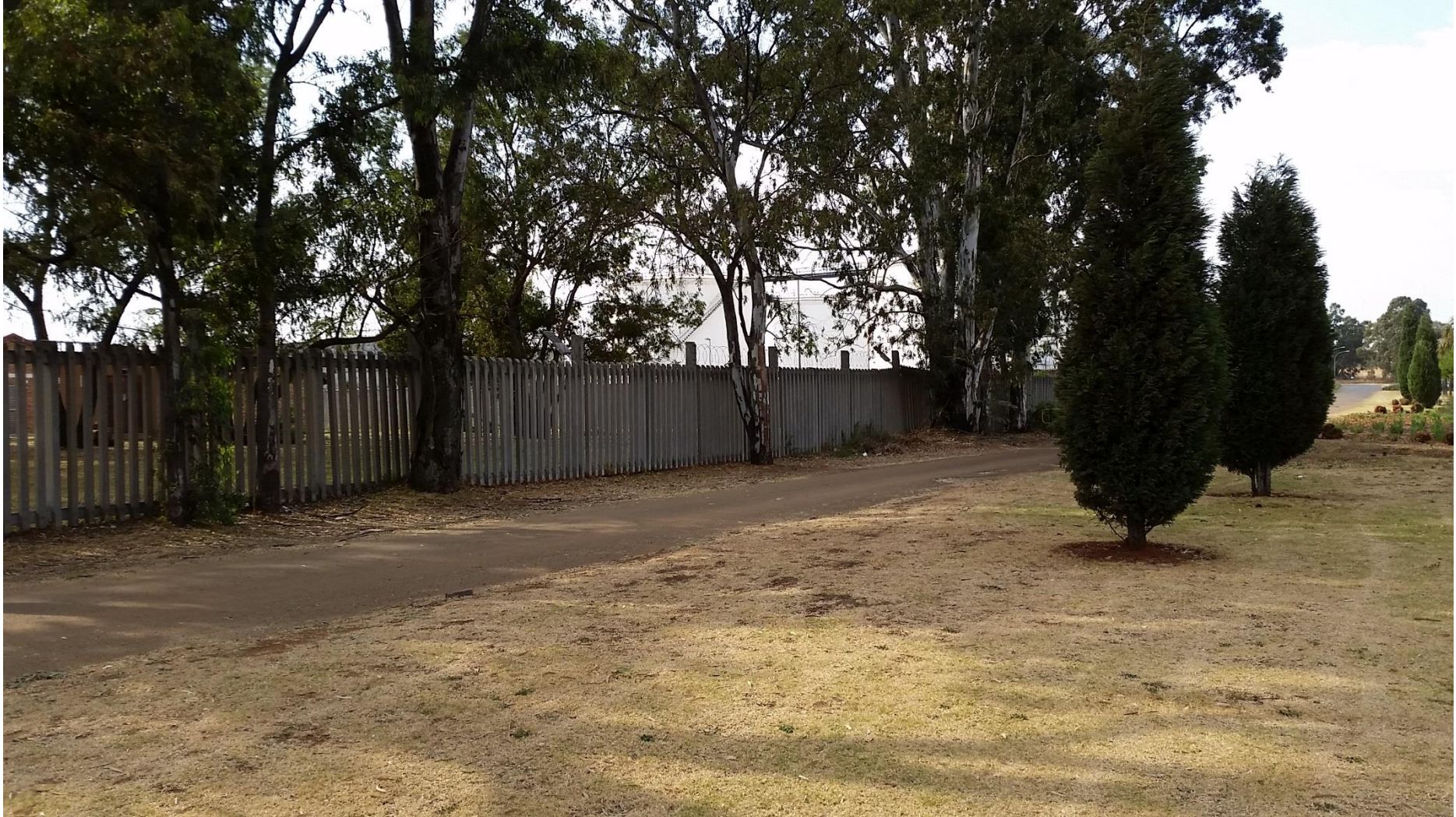
Plate B7: Photographs from the centre of the site looking South-East.