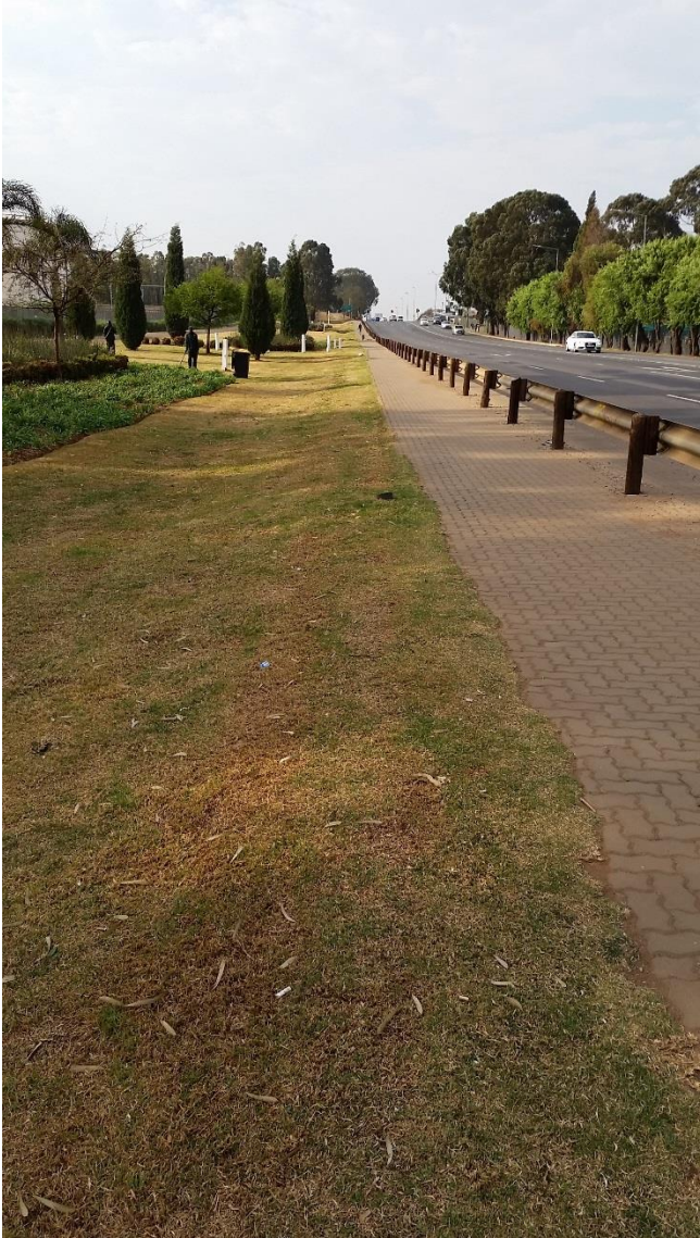
Plate B16: View of the Jones Road pedestrian walkway.