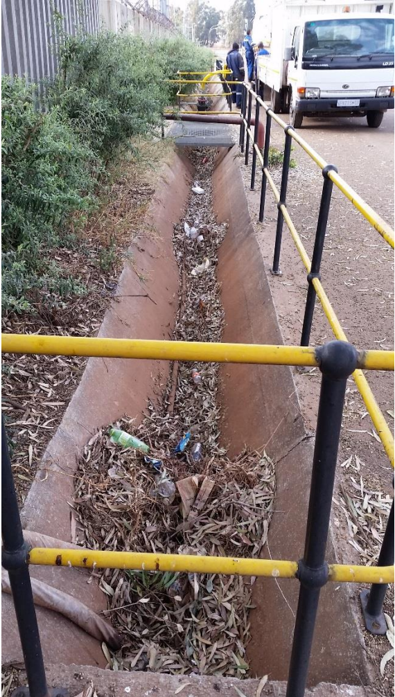
Plate B17: Drainage ditch outside fuel storage tank facility, on the south end of site.