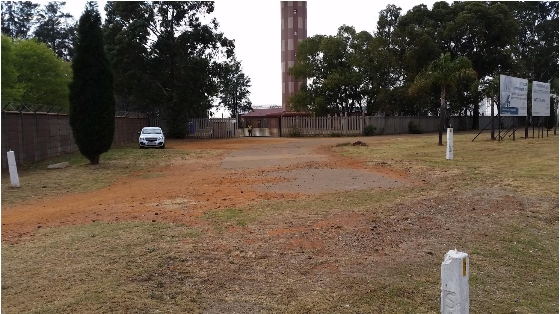
Plate B16: View of the site from Jones Road pedestrian walkway