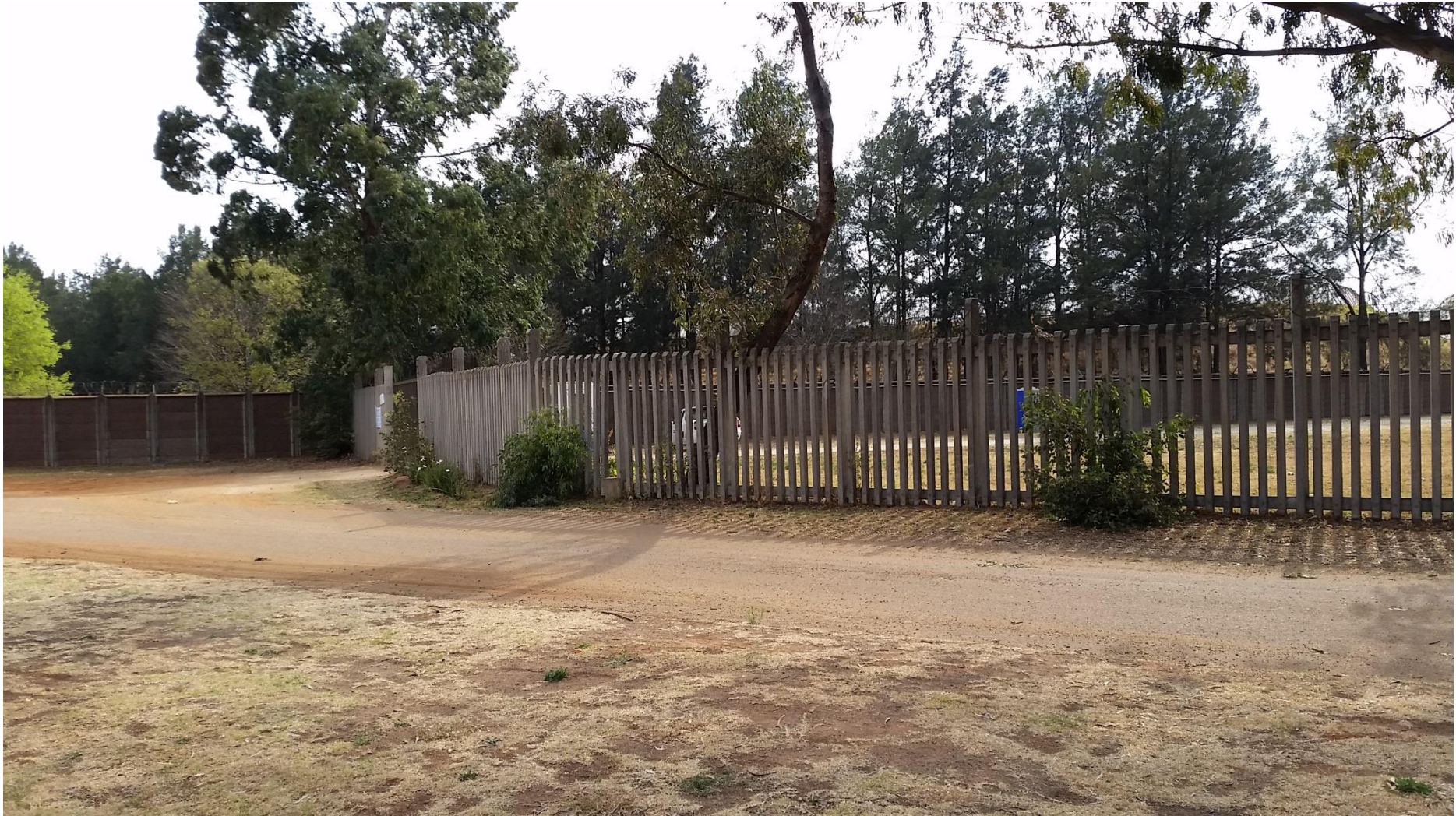
Plate B9: Photographs from the centre of the site looking North-East.