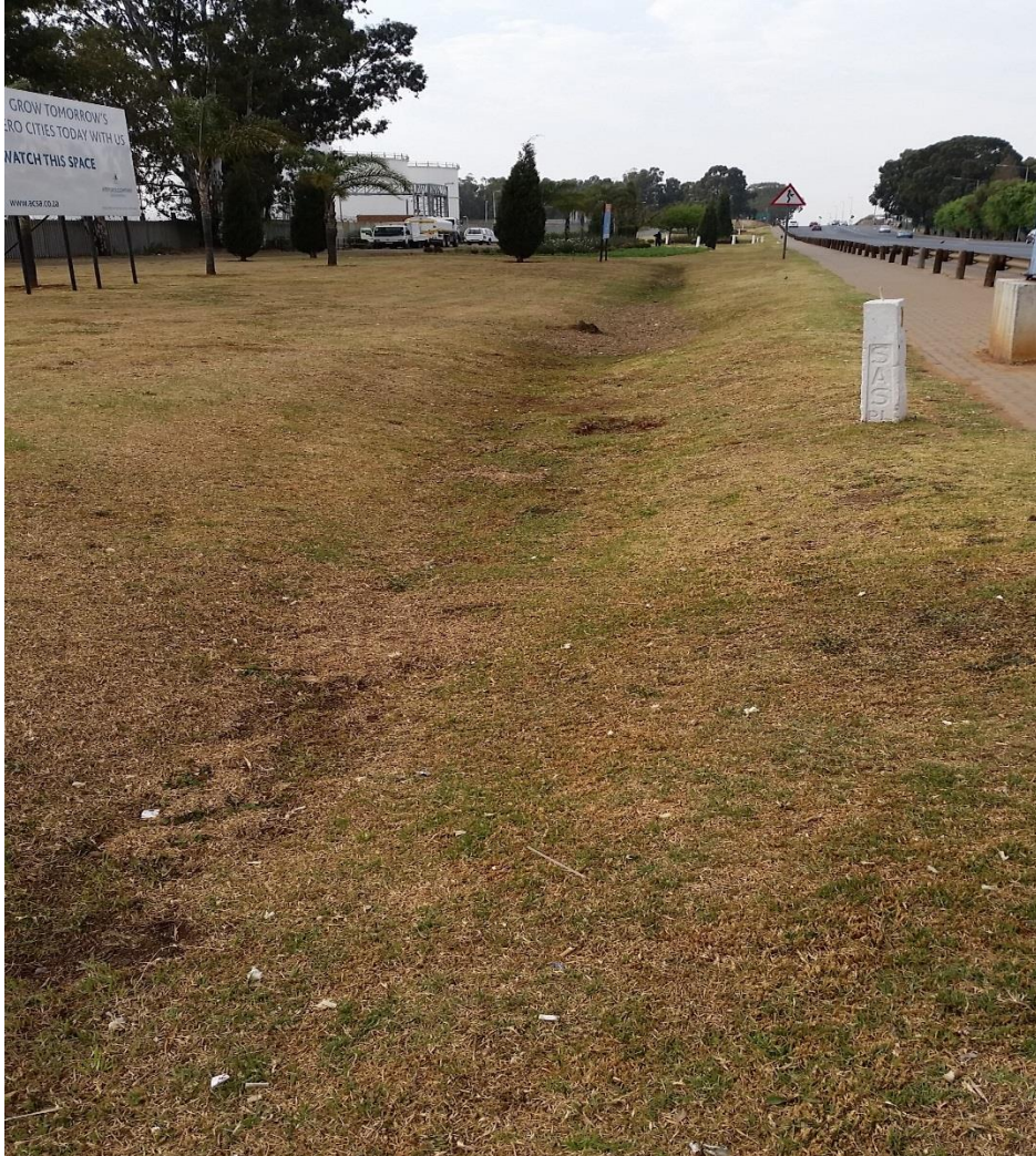
Plate B12: Drainage ditch near the walkway on Jones Road. Water pools and drains from here to the municipal stormwater drain.