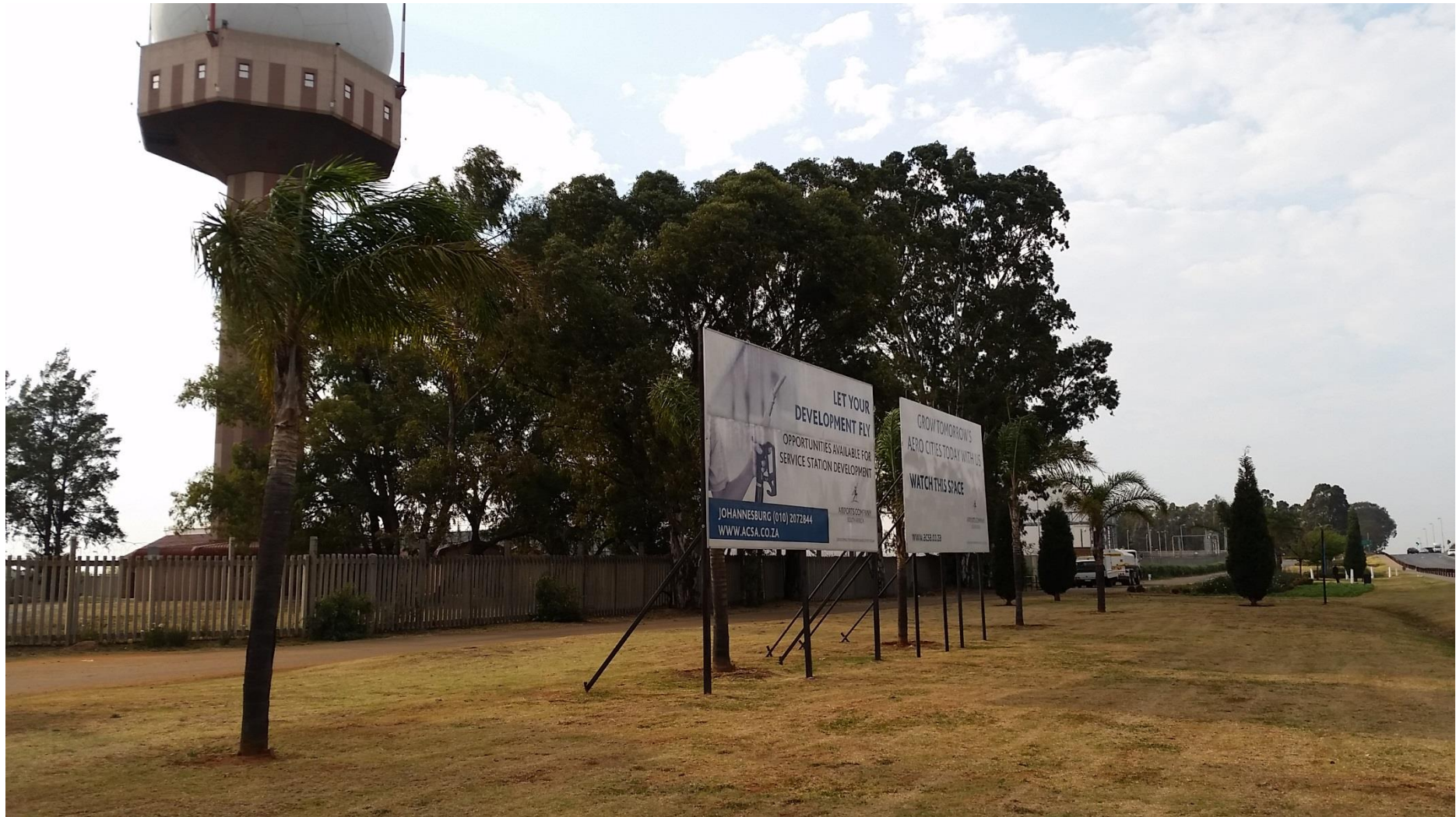
Plate B16: View of the site from Jones Road pedestrian walkway.