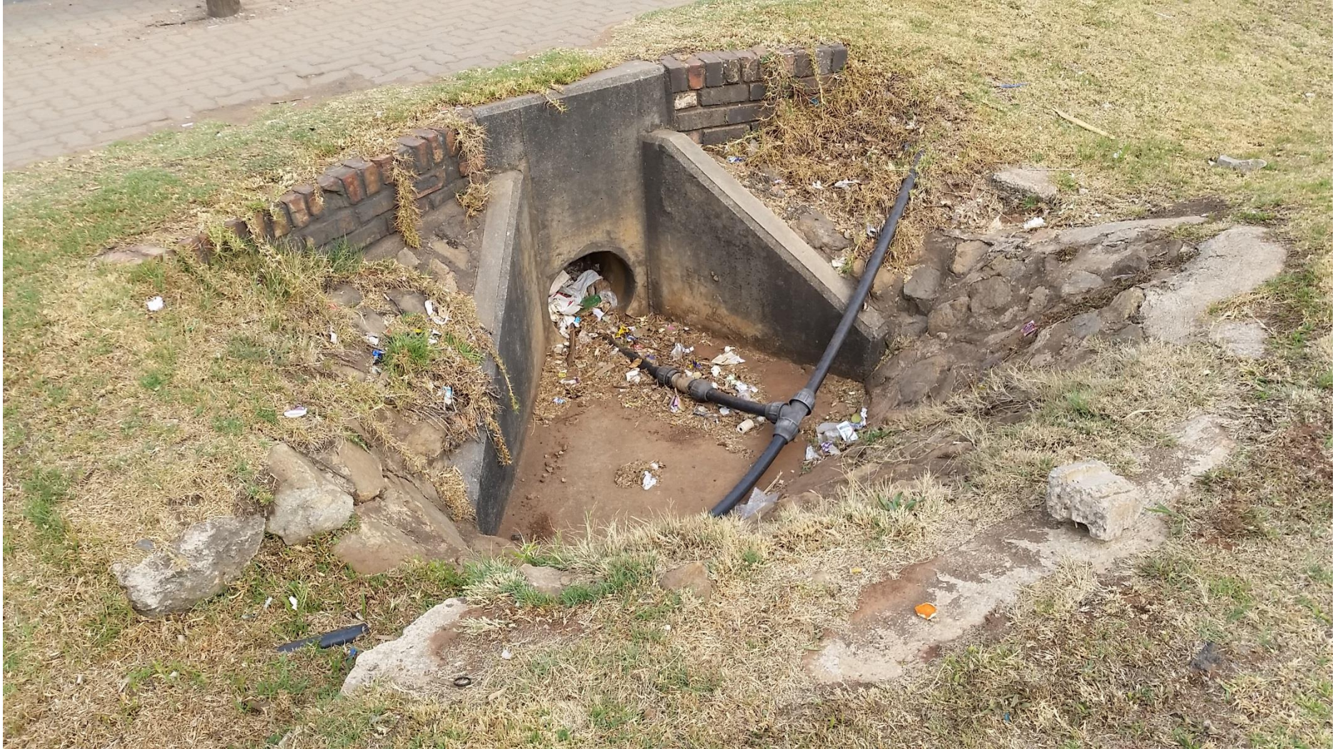
Plate B13: The municipal stormwater drain located in the North-Western corner of the study area. It is located immediately adjacent to the pedestrian walkway.