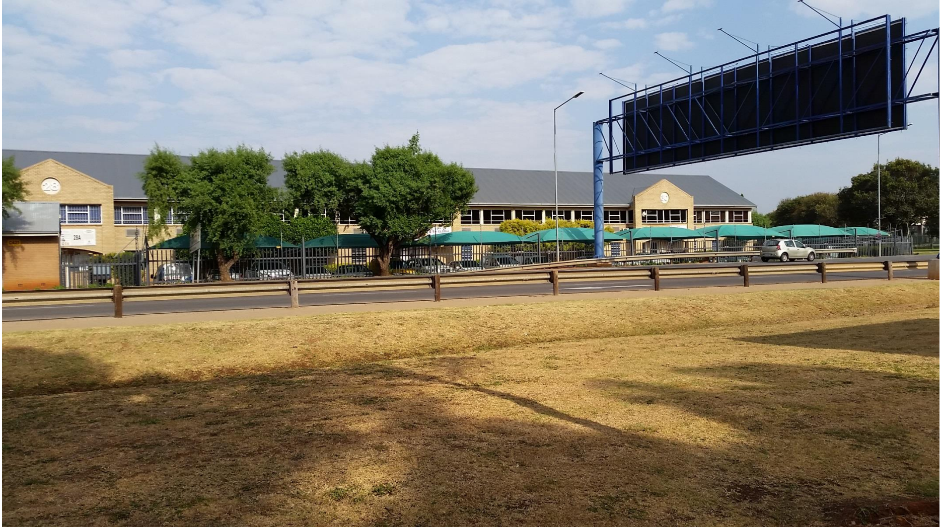
Plate B3: Photographs from the centre of the site looking West.