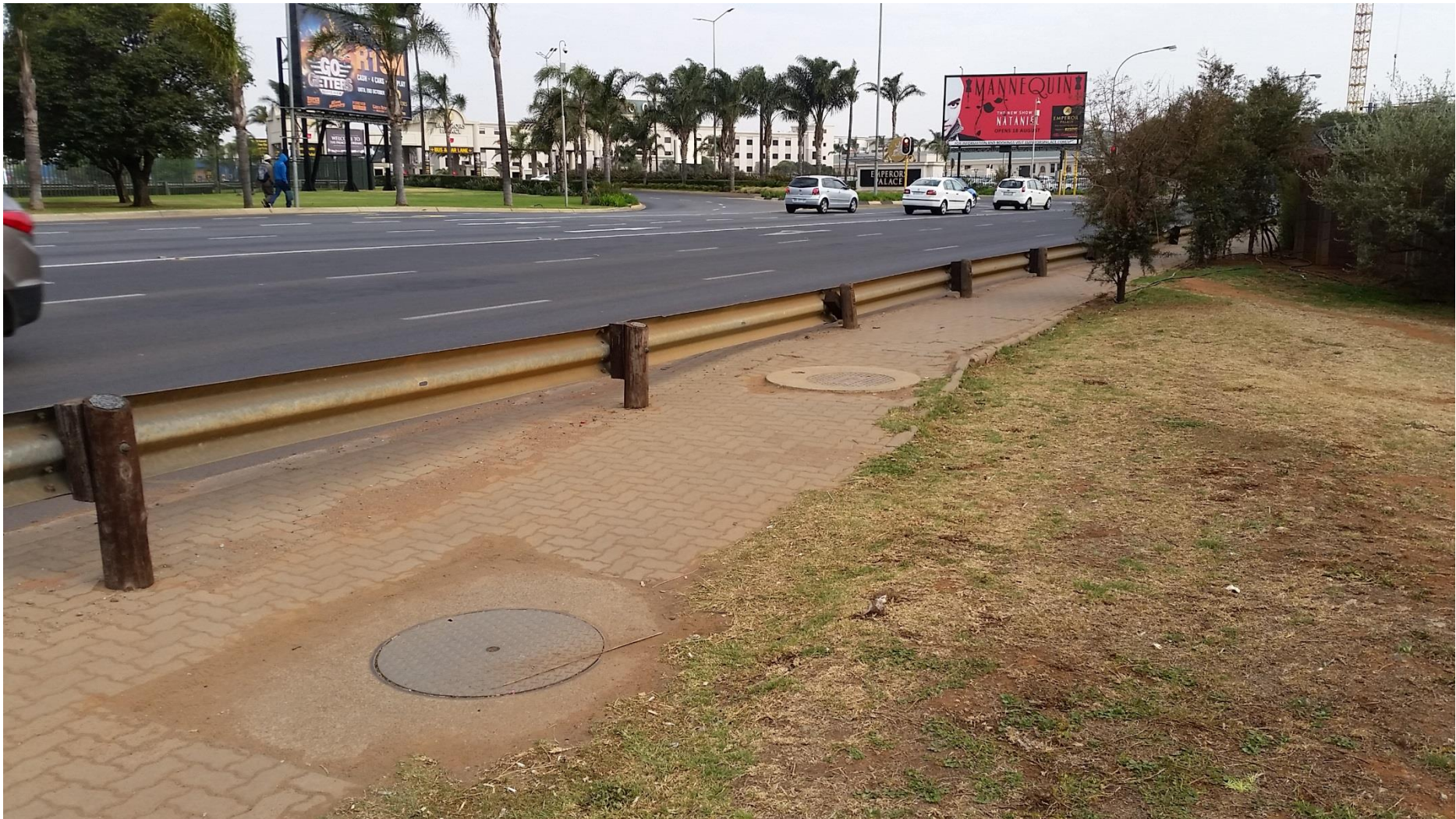
Plate B15: Pedestrian walkway and stormwater mains showing along Jones Road, toward the North-Western corner of the study area.