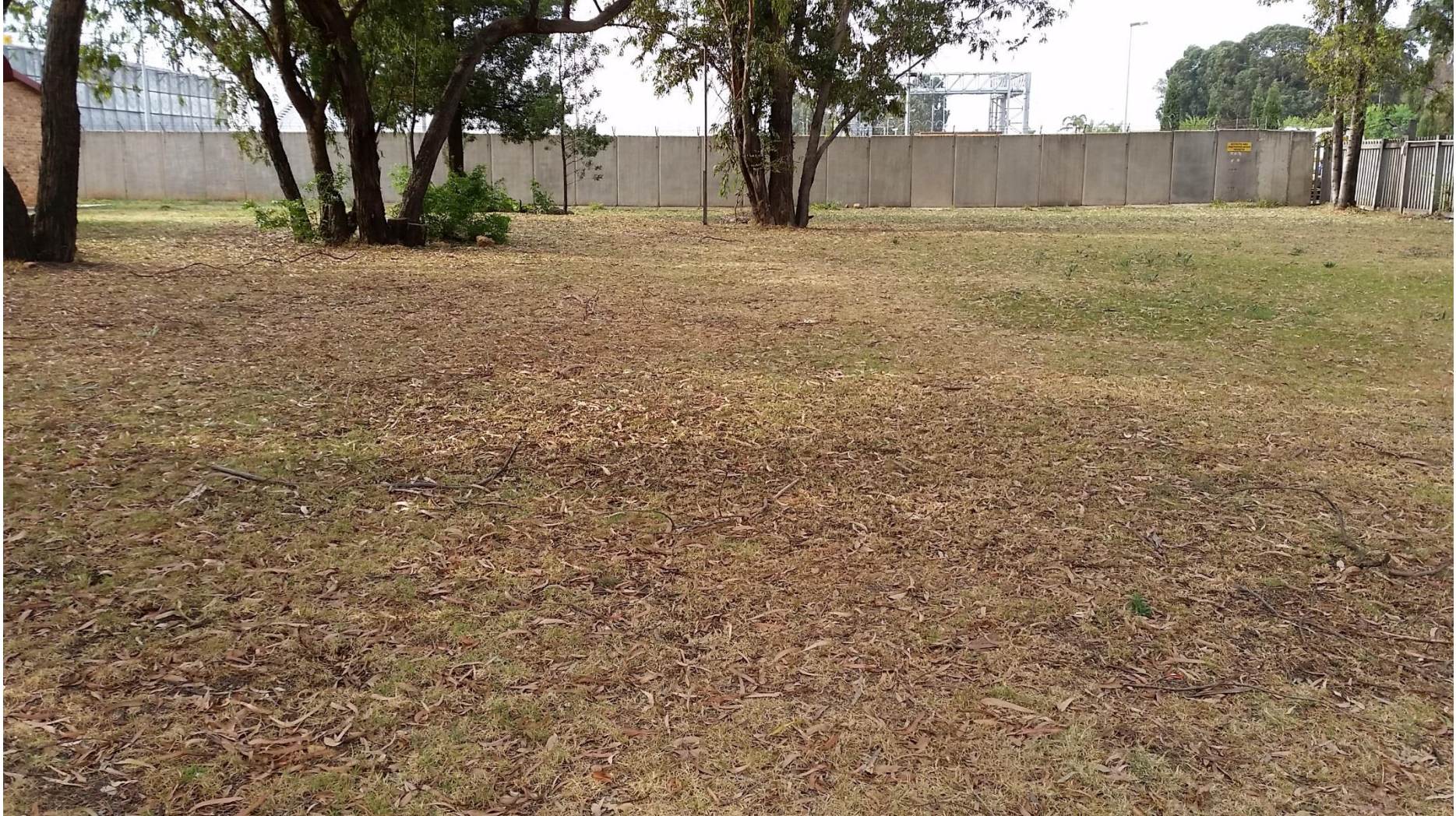
Plate B18: Vegetation cover inside the ATNS portion of the site.