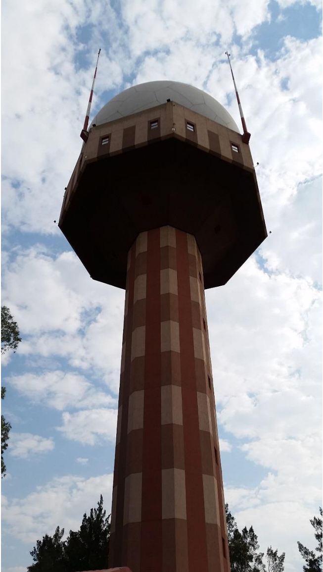
Plate B19: ATNS communications tower on site.