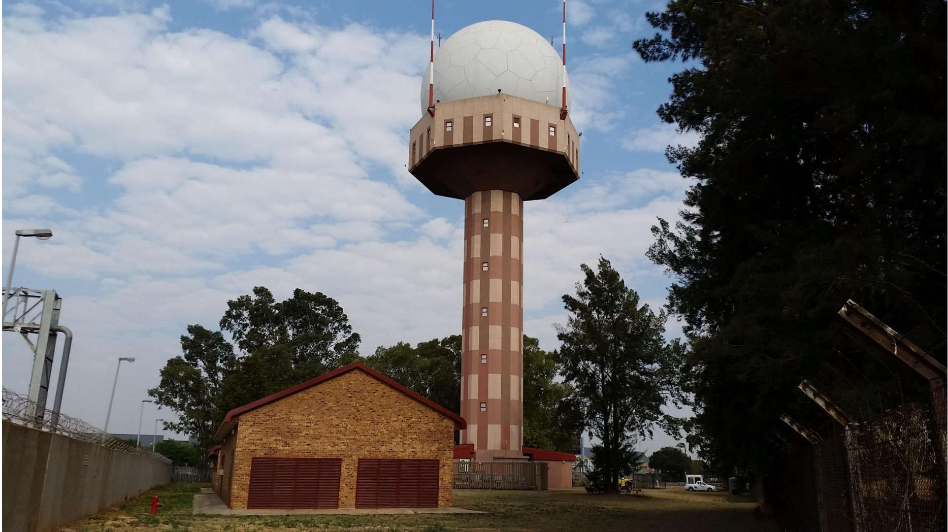
Plate B22: Looking across the ATNS part to site (near white bakkie in background).