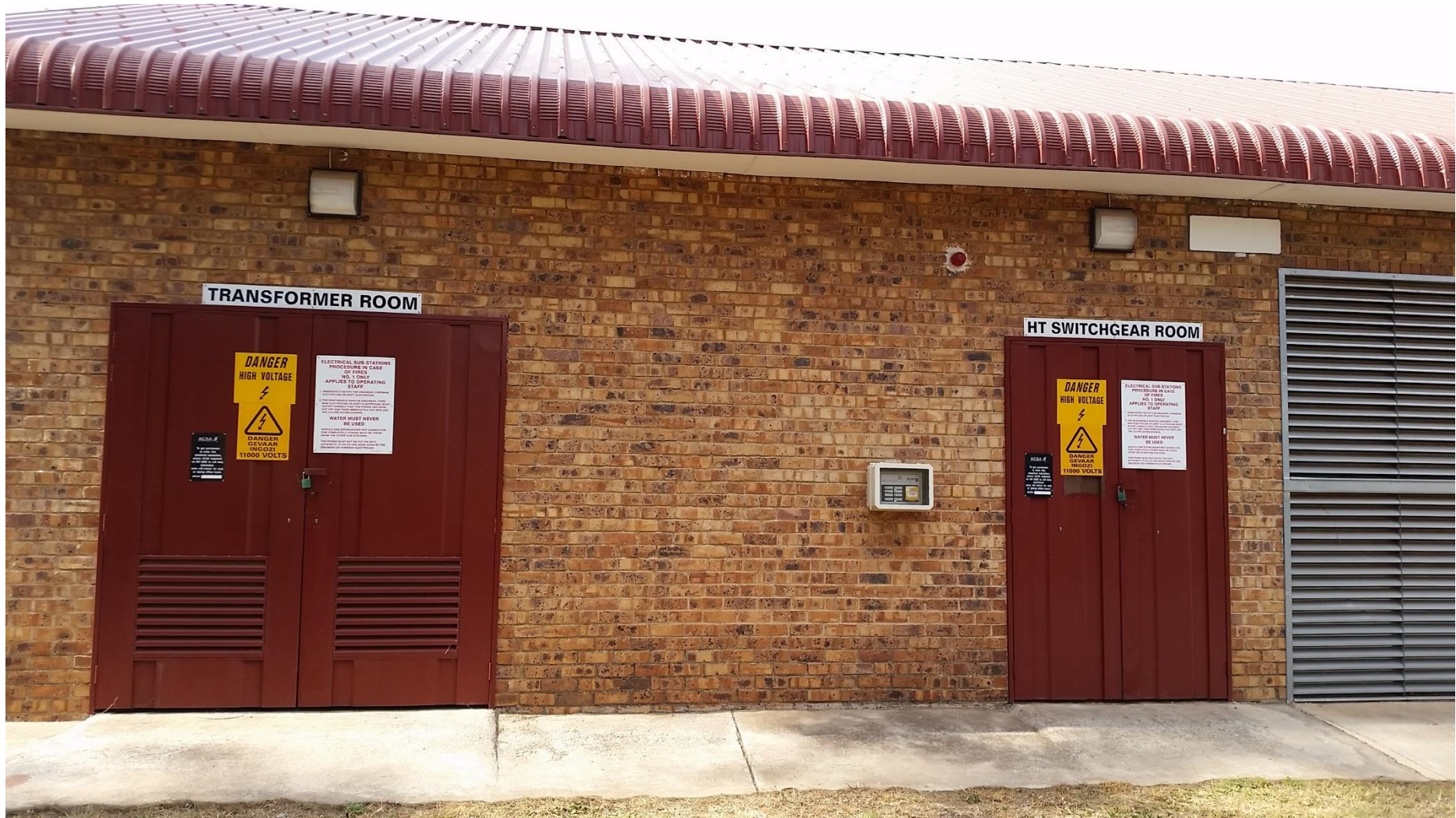
Plate B20: Electrical switching facility on the ATNS portion of site.