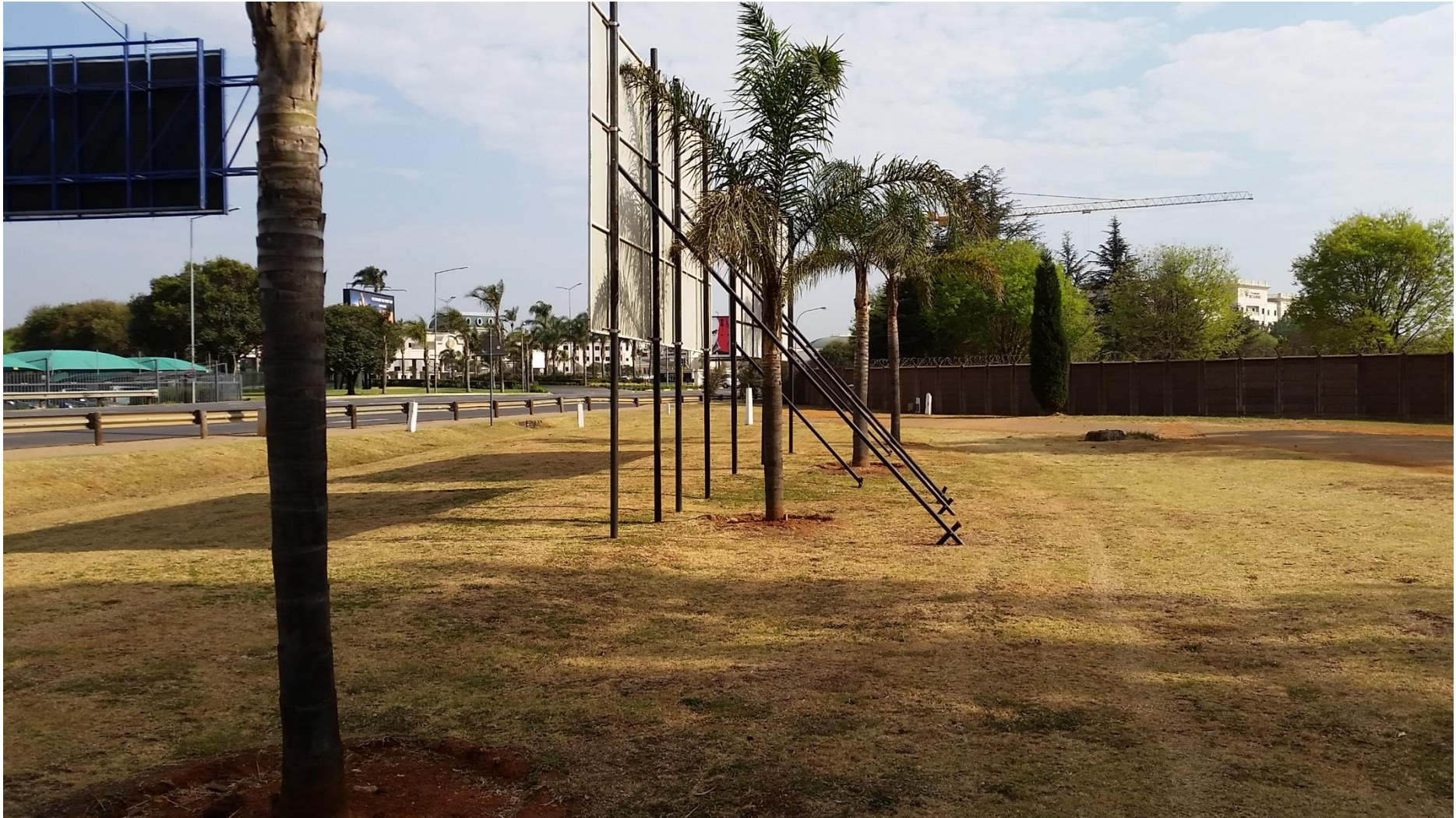
Plate B2: Photographs from the centre of the site looking North-West.