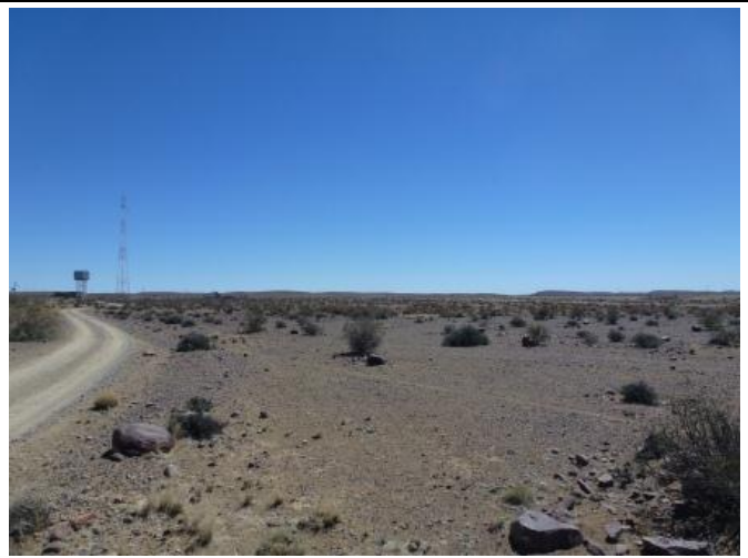
Photo 9: Taken from position 9, looking west towards the entrance road