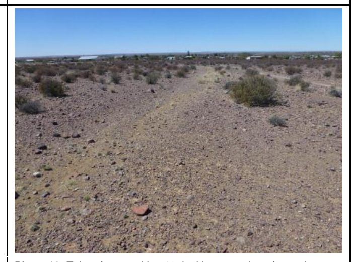
Photo 10: Taken from position 10, looking east along footpath crossing the site