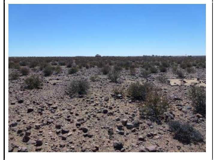
Photo 11: Taken from position 11. Rocky nature of the site clearly evident