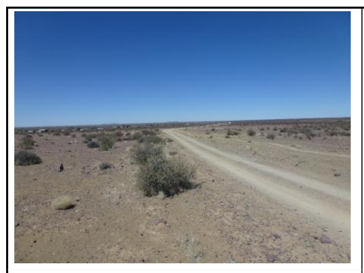
Photo 7: Taken from position 7, looking east along entrance road. Site is to the left of the road