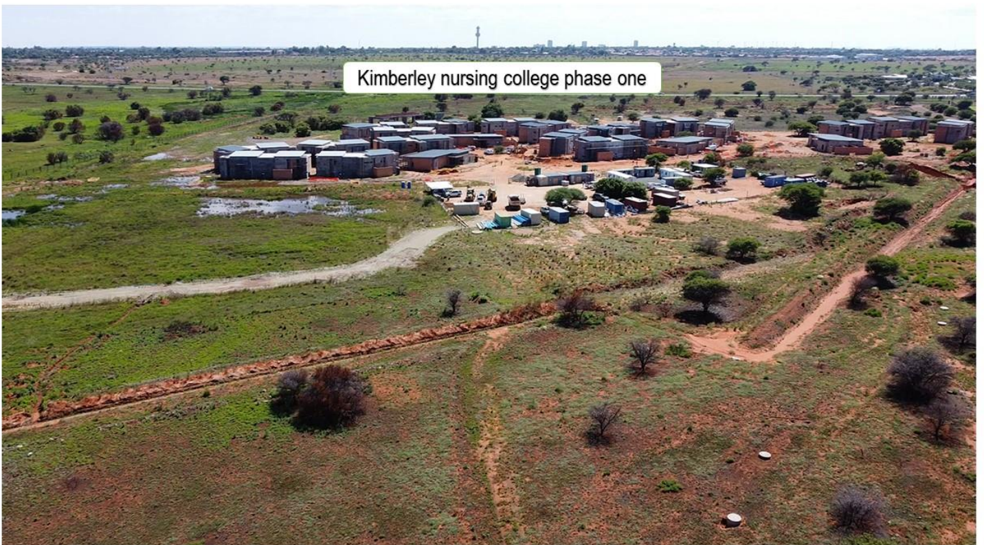
Figure six shows and views the study area in a “ W ” orientation. The Kimberley nursing college phase one is built next to a wetland which is seen far left distant.