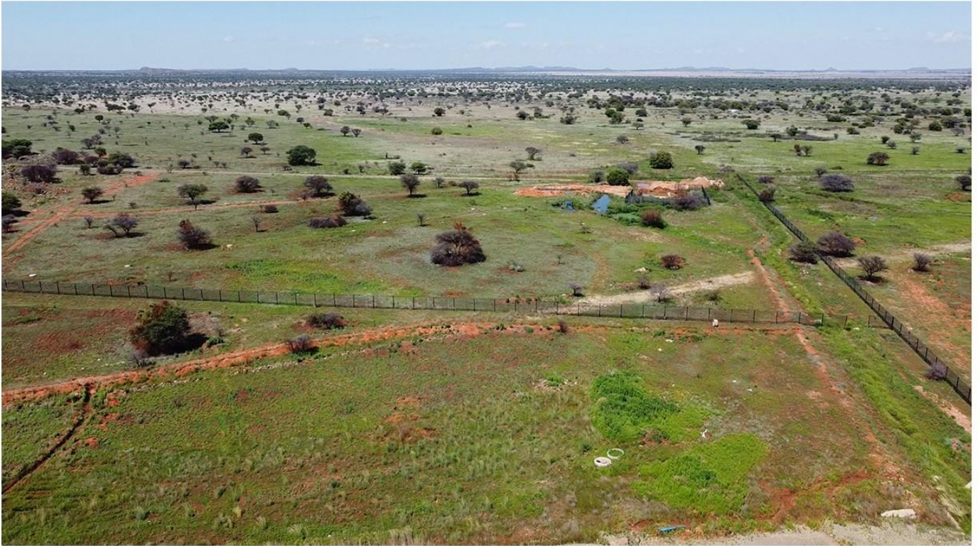
Figure three shows and views the study area in a “SW” orientation. There is a visible fencing that separates the development site and where the sewer pump station is situated. Far right, there is a constructed sewer pump station.