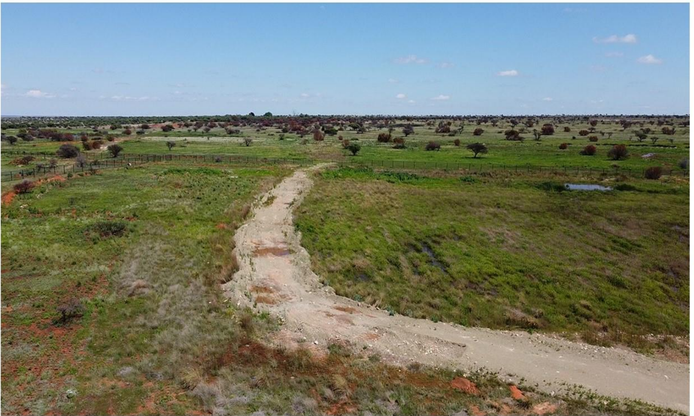
Figure one shows and views the study area in a “NE” orientation. Far right, there is a visible surface water which ideally means that the development is situated in wetland area. There is also a gravel road which curves towards the fencing of the development site