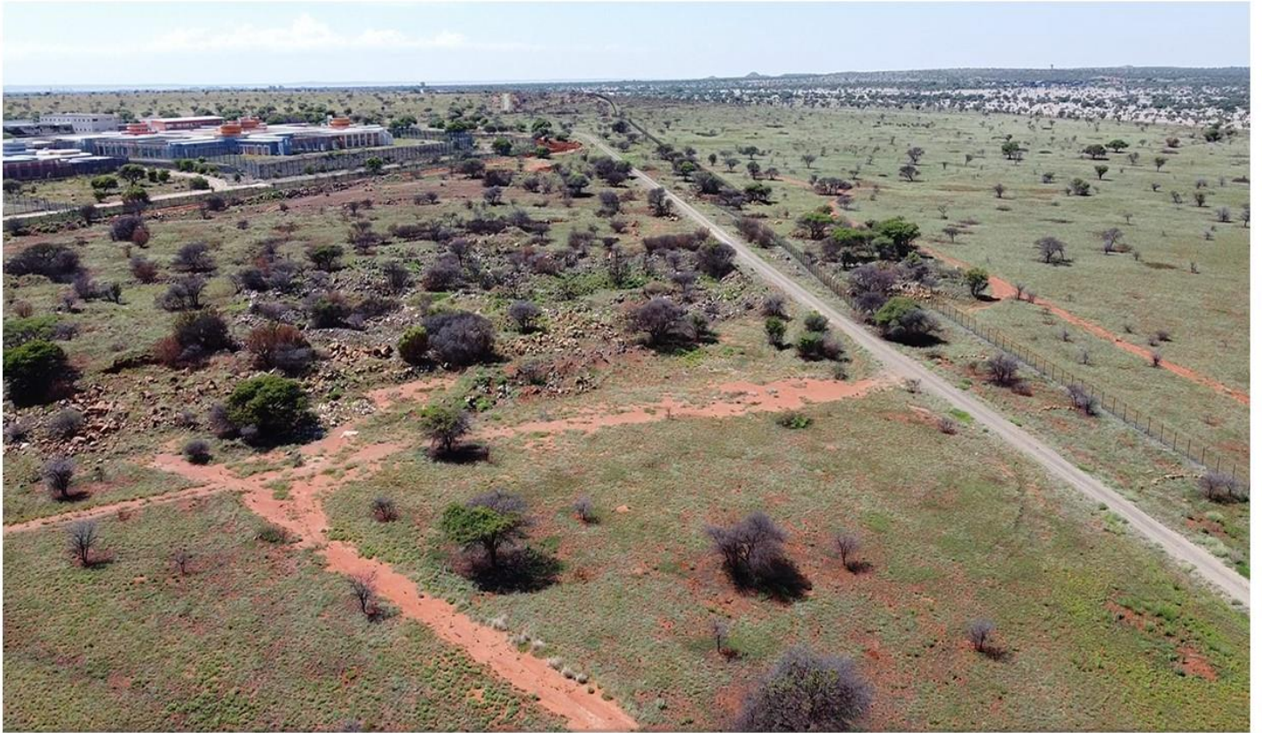
Figure five shows and views the study area in a “ SW ” orientation. It is evident that there are small rocky patches found in between the camel thorn trees.