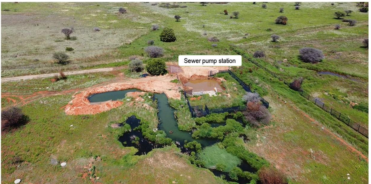
Figure four shows and views the study area in a “SE” orientation with a built-up sewer pump station for the development site. It is evident that there is surrounding groundwater next to the sewer pump station.