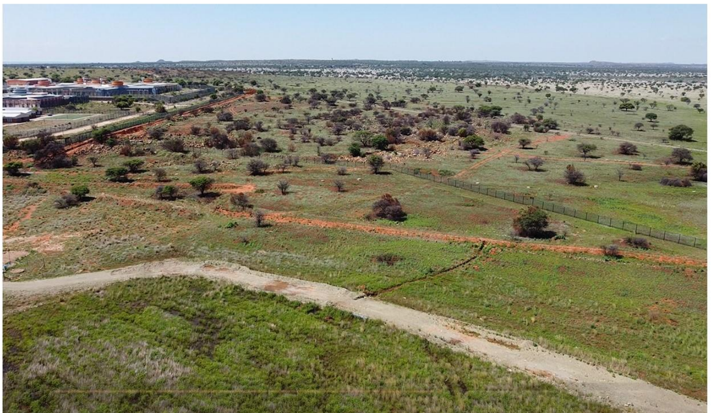
Figure two shows and views the study area in a “SW” orientation. Far beyond the curve gravel road, is there are grown clusters trees. Far left is the small portion of the well-developed Kimberley mental health hospital which situated next to the phase one Kimberley nursing college.