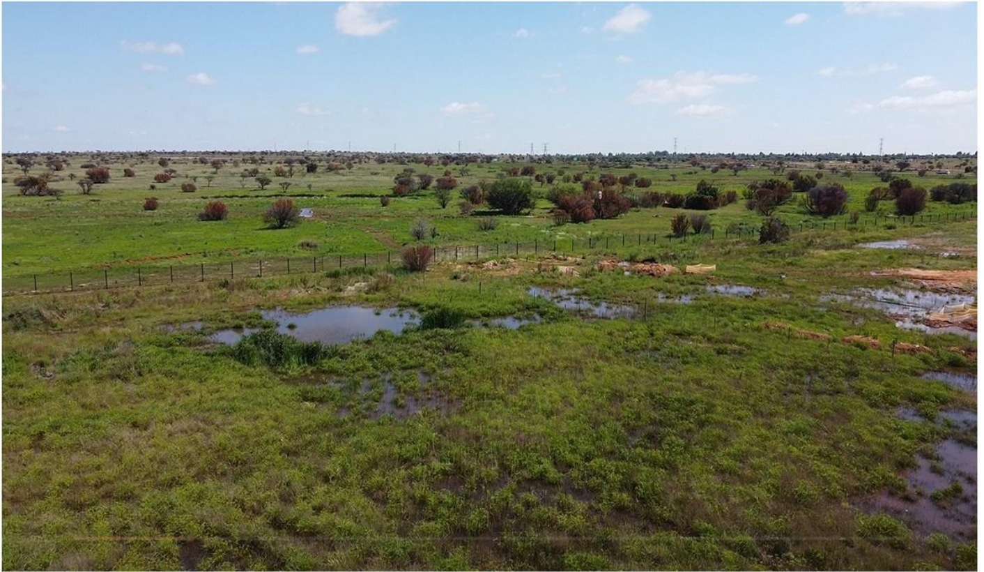
Figure seven shows and views a study area in a “NW” orientation.