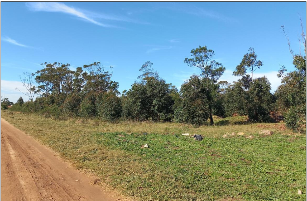
View of the site from the north-west corner.