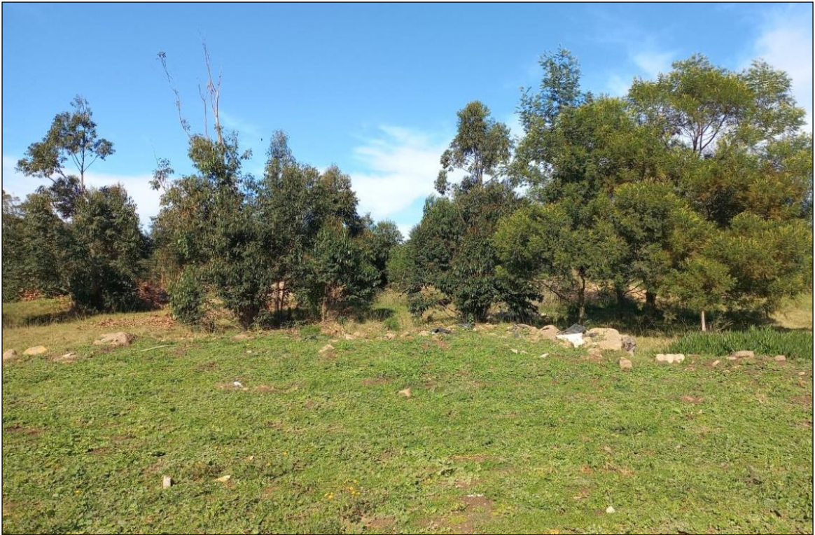
Alien vegetation and some spoil material covered with grass.