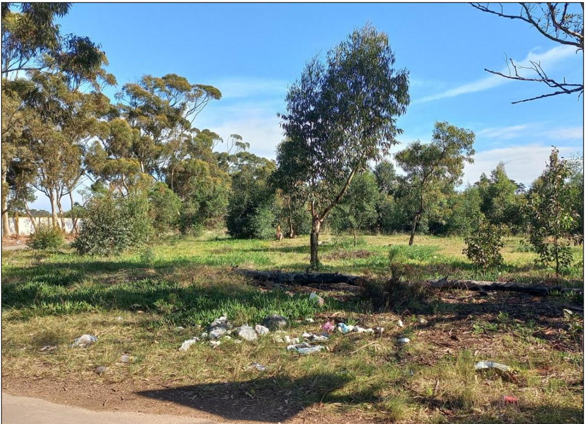
Illegal dumping observed along the inner boundary of the property.