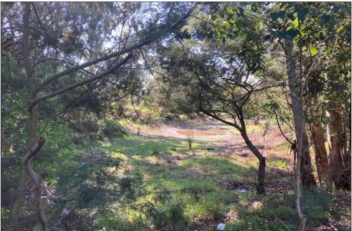
Wetland located on neighbouring property approximately 90m east of the site.