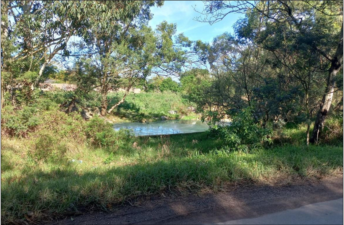
Drainage line located approximately 80m from the south-east corner of the site.