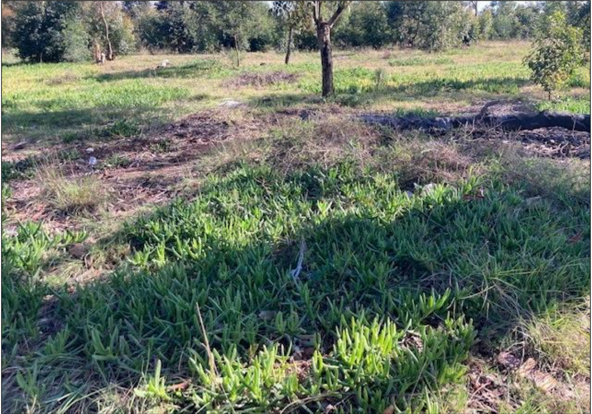
Natural groundcover observed within certain sections of the property.