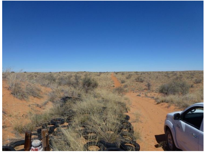
Photo 8: Taken from position 8, looking south-west along inspection road (existing pipeline). Dune stabilisation methods for existing pipeline evident in the image.