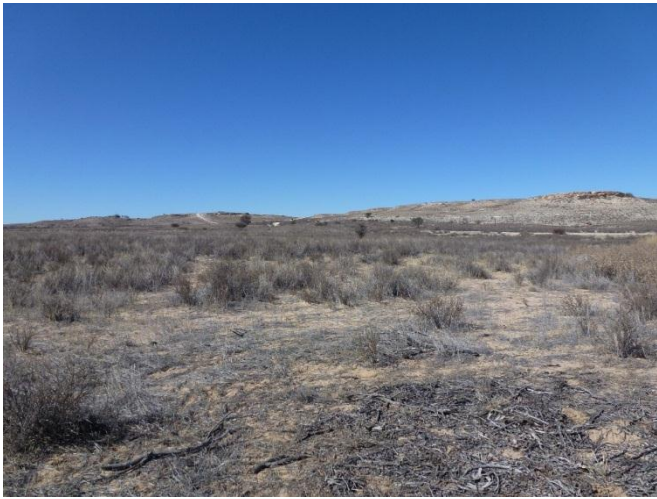
Photo 1: Taken from position 1, from the Molopo River, looking south towards the R340