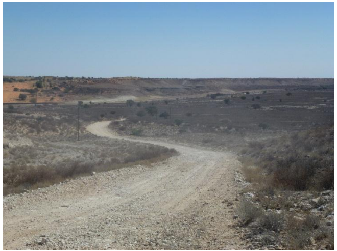
Photo 2: Taken from position 2, looking north down the R340, towards the Molopo River and Botswana border.