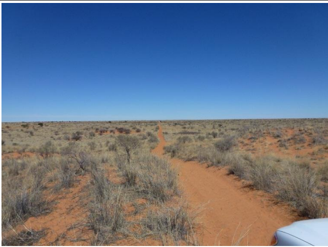
Photo 9: Taken from position 9, looking south-west along inspection road (existing pipeline). Proposed pipeline will be located on the right of the road