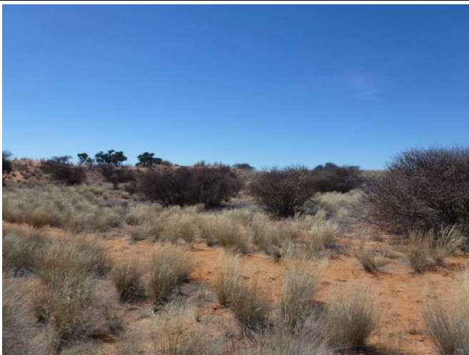
Photo 5: Taken from position 5, intersection of the R340 and inspection road (existing pipeline servitude), looking north-east towards proposed site camp location