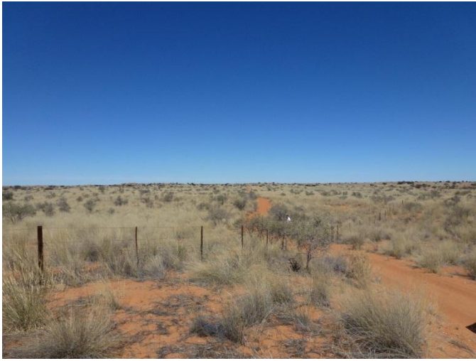
Photo 7: Taken from position 7, looking south-west along inspection road (existing pipeline), from one of the dunes