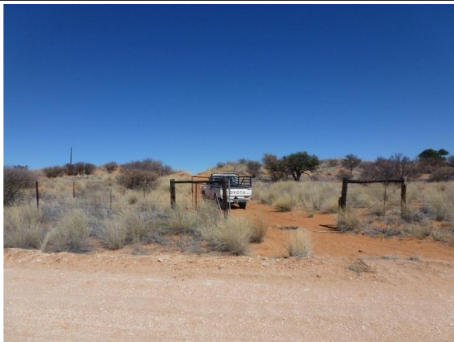
Photo 6: Taken from position 6, intersection of the R340 and inspection road (existing pipeline servitude),