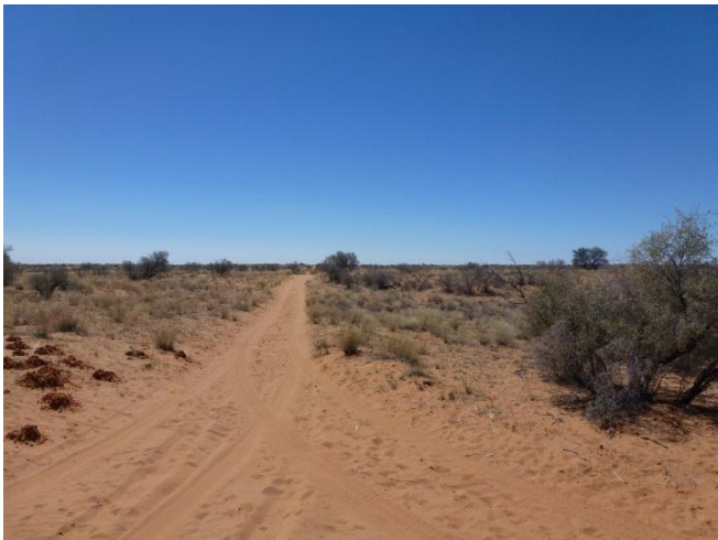
Photo 11: Taken from position 11, looking north-east along inspection road (existing pipeline)