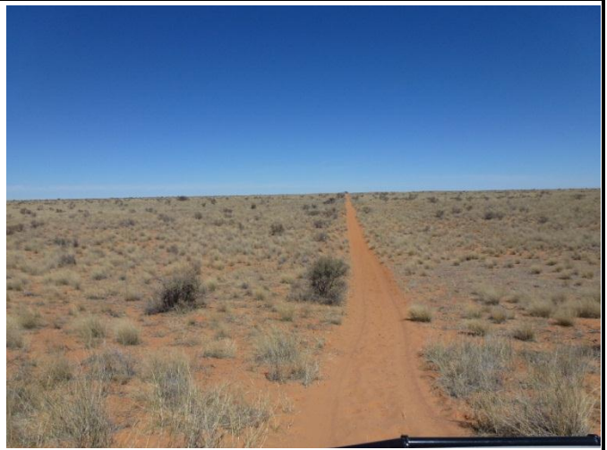
Photo 10: Taken from position 10, looking south-west along inspection road (existing pipeline)