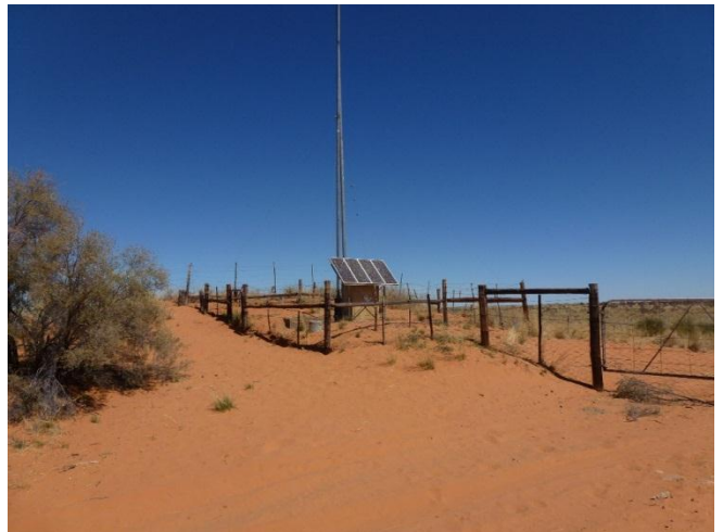
Photo 12: Taken from position 12, proposed link with existing D-Line (beginning of proposed pipeline)