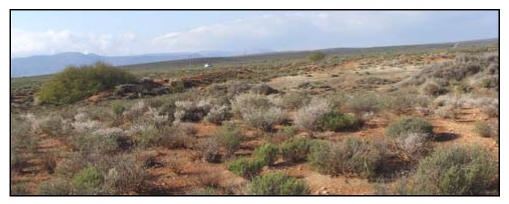
Figure B25: BP R27-8 KM 45.0 RHS 0.2: View towards the R27 (facing north-east)