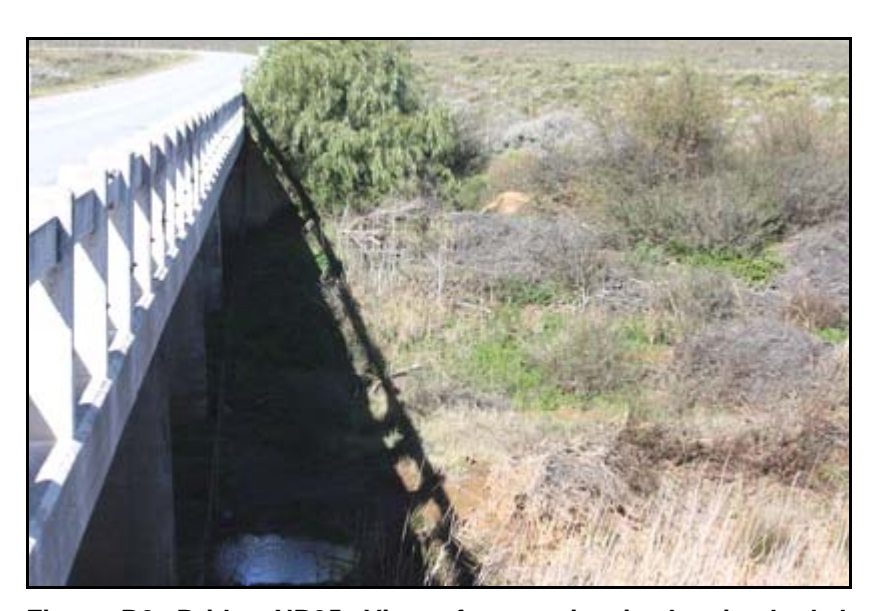
Figure B2: Bridge NB35: View of vegetation in the riverbed downstream of the bridge (facing south-east)