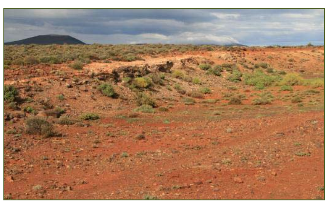
Figure B27: BP R27-8 KM 61.6 RHS 1.0: View of existing disturbed area (facing south-east)