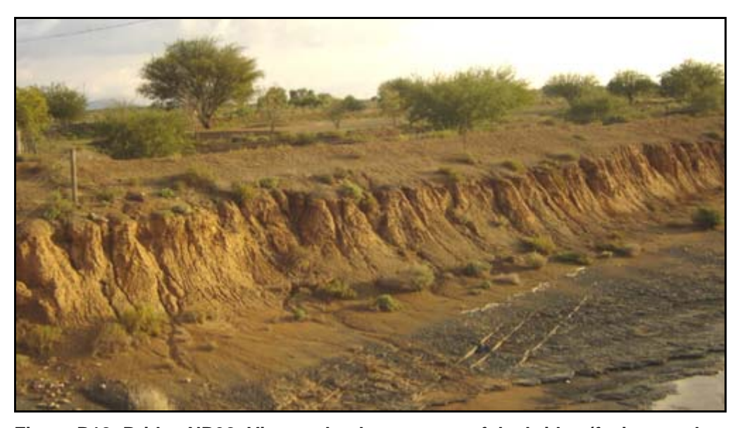
Figure B18: Bridge NB38: View to the downstream of the bridge (facing south-west)