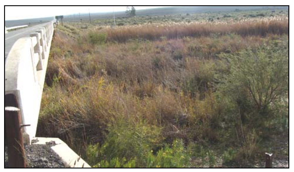
Figure B13: Bridge NB37: View of vegetation in the riverbed upstream of the bridge (facing west)