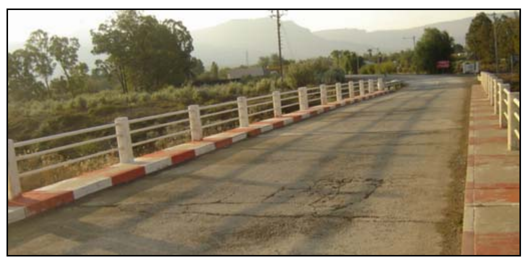
Figure B15: Bridge NB38: View of the R27 across the bridge with the outskirts of Calvinia in the background (facing north)