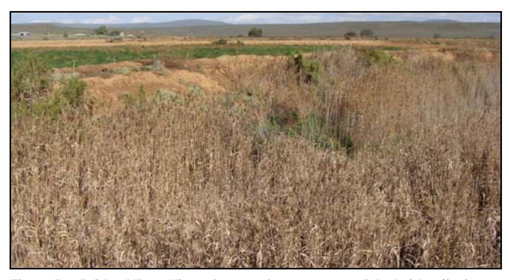
Figure B9: Bridge NB36: View of vegetation upstream of the bridge (facing south)