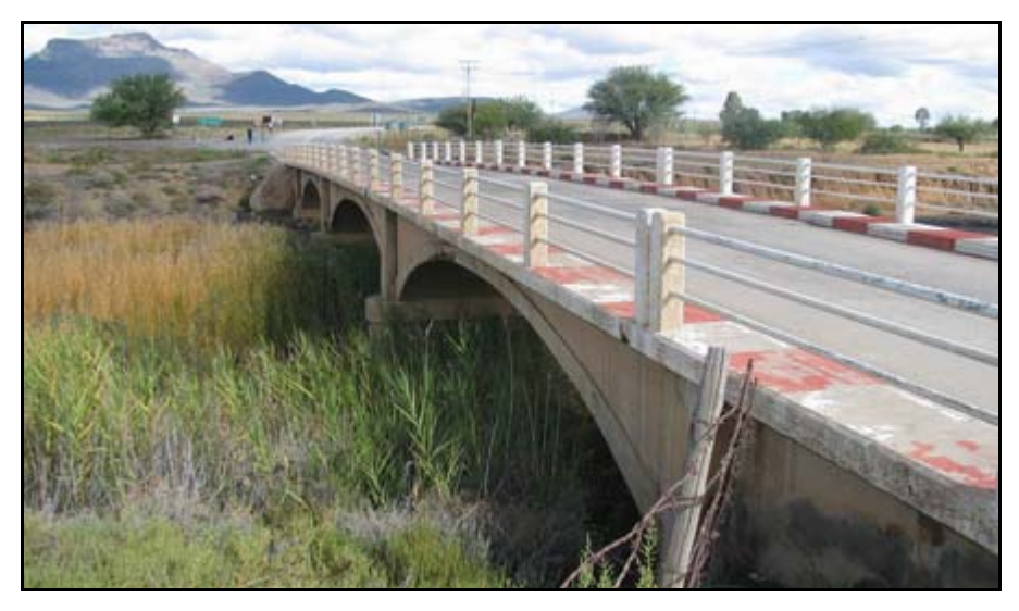
Figure B19: Bridge NB38: View of vegetation in the riverbed upstream of the bridge (facing southwest)