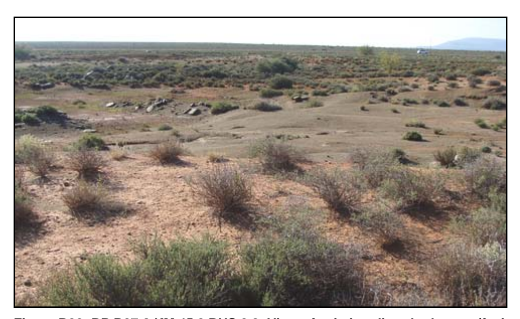
Figure B26: BP R27-8 KM 45.0 RHS 0.2: View of existing disturbed areas (facing north)