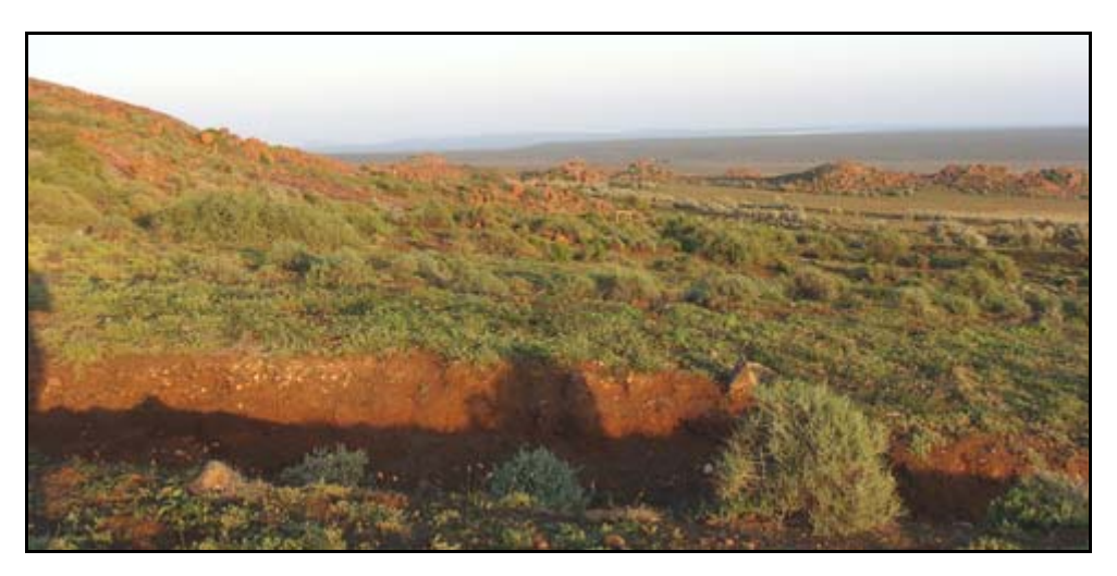
Figure B23: BP R27-8 KM 32.6 RHS 6.2: View of the surrounding area (facing west)