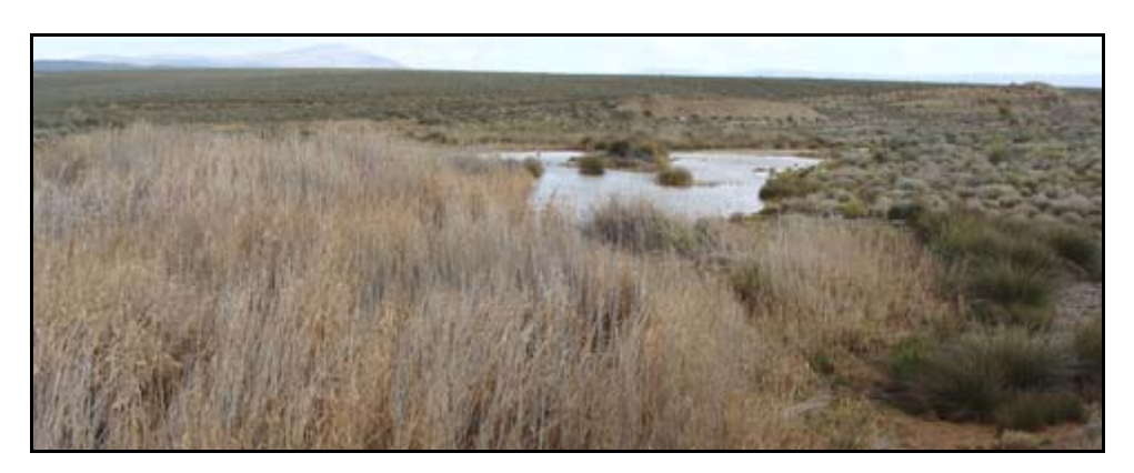
Figure B12: Bridge NB37: View to the downstream of the bridge (facing south-west)