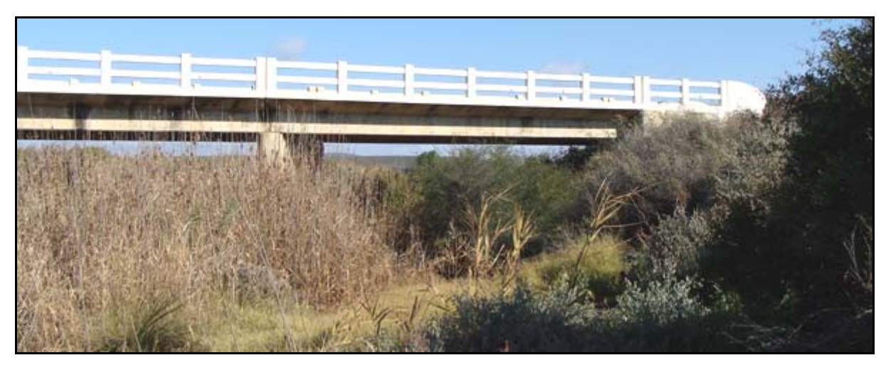
Figure B7: Bridge NB36: View of the bridge from within the watercourse (facing south)