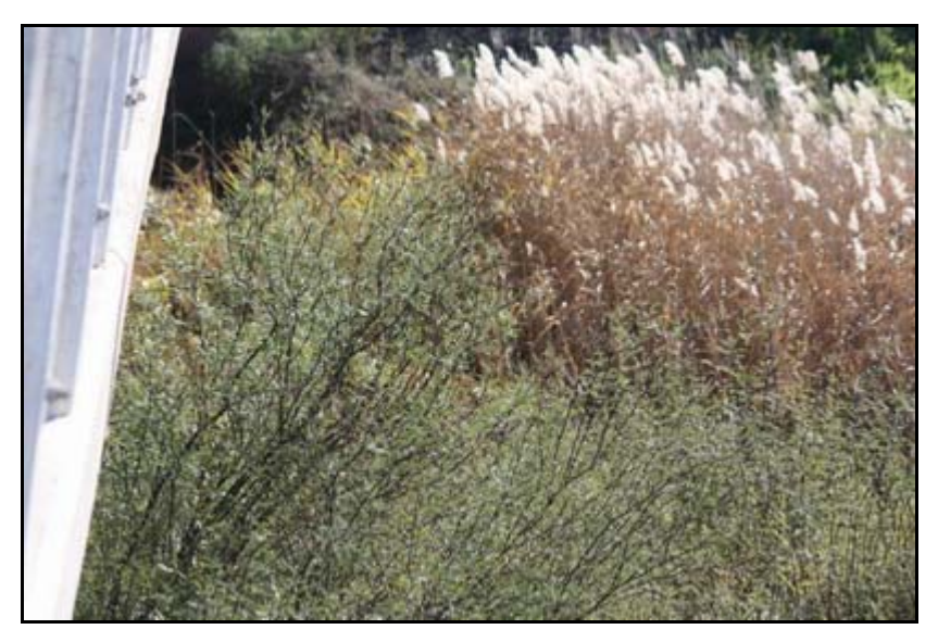
Figure B4: Bridge NB35: View of vegetation in the riverbed upstream of the bridge (facing east)