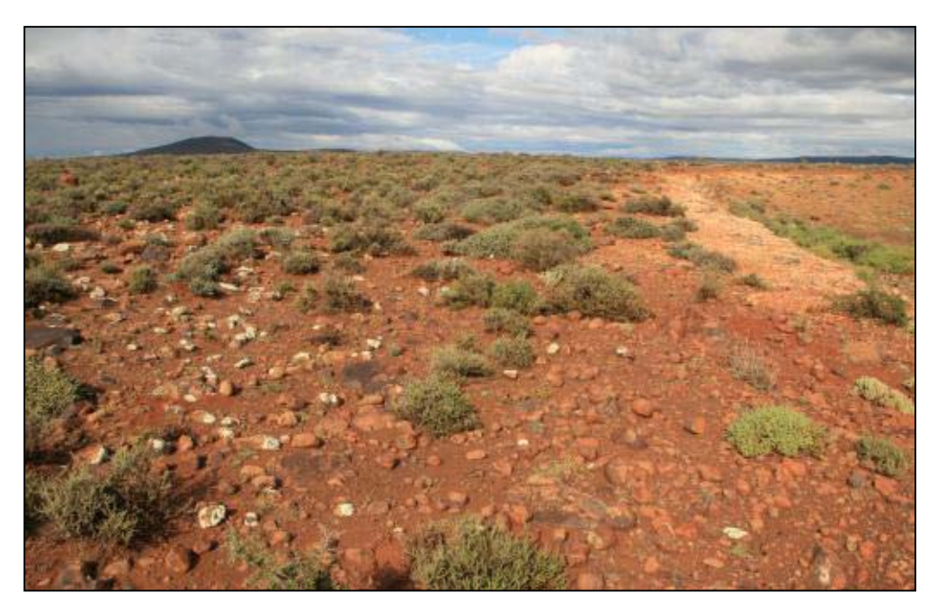
Figure B29: BP R27-8 KM 61.6 RHS 1.0: View of eastern edge of the existing borrow area (facing south-east)