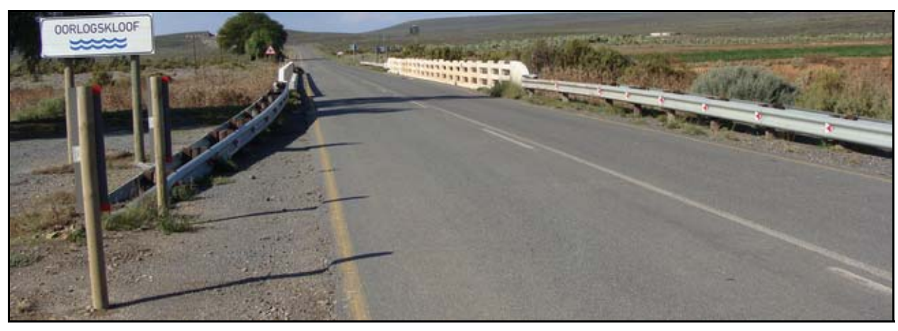
Figure B.6: Bridge NB36: View of the R27 across the bridge deck (facing east)