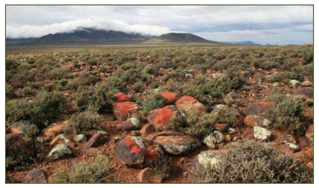
Figure B28: BP R27-8 KM 61.6 RHS 1.0: View of surrounding area (facing south-east)