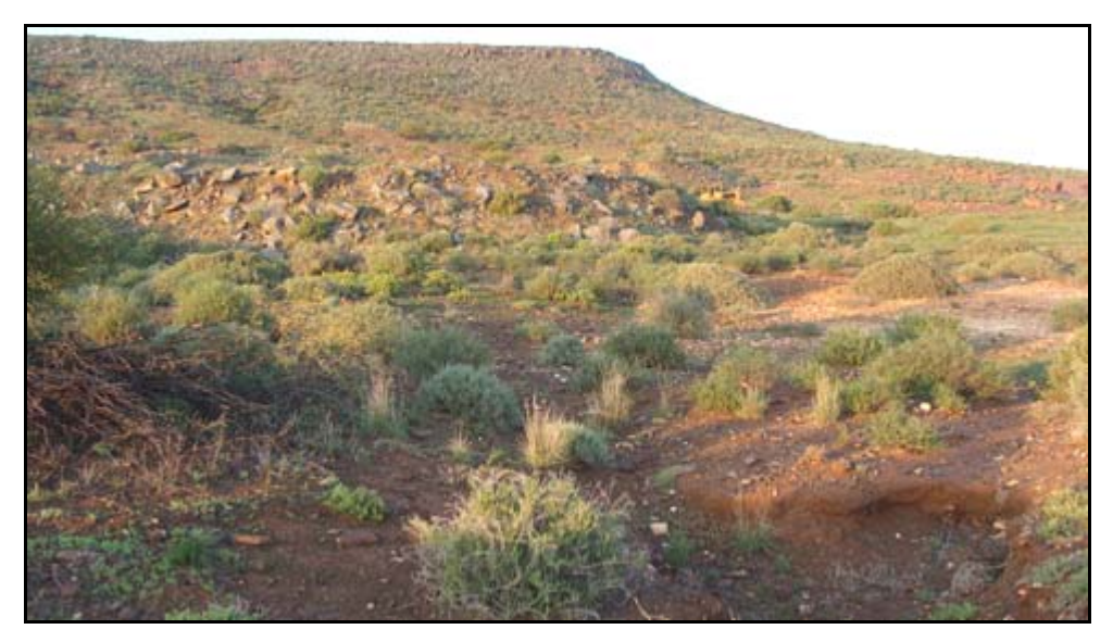
Figure B22: BP R27-8 KM 32.6 RHS 6.2: View of the existing tailings heap to be excavated (facing south-west)