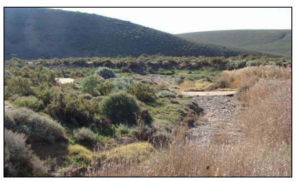
Figure B8: Bridge NB36: View to the downstream of the bridge (facing north-west)