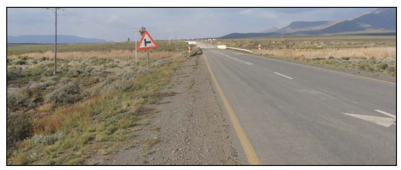
Figure B10: Bridge NB37: View of the R27 across the bridge (facing east)