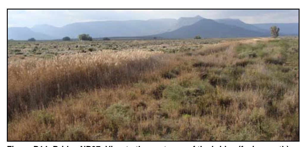
Figure B14: Bridge NB37: View to the upstream of the bridge (facing north)