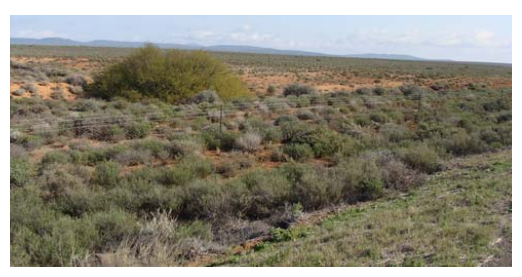
Figure B24: BP R27-8 KM 45.0 RHS 0.2: View from the R27 towards the existing excavated area (facing south-west)