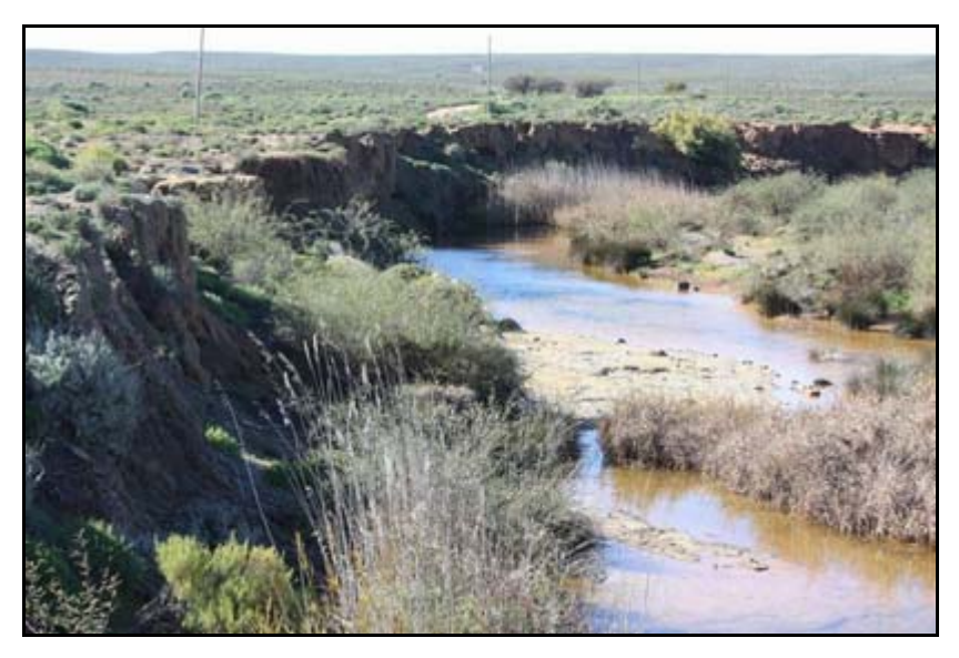
Figure B5: Bridge NB35: View to the upstream of the bridge (facing east)