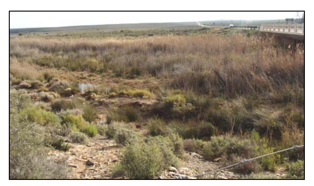
Figure B11: Bridge NB37: View of vegetation in the riverbed downstream of the bridge (facing north-west)