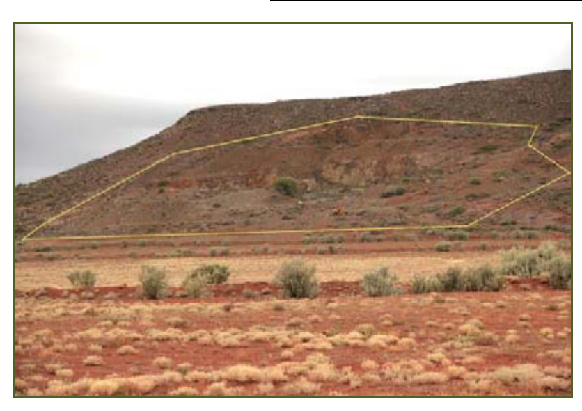
Figure B21: BP R27-8 KM 32.6 RHS 6.2: View of the site, with the abandoned Iceland Spar mine outlined in yellow (facing south-east)