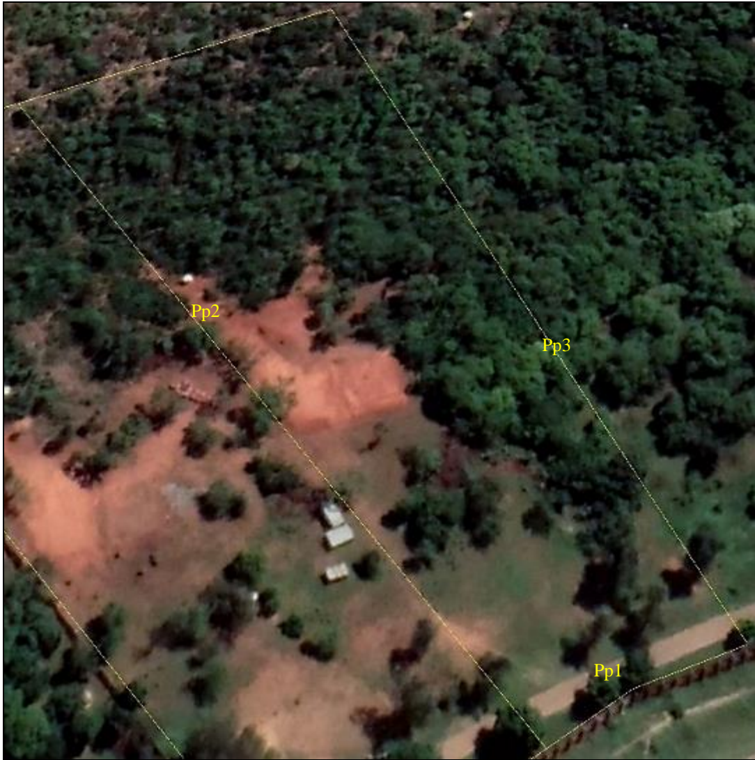
Figure 2: Photographic position 1 (Pp1) looking North to north-east.