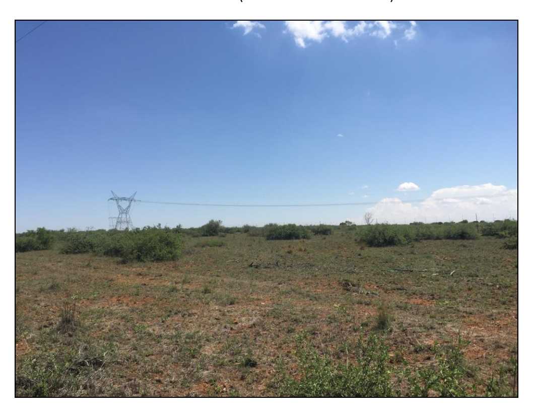
Plate 2: The site (taken towards the north-east)