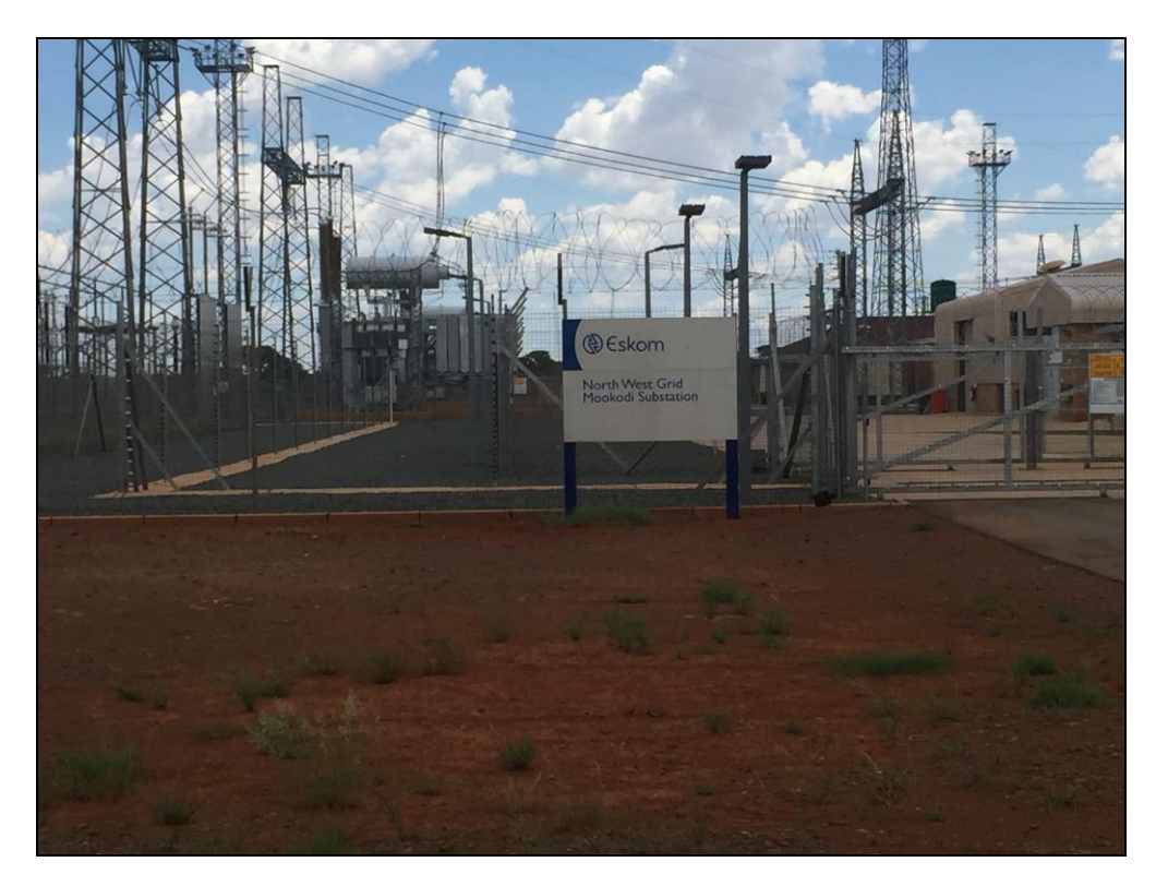
Plate 12: Vegetation on site