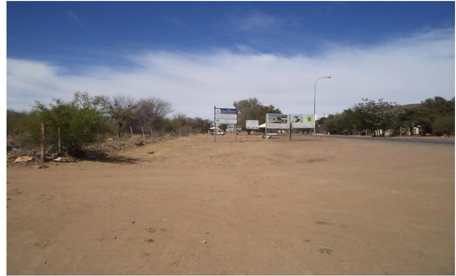
At the site entrance to the existing Olifantshoek substation