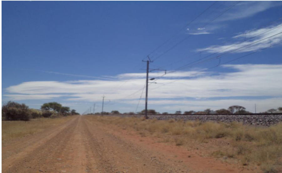
Existing servitude tracks for the lines to the Emil switching station