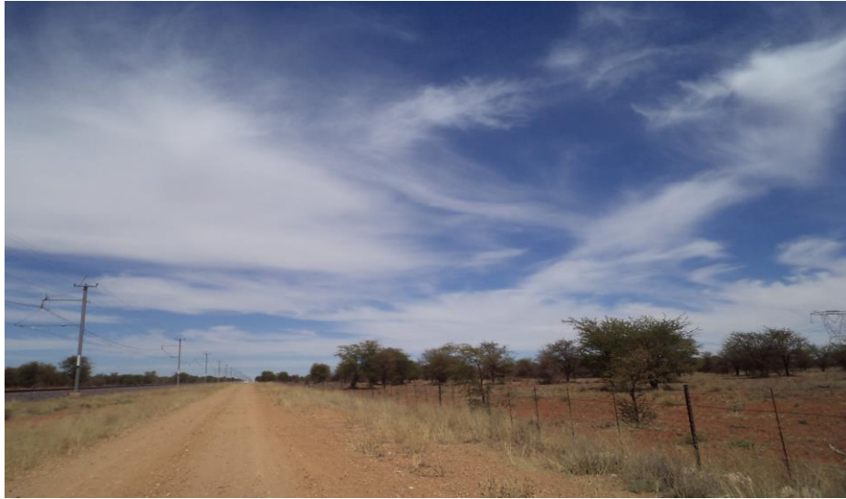
Exiting tracks leading to the Emil switching station