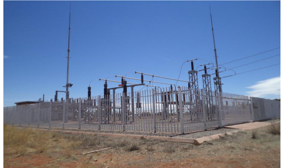
The Emil switching station