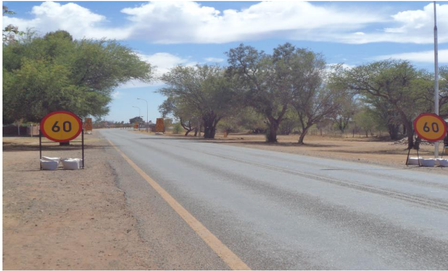
Access road leading to the existing Olifantshoek substation