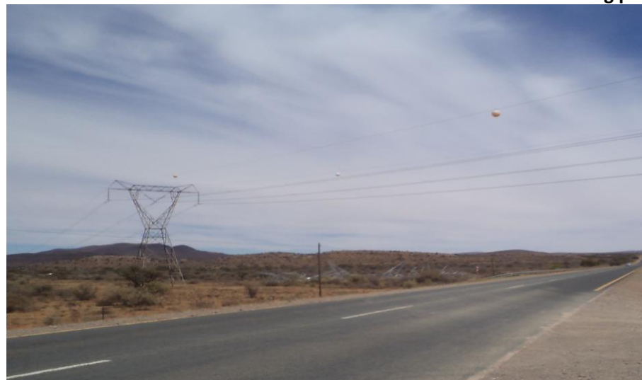
Existing Servitudes crossing the N14