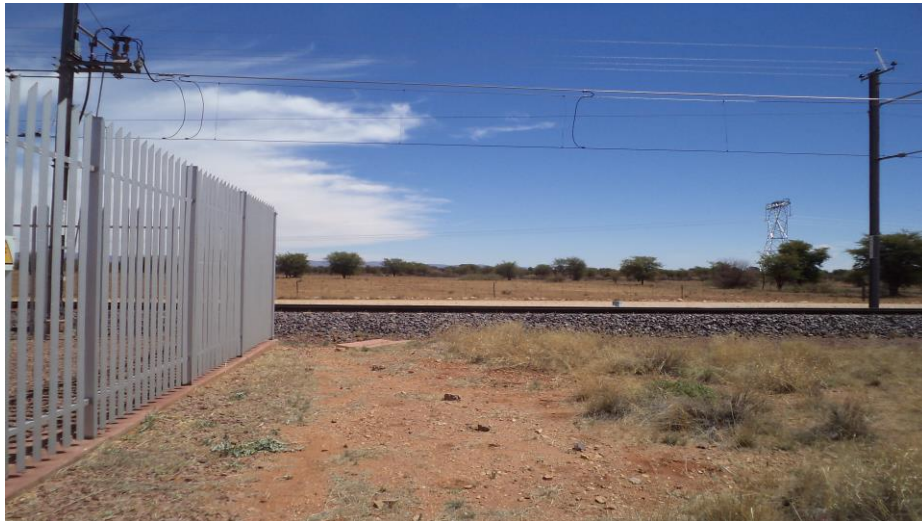
Existing lines turning-in at the Emil switching station