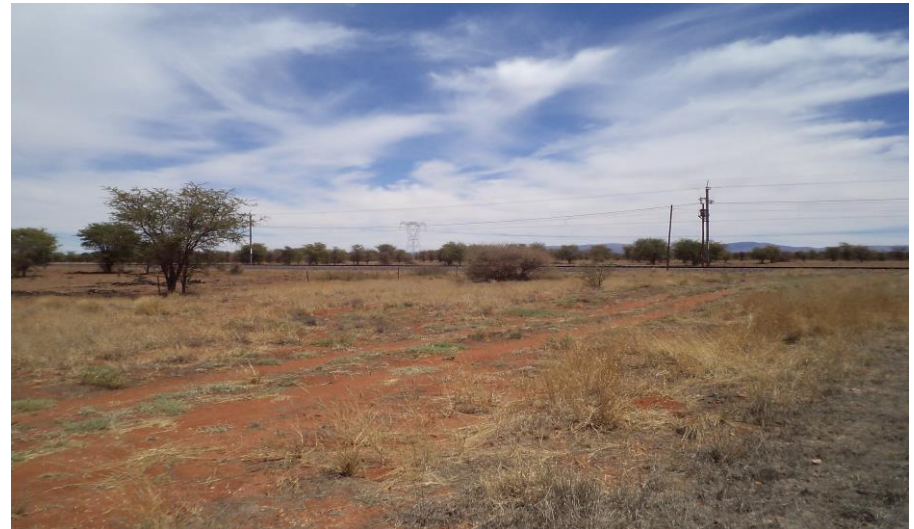
General character of the surrounding landscape at the Emil switching station