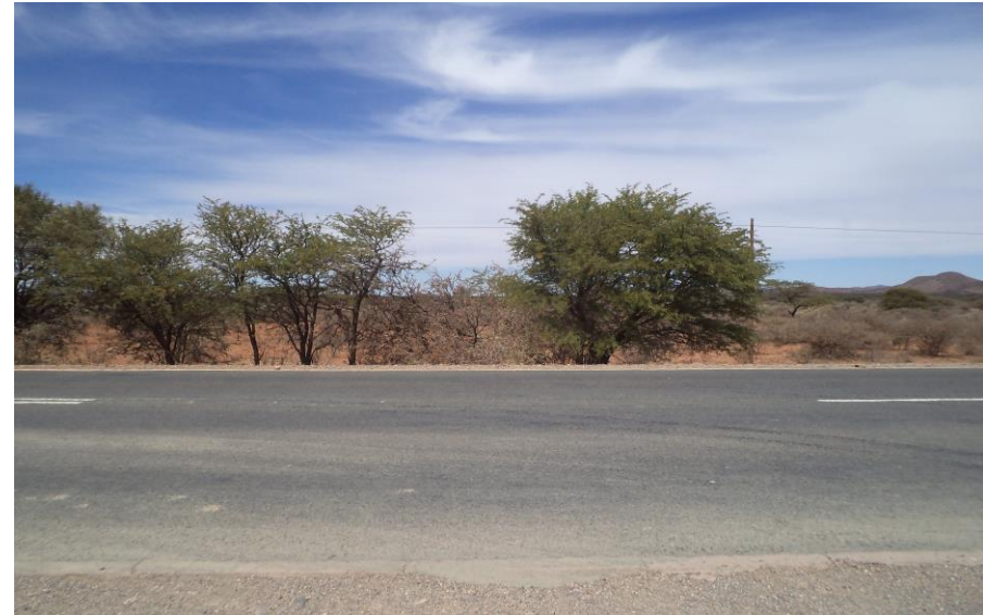
View from the Shoulder looking onto the N14 and at the existing servitude running parallel to the N14