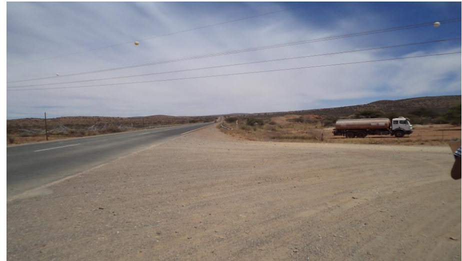
Exit off the N14 onto Industrial Road. Please refer to Page 14 of the BAR (Figure 4)