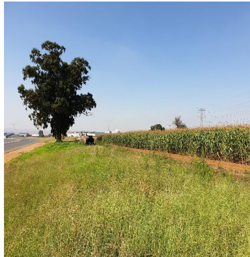
Figure 2: General road verge with invasive Eucalyptus tree and adjacent maize plantation visible