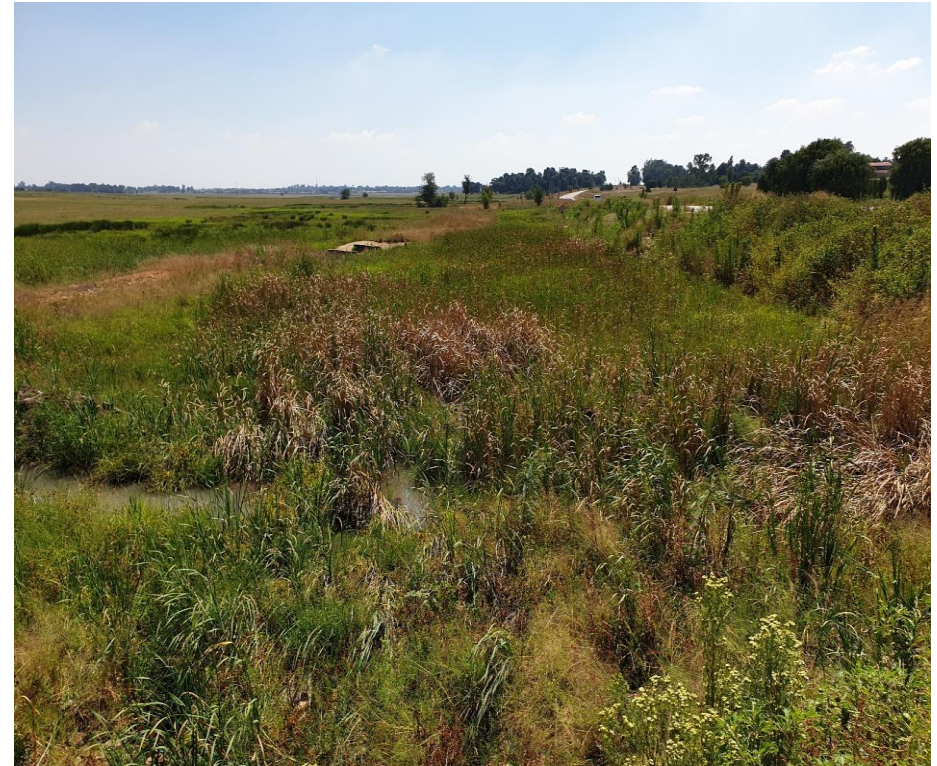
Figure 4: Illustration of the most intact wetland vegetation unit on site, immediately adjacent the road at the intersection of the Nigel-Springs Road and the M45

Site photographs were taken in March 2019.