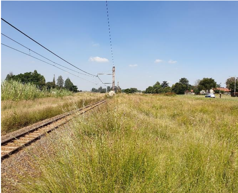
Figure 3: The railway tracks adjacent to which the proposed pipeline will route near Dunnottar town