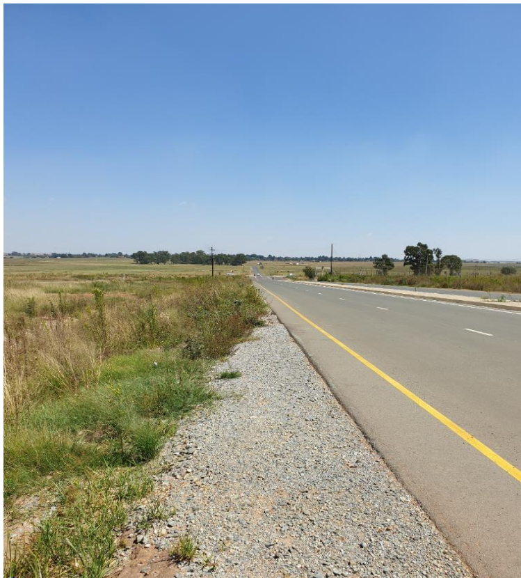
Figure 1: Topography of the development corridor, showing generally flat terrain