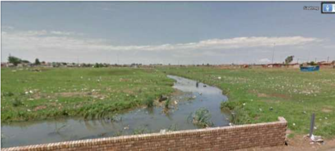
Figure 4: General characteristics of Wetland 3 as seen from Vlakfontein Road south of the pipeline