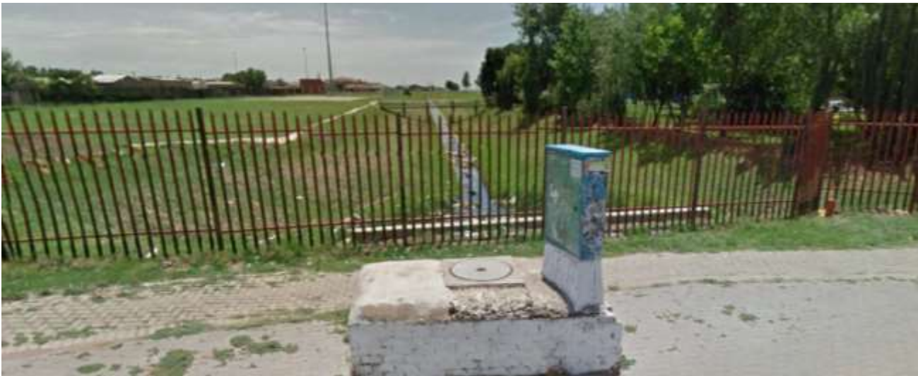
Figure 8 Characteristics of the canal from Kgaswane Street