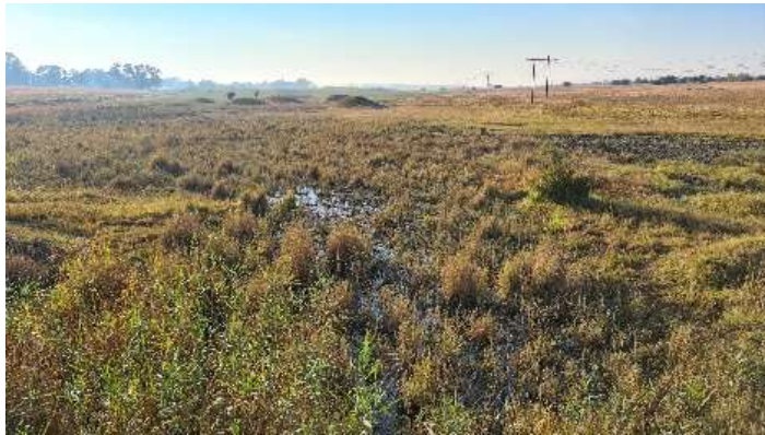
Figure 2: Upstream of proposed impact. Drains from tailings facility under Tonk meter drive.