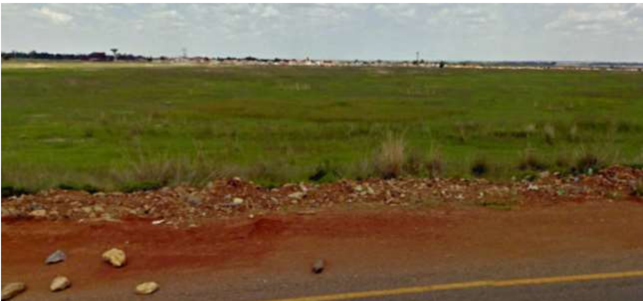
Figure 3: General characteristics of Wetland 2