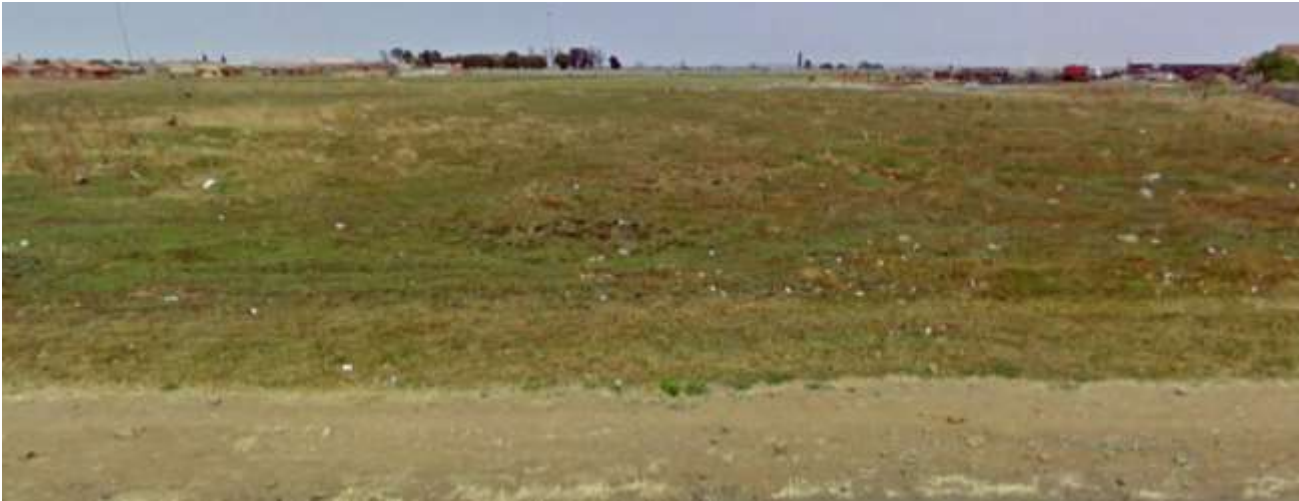
Figure 7: Characteristics of Pan 2 from Rhokana Street