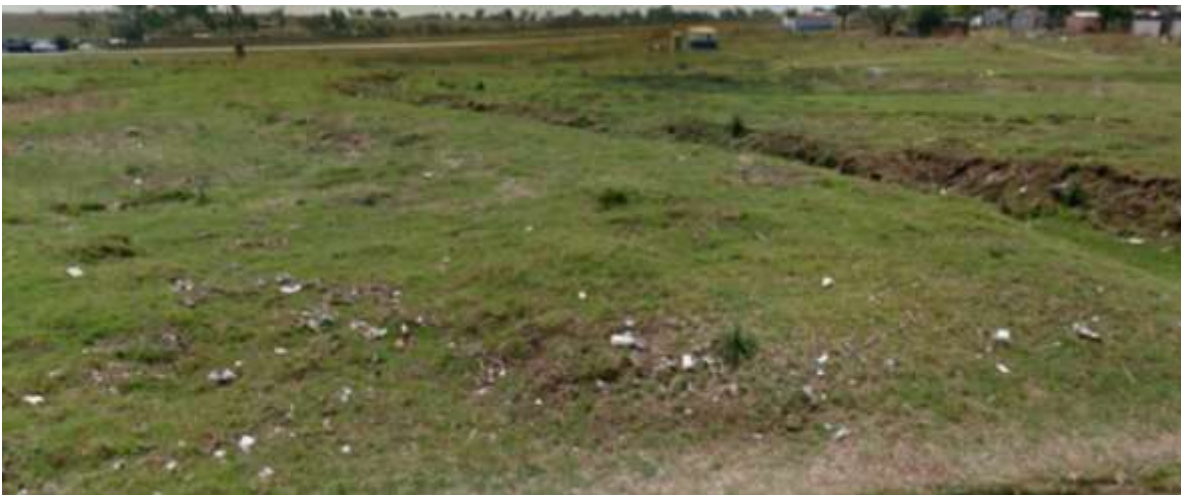
Figure 5: General characteristics of Wetland 4 as seen from Thema Road