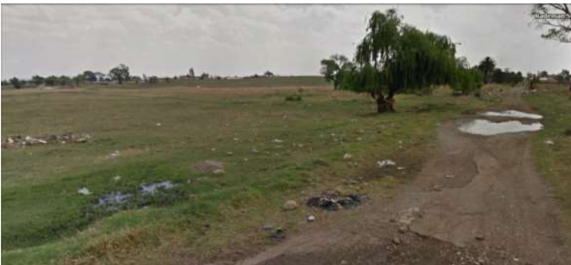
Figure 6: General characteristics of Wetland 5 as seen from Rademan Street.