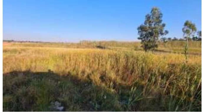
Figure 1: Vegetation characteristics of the wetlands on site